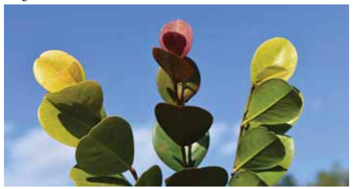
Figure 3. Left to right: New growths of 'Horizontal,' 'Red Tip,' and 'Green Tip' cultivars.

'Red Tip' is a cultivar of the inland form of cocoplum. The color of the new leaf growth is burgundy-red, becoming yellowish-green and then dark-green. The mature fruit color is usually purple. This cultivar has become the dominant cocoplum hedge of south Florida. There is also reference to a 'Green Tip' cultivar. This may simply be a way of describing plants of the inland ecotype without the burgundy-red new growth. They have light-green new leaves that become dark-green. Mature fruit color is predominantly white and often blushed with pink. Both cultivars are capable of growing up to 25 feet or more in height.