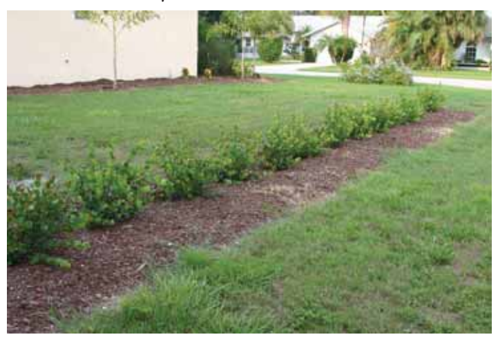
Figure 18. The start of a 'Red Tip' hedge.

Bushy shrubs (mostly of the inland ecotypes) may be pruned into small, multi-trunked trees. Cocoplum's nutritional requirement is low. However, young plants grow faster with adequate fertilization. Once a plant reaches four or more feet tall in a hedge row of the inland ecotype, fertilization is rarely (if ever) needed.