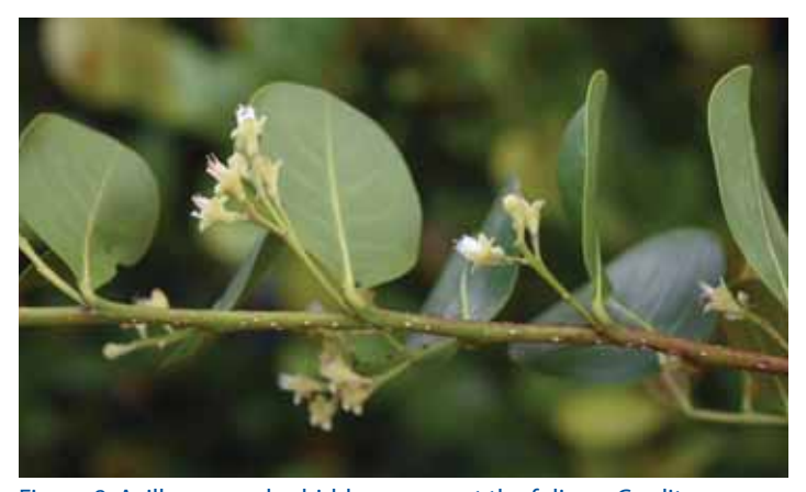
Figure 8. Axillary cymules hidden amongst the foliage.

Flowering is mostly from January to August, but the main flowering period is usually late spring. The flowers occur in rather inconspicuous, short, axillary, and terminal clusters called cymules (few-flowered, poorly branched inflorescences in which the central flower matures first). Each flower is perfect (with both male and female sexual organs), and measures about 0.25 inch long. The five distinct (unfused), spreading, pale greenish-to-yellowish sepals and five narrow, white petals are borne atop a conical receptacle (flower base or axis). The stamens vary in number from 12 to 25, and are irregularly fused into an erect, densely hairy tube in the center of the flower. The ovary is also shaggy and hairy, but the hairs are lost as the fruit develops.