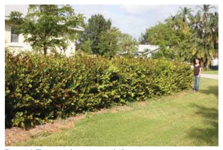
Figure 19. The same plants, 14 months later.