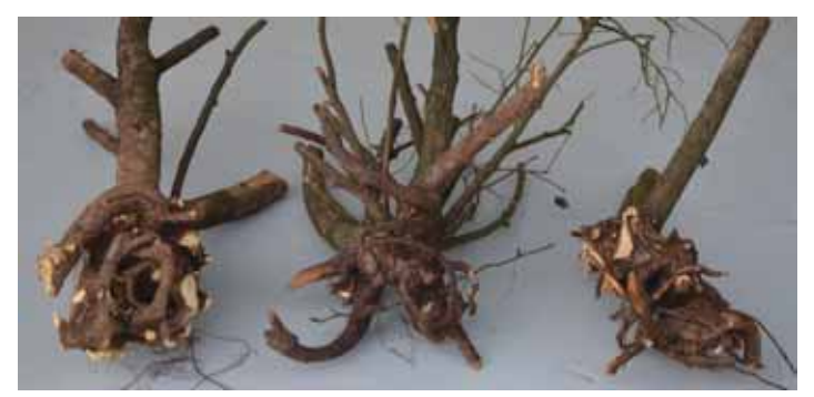
Figure 29. Circling roots of pot-bound cocoplums. Credits: Stephen H. Brown, UF/IFAS

Plant disorders are caused by abiotic (non-living) factors (such as environmental stress), including over-irrigation, drought, or excessive pruning. Cocoplum and other plants may slowly decline when planted after being pot-bound for several years. The decline is especially pronounced when a plant is heavily mulched and exposed to prolonged soil moisture. Decline symptoms are similar to those of Botryosphaeria canker and blight.