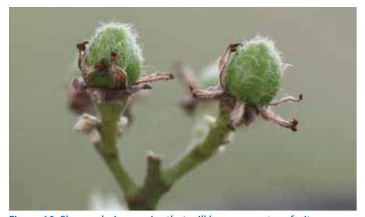
Figure 10. Shaggy, hairy ovaries that will become mature fruit.