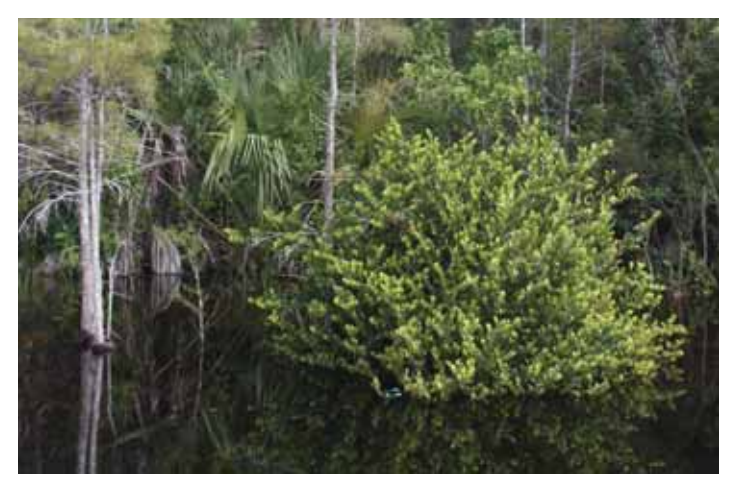
Figure 16. Cocoplum seasonally inundated by fresh water.