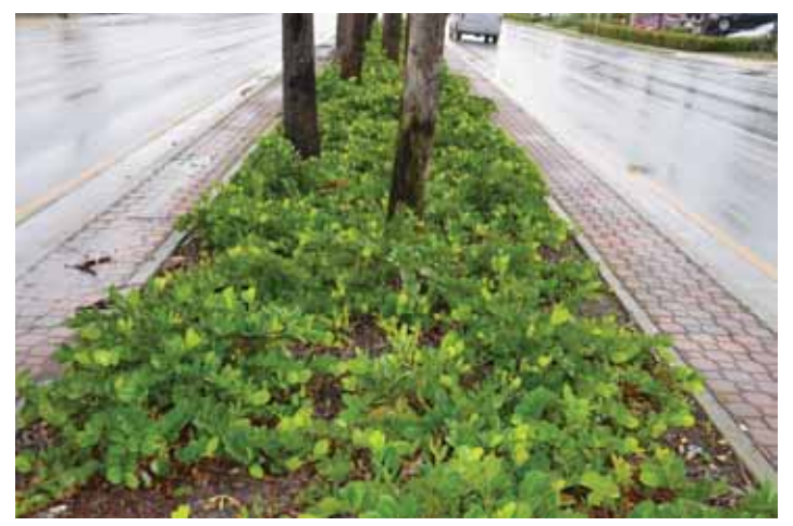
Figure 20. Recently planted 'Horizontal' cultivars in a 9-foot-wide roadway median.