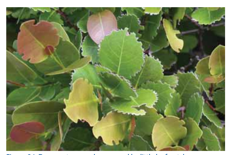
Figure 24. Damage to cocoplum caused by little leaf notchers.