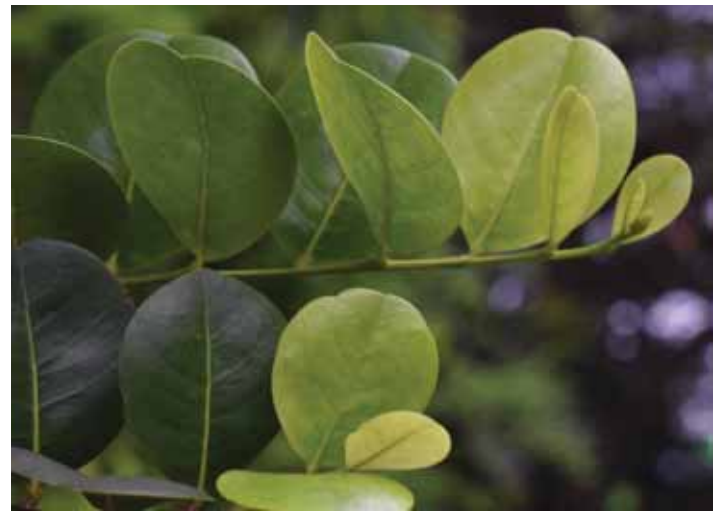
Figure 14. Simple, rounded, and rather leathery leaves alternately arranged and angled upward forming a V shape.