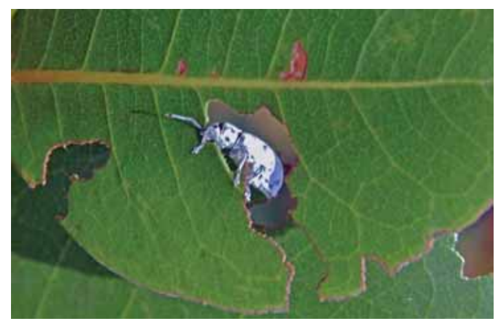
Figure 25. Sri Lanka weevil feeding on cocoplum.