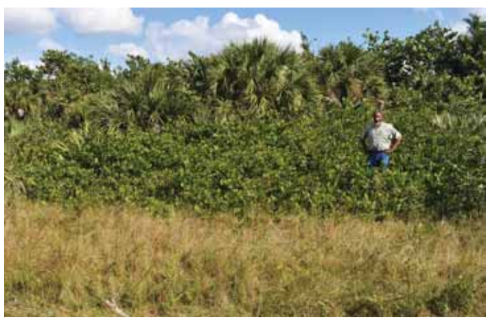
Figure 1. A portion of a single, fourteen-year-old, unpruned coastal form of mounding cocoplum.

A second form occurs mostly inland away from the coasts. Plants are fast, upright growers usually becoming 15 to 25 or more feet tall with an equivalent or wider width. They are either single or multi-trunked plants. The trunks of older single-trunked specimens are usually 5 to 7 inches in diameter. Branching may not occur until several feet above the ground, at which point they become densely foliated. Older multi-trunked plants also have dense foliage that touches the ground, giving them a symmetrical rounded or dome-shape appearance.