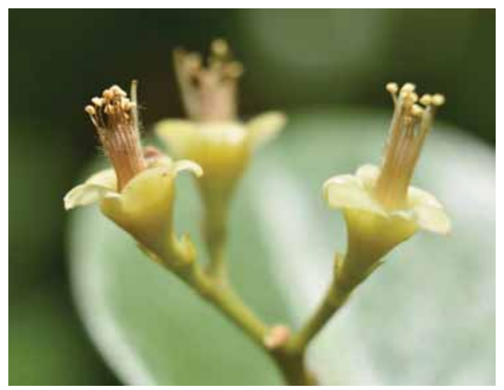
Figure 9. Flowers in cymule. The spreading, pale-yellowish structures are the sepals (petals have already apparently been shed).