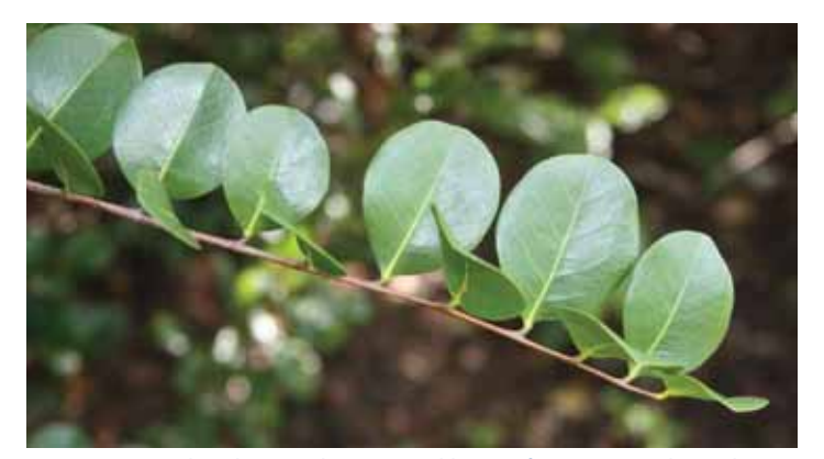
Figure 6. Upright, alternately arranged leaves forming a V-shaped angle.

Cocoplum leaves are alternate, simple, and entire. They point upwards, forming a V-shaped angle along the upper side of the stem. The blades are mostly 1.5 to 3.50 inches long, broadly elliptic, obovate (wider above the middle) or nearly round, and attached to a short petiole approximately 0.125 inches long. The tips may be slightly pointed, rounded, or notched. The base usually tapers to a point or is obtuse or rounded. The margins are thinly and tightly revolute (rolled under), which can be felt by moving a finger across the lower leaf margins. New leaves are thinner-textured, yellowish-green or often red-tinged. With age, they become leathery, smooth, shiny, and dark-green on the upper surface and a paler, matte green below. Midveins are lighter colored and prominent, except toward the distal (uppermost) portion of the blades.