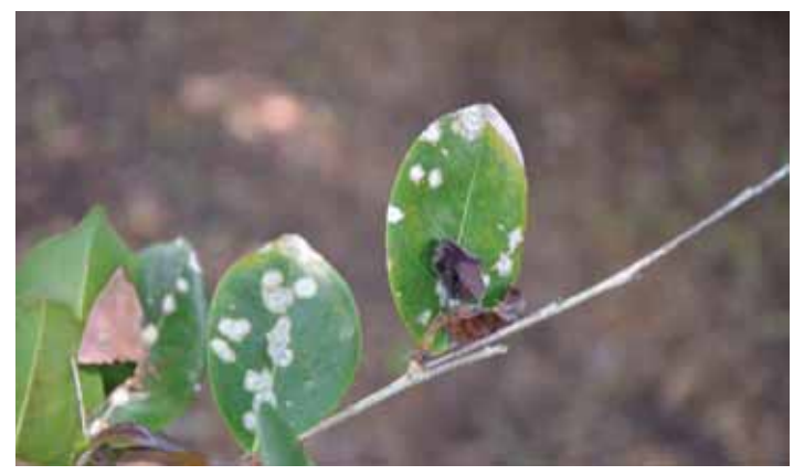
Figure 27. Algal leaf spot and stem dieback caused by Cephaleuros virescens.

been water-stressed. If infection happens in the crown, the whole plant may die.