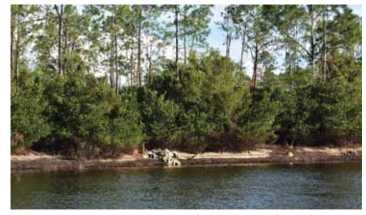
Figure 2. Naturally occurring plants of inland upright form of cocoplum.