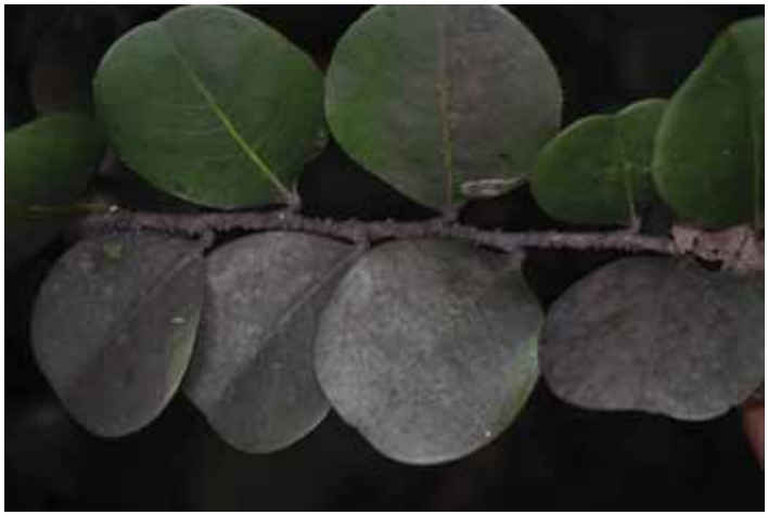
Figure 23. Residual lobate lac scales and accompanying sooty mold.

The little leaf notcher ( Artipus floridanus ) makes shallow notches along the leaf blades sometimes so uniform that they appear to be natural leaf serration rather than feeding damage. The Sri Lanka weevil ( Myllocerus undecimpustulatus undatus ) chews both shallow and deep notches along the leaf margins. The feeding pattern is very noticeable.