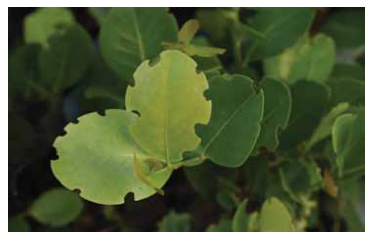
Figure 26. Damage to cocoplum caused by Sri Lanka weevil.