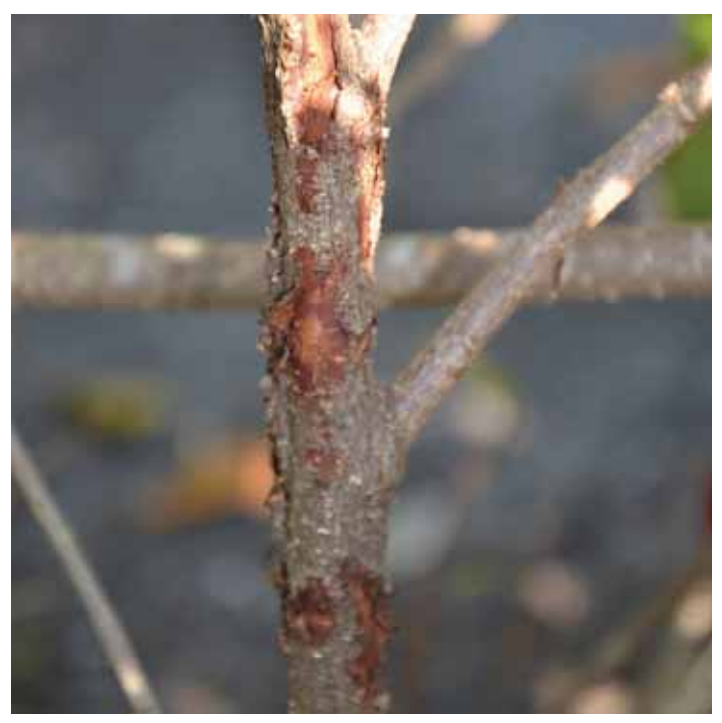
Figure 28. Botryosphaeria canker on cocoplum.