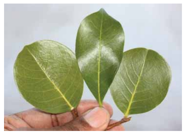
Figure 7. Leaf blades are broadly elliptic, obovate (center), or nearly round. Apices are rounded, abruptly pointed, or notched.