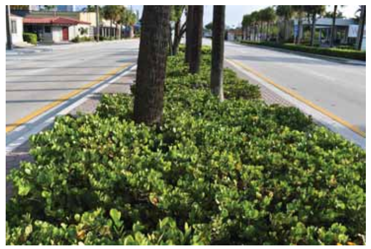
Figure 21. The same plants four years later and maintained at 20 inches tall.