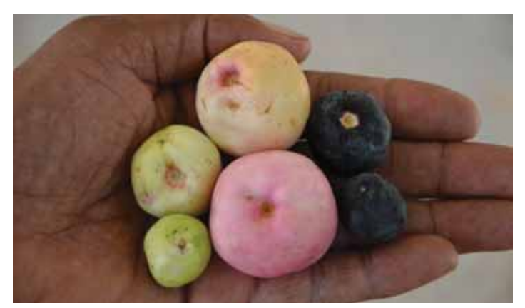
Figure 12. Typically appearing fruits. Left: 'Green Tip,' Center: 'Horizontal,' Right top: 'Green Tip,' Right bottom: 'Red Tip'.