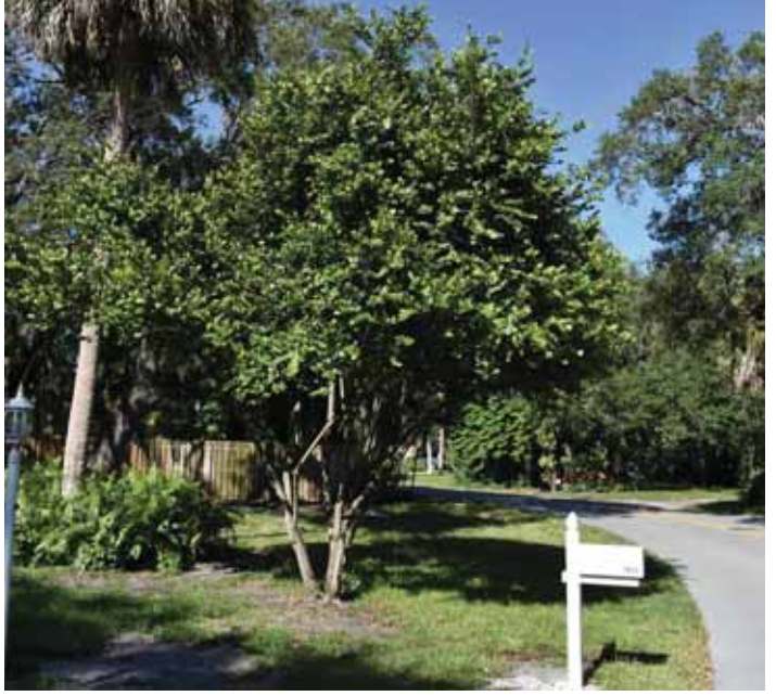
Figure 22. Small, multi-trunked 'Red Tip" tree about 15 feet tall.