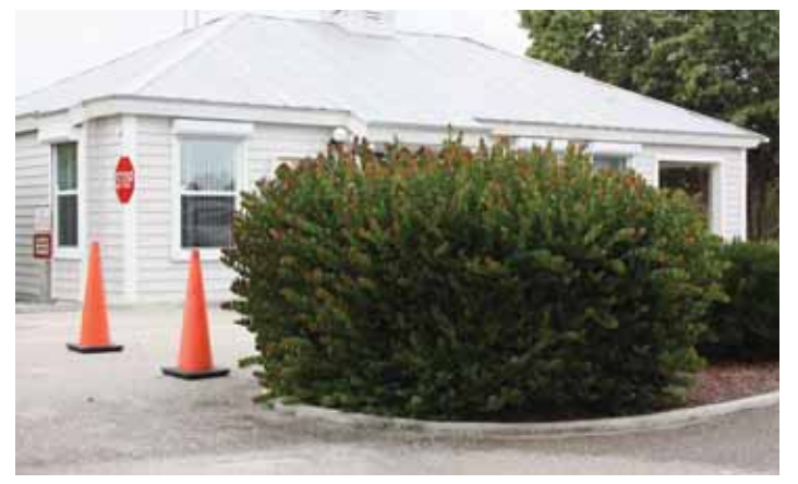
Figure 17. Cocoplum in high pH soil.