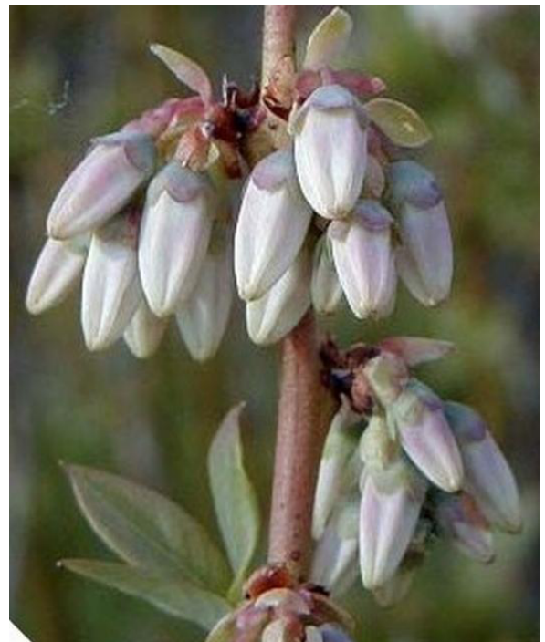
Figure 5. Flower bud stage 5.