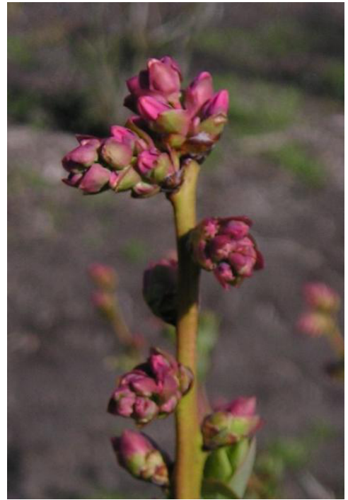
Figure 4. Flower bud stage 4.