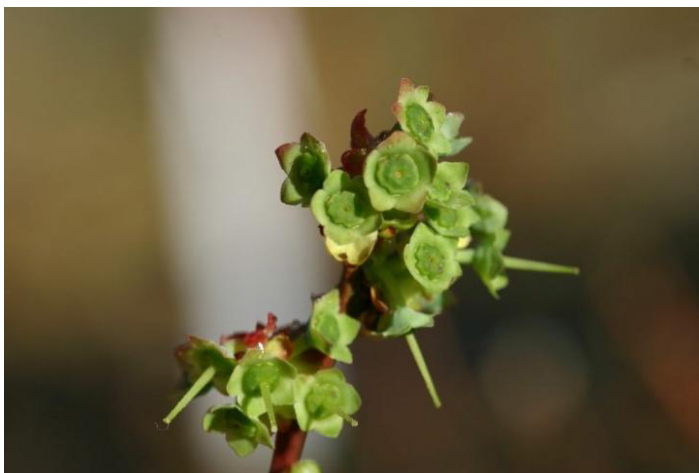
Figure 7. Flower bud stage 7. Credits: Jeff Williamson