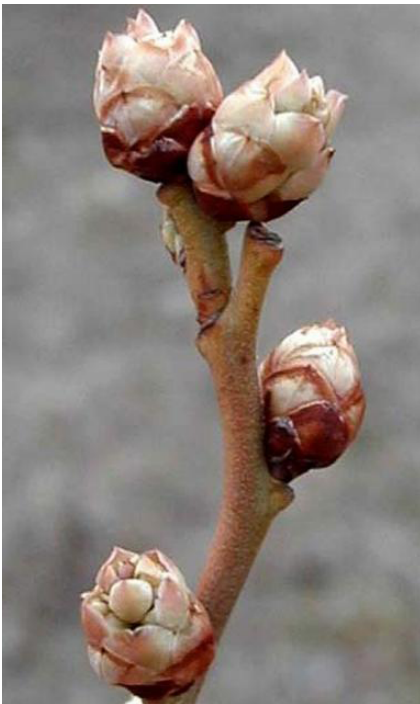
Figure 3. Flower bud stage 3.