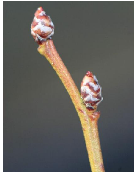
Figure 1. Flower bud stage 1.