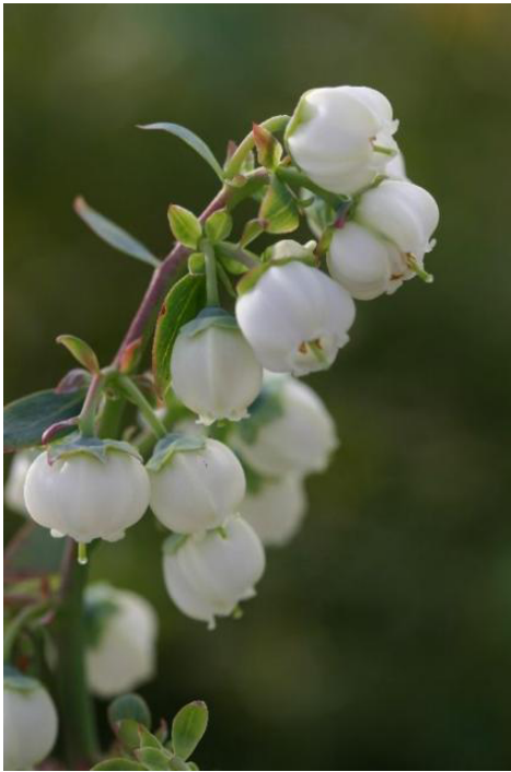
Figure 6. Flower bud stage 6.