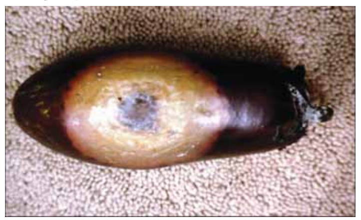
Figure 4. Fruit rot in eggplant caused by Phytophthora capsici .

Although the entire plant may be susceptible, fruit rot is the primary symptom caused by P. capsici in eggplant. It begins as a round, dark brown area on any part of the fruit at any stage of maturity. The initial lesion is surrounded by a rapidly expanding light tan region (Figure 4). White to gray fungal-like growth may appear during wet, humid periods, starting on the oldest part of the fruit lesion. Phytophthora fruit rot in eggplant lacks the concentric patterns and dark fruiting structures present with Phomopsis rot, a fungus that also causes fruit rot on eggplant in Florida. Fruit rot in eggplant may also be caused by other Phytophthora spp. and Phomopsis sp.