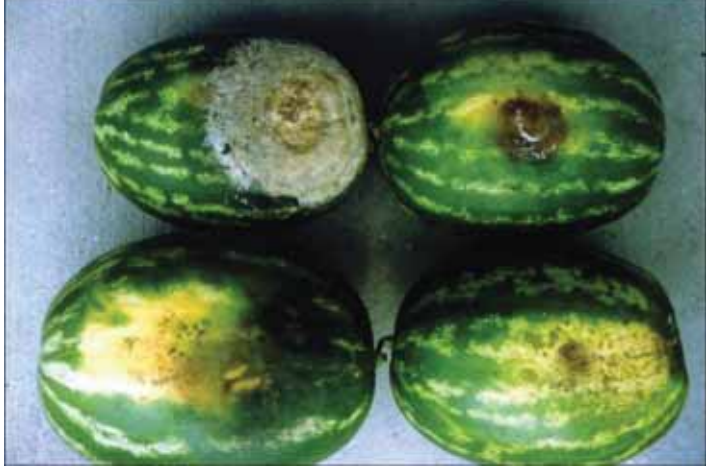
Figure 9. Various stages of fruit rot of watermelon caused by Phytophthora capsici . Bottom, early symptoms; top, advanced symptoms.