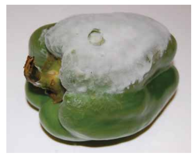
Figure 3. Fruit rot in pepper caused by Phytophthora capsici .