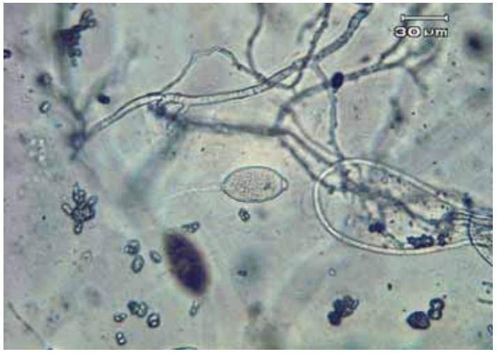
Figure 12. Lemon-shaped sporangium and thread-like mycelia of Phytophthora capsici .

2005). The pathogen produces spores of another type called zoospores that are contained within sac-like structures known as sporangia (Figures 12 and 13). Zoospores are motile and swim to reach and invade host tissue. Plentiful surface moisture is required for this activity. The sporangia are spread by wind-blown rain through the air and are carried with water movement in soil. The pathogen is also moved as mycelia (microscopic, fungal-like strands) in infected transplants and through contaminated soil and equipment. Since water is integral to the dispersal and infection of P. capsici, maximum disease occurs during wet weather and in low, water-logged parts of fields. Excessive rainfall, such as that which occurs during El Niño years, coupled with standing water creates ideal conditions for epidemics caused by P. capsici . Growth of this pathogen can occur between 46°F–99°F (7°C–37°C), but temperatures between 80°F–90°F (27°C–32°C) are optimal for producing zoospores and the infection process. Under ideal conditions, the disease can progress very rapidly, and symptoms can occur 3-4 days after infection. Therefore, P. capsici can rapidly infect plants throughout the entire fields.