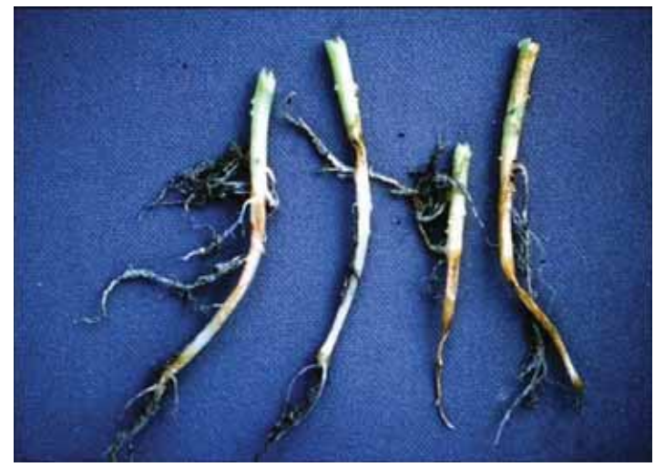
Figure 1. Stem lesions at the soil line and root rot caused by Phytophthora capsici in pepper.

covered with white-gray, cottony, fungal-like growth (Figure 3). Infected fruit dries, becomes shrunken, wrinkled, and brown, and remains attached to the stem.