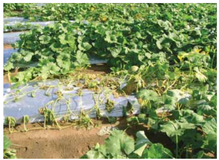
Figure 10. Blighting and vine decline of tropical pumpkin caused by Phytophthora capsici .

Phytophthora capsici causes rapid blighting and death of chayote and tropical pumpkin plants and a fruit rot similar to that observed in watermelon (Figure 10). Angular, water-soaked lesions as well as a rapid fruit rot, which is covered with white fungal-like growth, are produced in cucumber and butternut squash (Figure 11). Symptoms of Phytophthora blight in cantaloupe are limited to leaf lesions and tip dieback of vines.