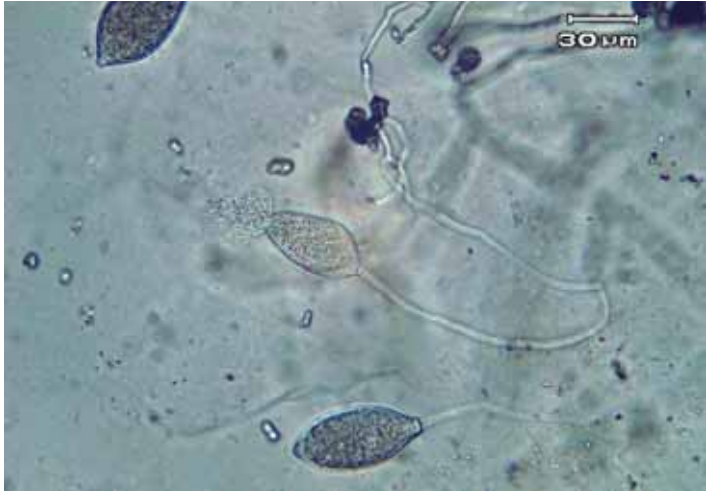
Figure 13. Phytophthora capsici sporangium releasing zoospores.