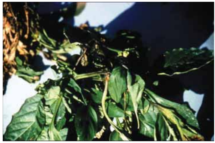
Figure 2. Crown lesion on pepper caused by Phytophthora capsici .