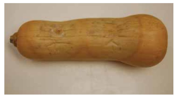
Figure 11. Fruit rot of butternut squash caused by Phytophthora capsici .