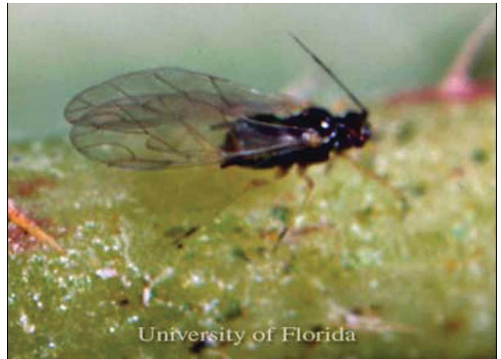
Figure 2. Winged adult (black morph) melon aphid, Aphis gossypii Glover. Credits: P. M. Choate, UF/IFAS

Stoetzel et al. (1996) published a key for cotton aphids that is also useful for distinguishing melon aphid from most other common vegetable-infesting aphids. One aphid commonly confused with the cotton aphid is the spirea aphid, Aphis spiraeicola Patch. One means of identifying them is by examining the cauda.