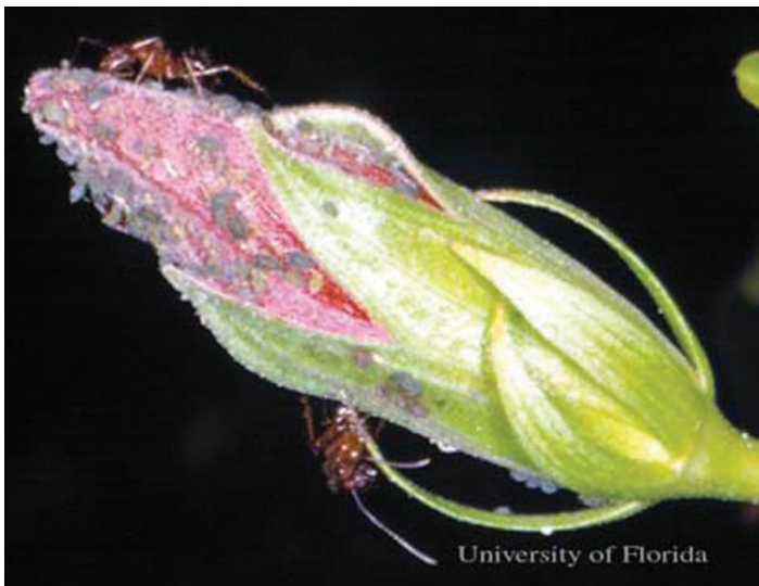
Figure 7. Melon aphids, Aphis gossypii Glover, tended by ants.