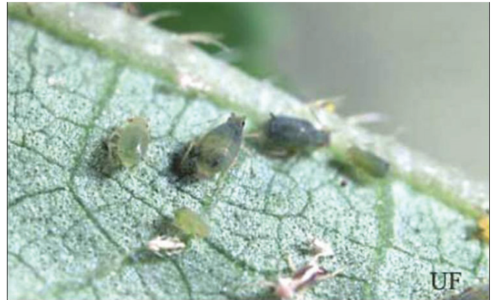
Figure 6. Melon aphids, Aphis gossypii Glover, on okra.

existence of host races; for example, aphids reared on cotton could be transferred successfully to okra but not to cucurbits. This inability to transfer to other hosts subsequently has been shown for several other combinations.