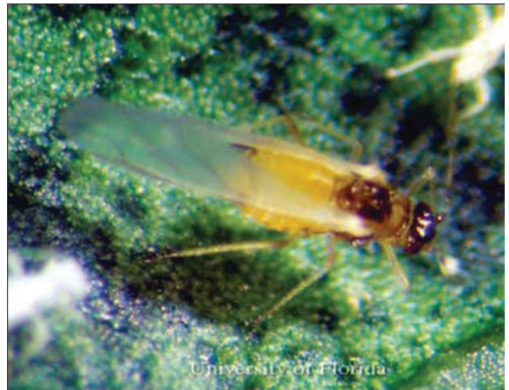
Figure 3. Winged adult (yellow morph) melon aphid, Aphis gossypii Glover.