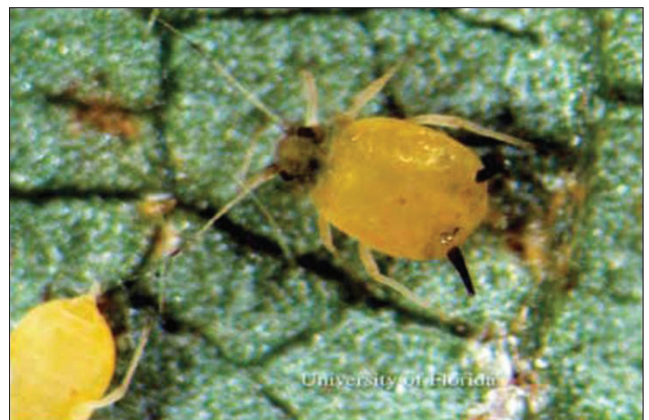
Figure 4. Wingless adult (yellow morph) melon aphid, Aphis gossypii Glover.