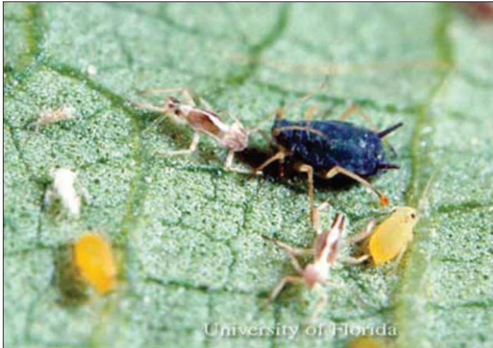
Figure 1. Nymphs (mixed ages) and dark form of wingless adult of melon aphids, Aphis gossypii Glover.

body is dull in color because it is dusted with wax secretions. The nymphal period averages about seven days.