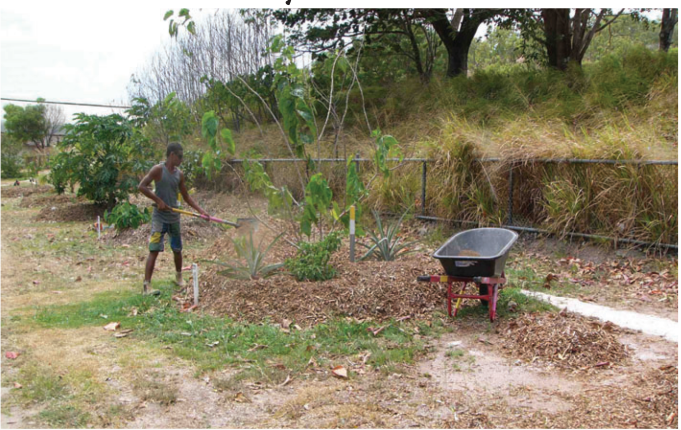
• Student topping up a garden

Thursday Island in the Torres Strait is a difficult place to establish a garden.