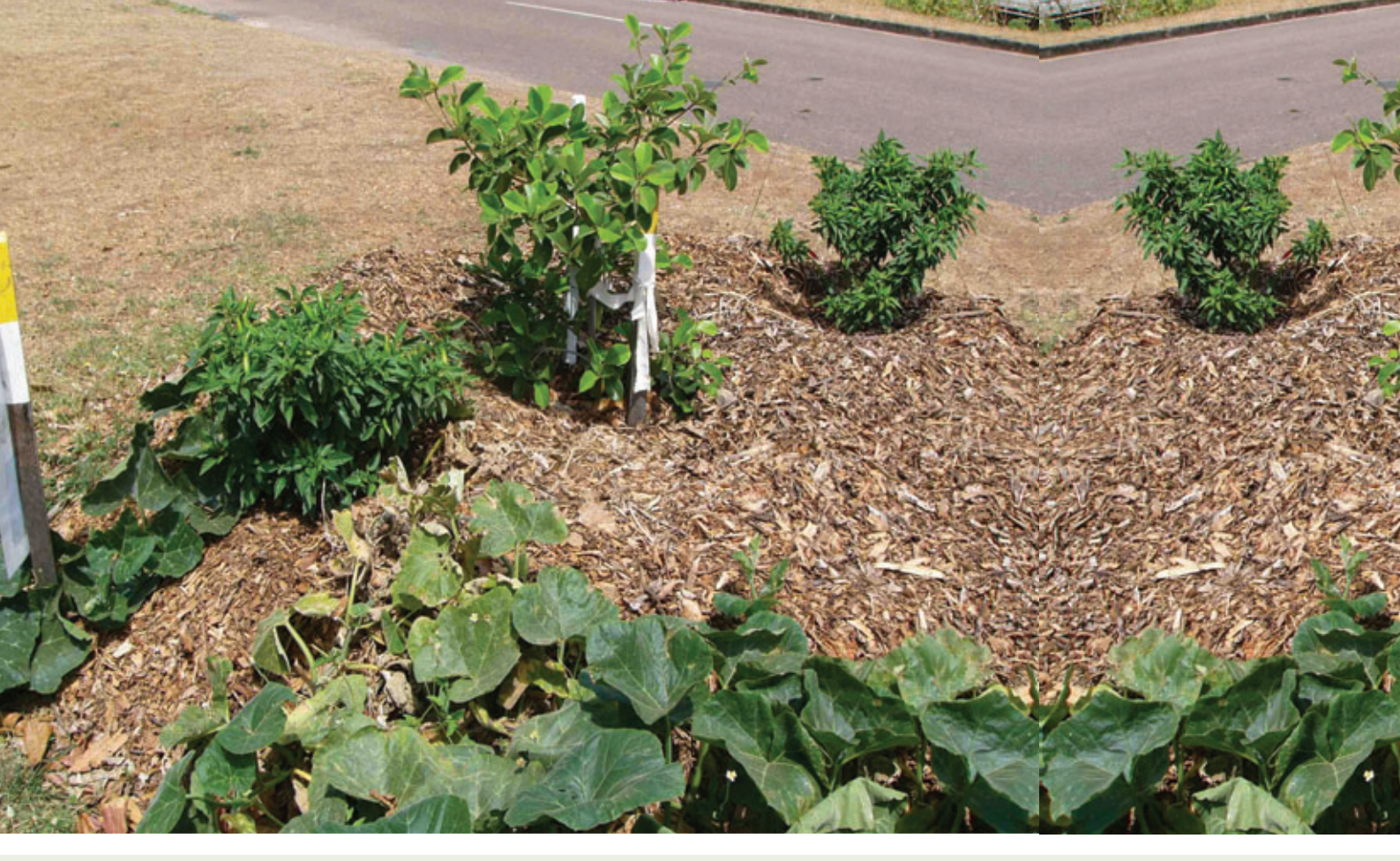
• Wongi tree with chilli and pumpkin plants