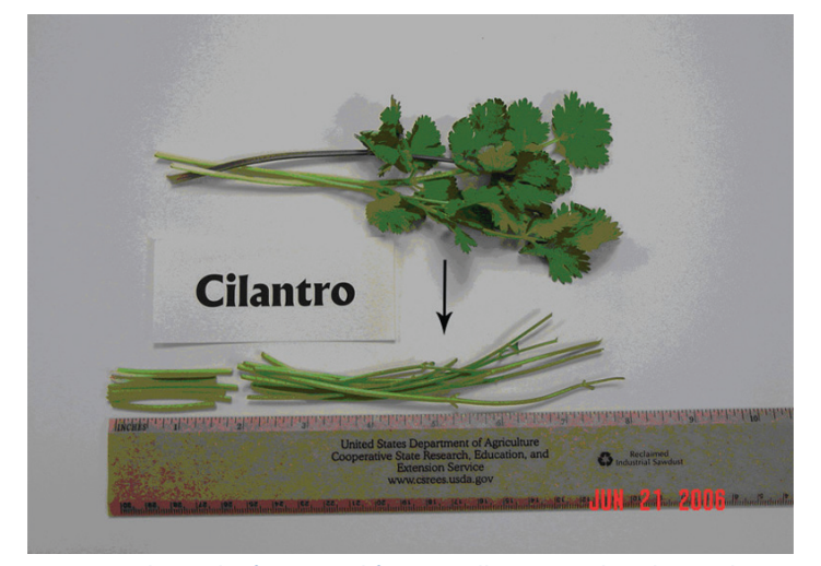
Figure 3. Cilantro leaf part used for sap collection and analysis. (The arrow marks plant part used for sap testing.)