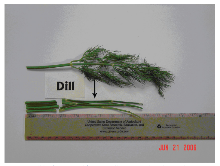
Figure 4. Dill leaf part used for sap collection and analysis. (The arrow marks plant part used for sap testing.)