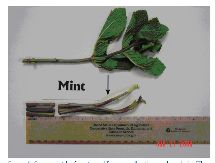
Figure 5. Spearmint leaf part used for sap collection and analysis. (The arrow marks plant part used for sap testing.)