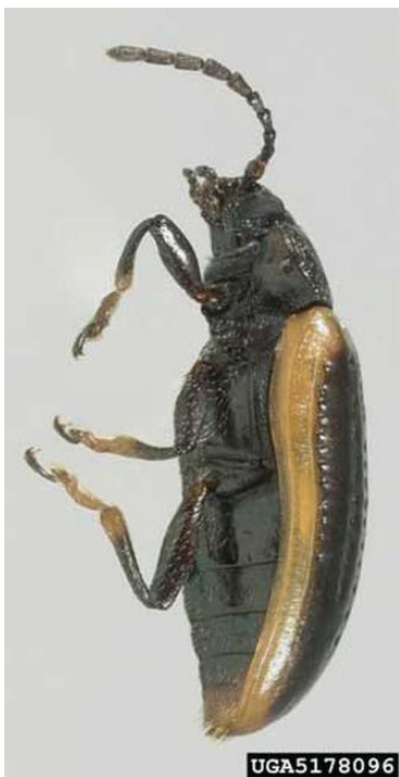
Figure 6. Lateral view of an adult yellowmargined leaf beetle, Microthecha ochroloma Stål.