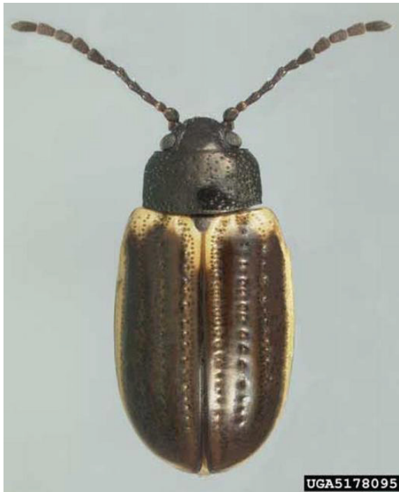
Figure 5. Dorsal view of an adult yellowmargined leaf beetle, Microthecha ochroloma Stål.