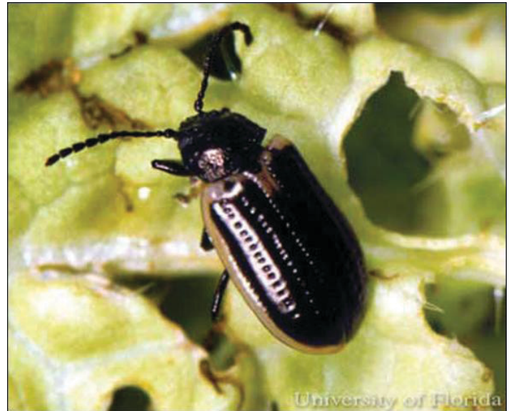
Figure 1. Adult yellowmargined leaf beetle, Microtheca ochroloma Stål.

genitalic differences. No other synonyms are listed in the literature (Woodruff 1974). Arnett (2000) lists two species of Microtheca in the United States, but only Microtheca ochroloma is of economic importance.