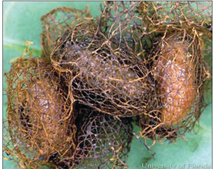
Figure 4. Yellowmargined leaf beetle, Microtheca ochroloma Stål, pupae in cocoons.

The pupal case is attached to the undersides of leaves, and their dark color stands out against the green foliage. The pupal stage lasts five to six days. New adults stay in the pupal case for about two days before emerging (Capinera 2001).