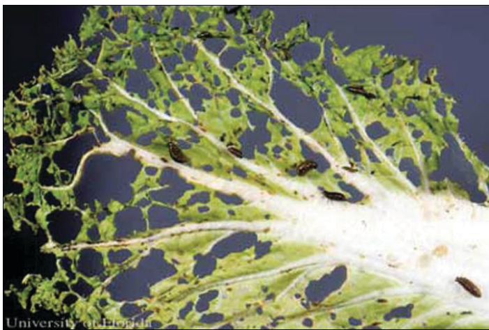
Figure 7. Yellowmargined leaf beetle, Microtheca ochroloma Stål, damage to leaf.

Bowers (2003) lists three reasons why the yellowmargined leaf beetle is such a problem to growers in Florida. The beetle's host plants thrive in the cool months from October to April, and this period comprises the growing season for organic farmers in Florida. During these months, hard frosts or freezes are rare, and the adult beetles can continue to feed and reproduce throughout the winter on an ample food supply. Finally, the yellowmargined leaf beetle is an introduced pest and has no known predators or parasites in the United States. Fortunately, this species seems to migrate at a slow rate, meaning it may not have the ability to rapidly expand its range under favorable conditions.