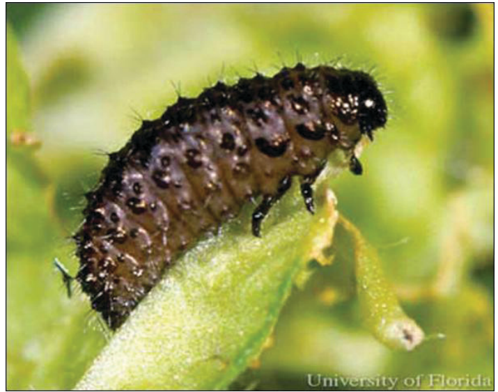
Figure 3. Yellowmargined leaf beetle, Microtheca ochroloma Stål, larva.

The larva is grayish to yellow-brown, covered with a fine layer of hairs, and has a dark, sclerotized head capsule that is brown or black. The mature larva spins a peculiar blackish network around itself prior to pupation.