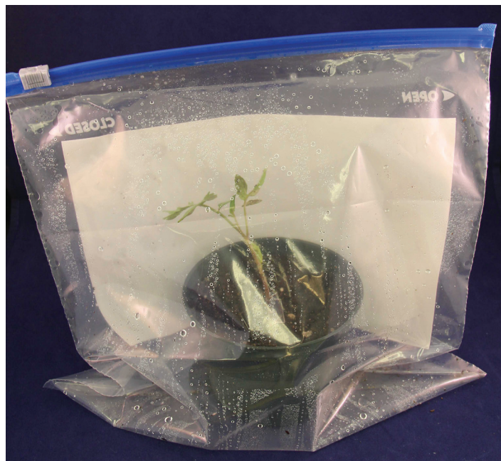
Figure 2. A grafted plant placed inside a resealable bag.

One day before the grafting is performed, mist water on the inside surfaces of an appropriate-sized plastic bag, using a hand sprayer, and close it. This practice ensures the RH will reach 95% before the grafted plants are placed inside the bags. After grafting, open the plastic bag, place the potted, grafted seedlings inside, and then immediately close the bag to avoid RH loss (Figure 2). If needed, mist more water inside the bag before placing the plants inside. In order to avoid humidity loss to the outside air, there must be enough space to tighten the bag. Resealable bags can be a convenient option, since they can be tightly closed.