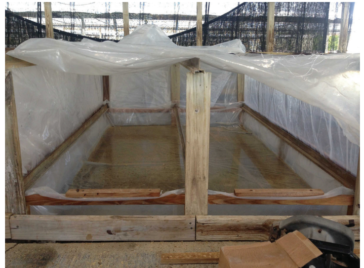
Figure 6. A wood-framed healing chamber, which would be found in a large-scale grafting operation.

For a large-scale grafting operation, healing chambers can be built inside a separate area of the greenhouse or over the transplant tray benches. Wood or PVC pipes can be used to build the chamber's frames and plastic can cover the structure (Figure 6). A pool of water can be maintained below the structure to provide high RH, eliminating the need to spray the surfaces of the chambers. The trays must be placed above the water level to avoid water saturation in the media. One day before grafting is performed, fill the water pool in the bottom of the chamber, and then close it to increase RH.