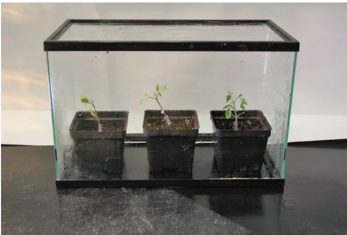
Figure 4. An upside-down aquarium used as a healing chamber.

An empty glass aquarium can provide the ideal environmental conditions for a healing chamber (Figure 4). One day before the grafting is performed, use a hand sprayer to mist water on the inside surfaces of the aquarium walls, and close it to raise the RH. Place the seedlings inside the aquarium, and close the lid. If an aquarium lid is not available, place the aquarium upside down over the seedlings.