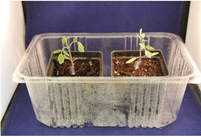
Figure 3. Grafted plants inside salad container.