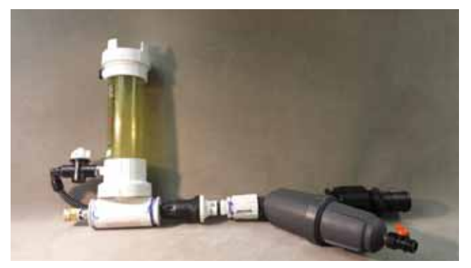
Figure 7. Injector system to add fertilizer through irrigation lines.

becomes a persistent problem, consider incorporating organic matter or other soil amendments to help improve overall soil drainage.