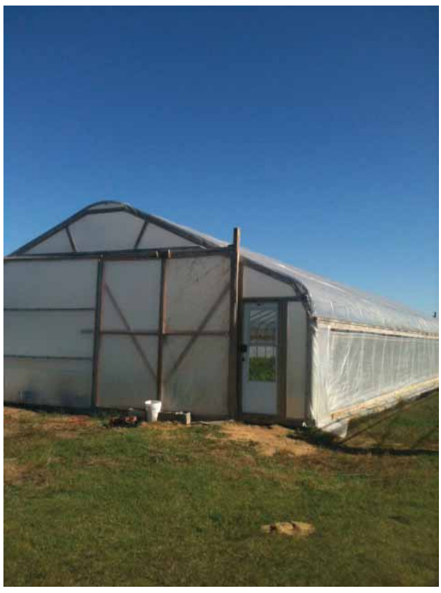
Figure 2. High tunnel with plastic covering.