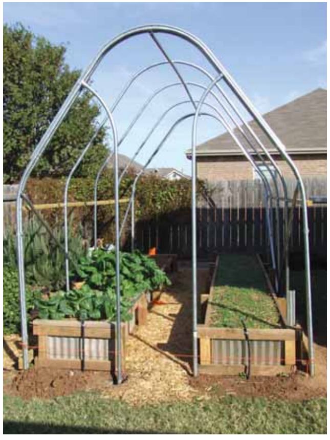
Figure 4. A small hobby high tunnel.

Because high tunnels are lightweight structures that lack a solid foundation, the poles must be well anchored in the soil. For non-movable high tunnels, the frame poles should be sunk 2 feet to 3 feet into the ground to provide support during storms and high winds (Figure 6). For movable high tunnels, anchor posts must be sunk, and the structure attached to