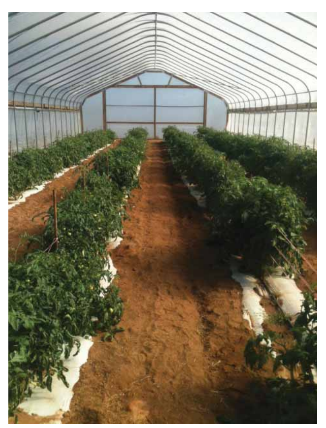
Figure 8. Tomato production in a high tunnel.

Warm-season crops such as tomatoes are almost exclusively grown in high tunnels in certain parts of the country (Figure 8). In New England, farmers have been using high tunnels for tomato production for more than a decade. Unpredictable summer weather and wind-transferred fungal diseases were the primary drivers behind this practice. High tunnels allow tomatoes to be staked or trellised, which can help increase tomato production and limit waste from soil