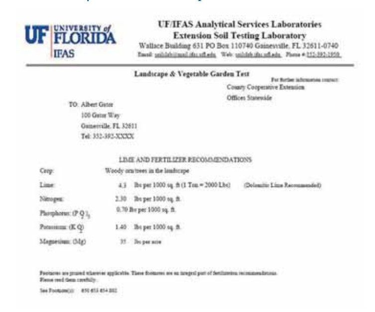
Figure 2. Example of a soil test report from the UF/IFAS Extension Soil Testing Lab.

The lime recommendation is based on the results of the pH and lime requirement test and the optimum pH for the turf or landscape plant species. Be sure to read the soil test report carefully and thoroughly (including all footnotes). Also, avoid comparing reports from ESTL with those from private laboratories. Private labs may use different analytical procedures, which may or may not be calibrated to conditions in Florida. Remember, your local UF/IFAS Extension office can answer questions related to soil test results (http://solutionsforyourlife.ufl.edu/map/).