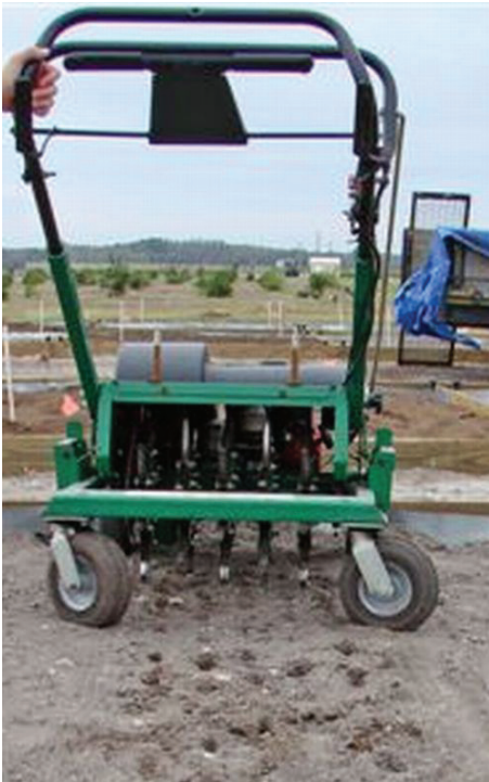
Figure 4. Plug aeration can be used to improve drainage in compacted soils with minimal effect on established plant roots or turfgrass.

wet or dry areas into account by choosing plant species tolerant of these conditions. Actions, such as tillage and adding organic amendments, may alleviate drainage issues if compaction is the cause. Additionally, aeration with a soil core aerator (Figure 4) can help to moderately increase drainage in some situations.