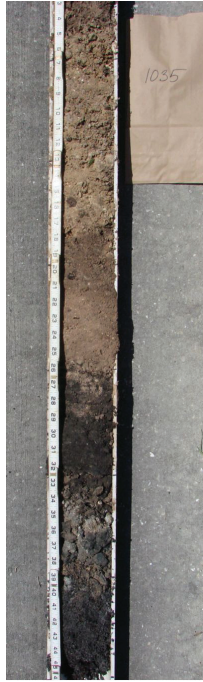
Figure 2. Removing a soil core or vertical slice from the disturbed soil to compare with the description of the native soil indicated on the site soil survey can provide information about the extent of soil disturbance during construction activities.

and size of air-filled pores, which are critical in providing the plant roots with oxygen (Figure 3). Compaction can also increase resistance to root penetration, which can cause poor/shallow rooting and thus poor plant growth. There is often an increased need for irrigation and fertilization in compacted soils because of the limitations to plant growth encountered under compacted conditions. Poor plant growth in compacted soils can also require replacement of dead or declining plant material, often at additional cost to the homeowner or landscape professional.