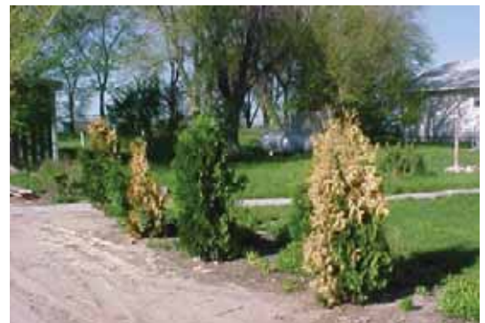
Figure 7. Winter drought, sunscald, and photo-oxidization of chlorophyll are common on arborvitae. This is a poor plant choice for this windy site with little winter moisture.

Tissue kill – Tissues killed when temperatures drop below hardiness levels.