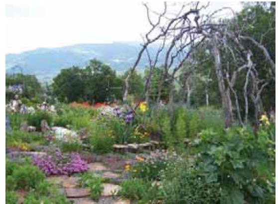
Figure 1. This magnificent garden on the hillside above Steamboat Springs, Colorado (a mountain community with a short frost-free season) has good drainage giving it a growing season that is several weeks longer than down in town.

Exposure – Southern exposures absorb more solar radiation than northern exposures. In mountain communities, northern exposures will have shorter growing seasons. In mountain communities, gardeners often place warm season plants, like tomatoes, on the south side of buildings to capture more heat.