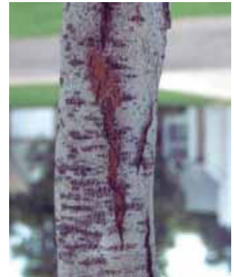
Figure 6. Vertical frost crack is common on trees when the temperature drops rapidly. Along Colorado's Front Range, it is common to go from a nice spring day back to cold storm with a 40 to 60 degree temperature drop in an hour!

Frost crack – Vertical split on tree trunk caused by rapid drop in bark temperature. [Figure 6]