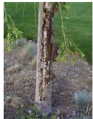
Figure 5. Southwest bark injury is common on trees under drought stress, such as this tree with a restricted root spread.

Sunscald – Caused by heating of bark on sunny winter days followed by a rapid temperature drop, rupturing membranes as cells freeze. Winter drought predisposes tree trunks to sunscald. [Figure 5]