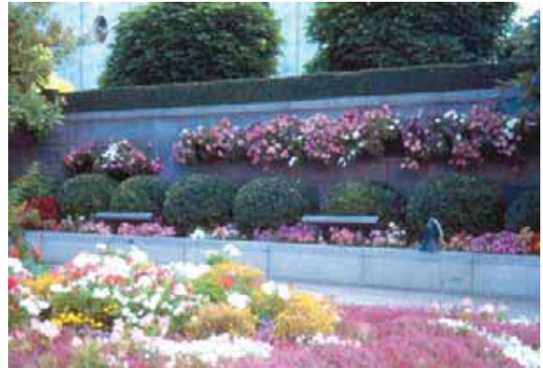
Figure 3. The sidewalks and stone walls of this intercity plaza creates a heat pocket with a frost free periods three months longer than the surrounding neighborhood.

In Phoenix, Arizona, the urban heat island (with all the rock mulch instead of grass and trees) has significantly raised day and night temperatures. The upward convection of heat has become so strong that summer storms are going around the city and not raining on the urban heat island.