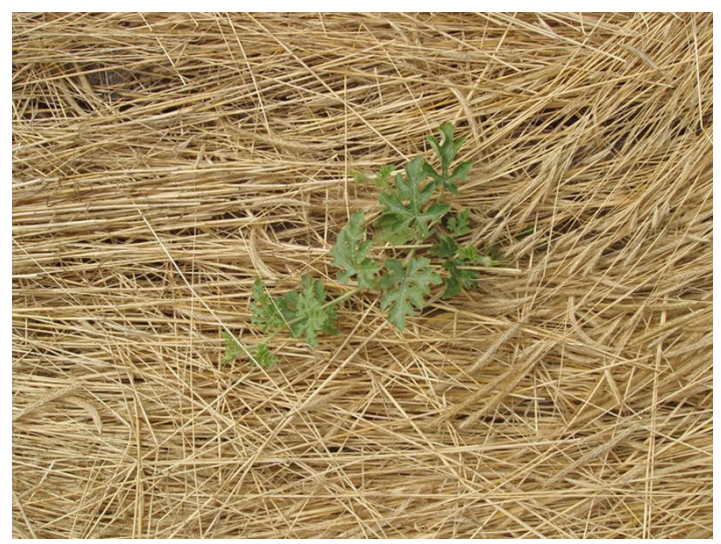
Figure 5. No-till spring watermelon in cereal rye residue in Live Oak, FL.

a subsequent crop, the lack of soil disturbance combined with the presence of cover crop surface residue may reduce weed emergence and establishment (Treadwell et al., 2007). Cover crop biomass production should be at least 4-6 tons per acre dry weight to observe a reduction in weed emergence. At this rate, plant material on the surface inhibits light penetration to the soil surface minimizing germination cues. Some weeds that do germinate are mechanically inhibited by a mat of straw-like mulch.