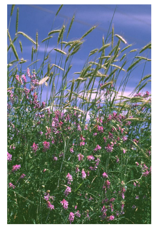
Figure 1. A robust stand of winter annual hairy vetch and Wrens Abruzzi cereal rye.

Prioritizing objectives for cover crops necessitates an understanding of when and under what conditions benefits