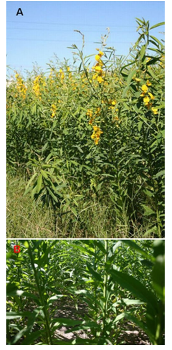
Figure 4. Weedy border (A) and weed-free area (B) of a stand of sunn hemp at mid-bloom in Gainesville, FL.

Weeds . Cover crops suppress weeds most commonly by physical, mechanical or chemical interference. The degree of weed suppression achieved depends on the native density and diversity of weed species, the cover crop species and management and climatic conditions. Frequently, cover crops can suppress weeds simply by using light, water and nutrient resources before the weeds do (Figure 4).