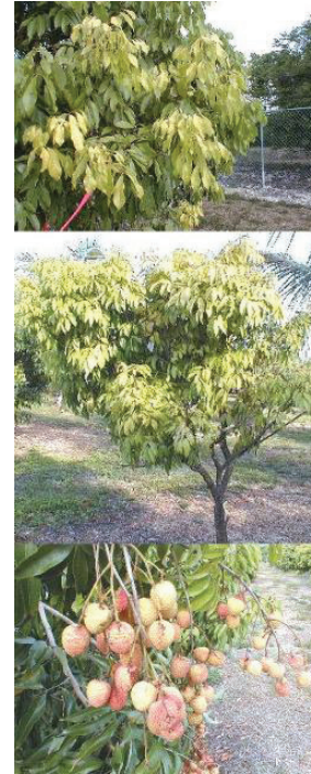
Figure 1. Typical iron deficiency symptoms of lychee ( Litchi chinensis , the soapberry family).

iron uptake (Figure 2). Compared to traditional iron fertilization, chelated iron fertilization is significantly more effective and efficient (Figure 3) than non-chelated fertilizer sources.