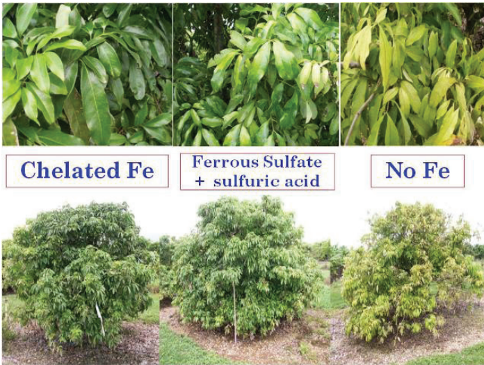
Figure 3. Comparison of foliar applications of chelated Fe, regular iron fertilizers, and no iron fertilization for correcting iron deficiency of lychee ( Litchi chinensis , the soapberry family).