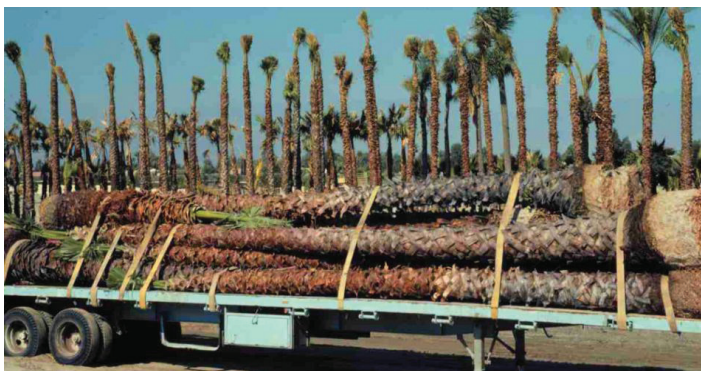
Figure 7. These palms are well supported on the trailer bed for transportation.

During transport on truck or trailer, palms should be well supported along their entire length (Figure 7). Unsupported crowns may crack or damage the bud, resulting in reduced survival rates.