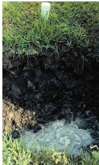
Figure 8. This planting site has a high water table, which is unsuitable for palm installation.

Palms should not be planted into sites with high water tables or poor drainage (Figure 8). Such sites can be planted if mounds or berms are used to build up the area to be planted. Clay hardpans, where they occur, should be drilled through to improve drainage. Planting holes should be roughly twice the diameter of the rootball to facilitate backfilling, but need not be any deeper than the rootball.