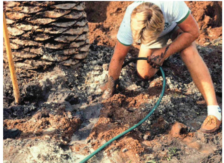
Figure 10. Using water to force sand under and around the rootball.

Gliocladium blight (pink rot) (Broschat 1994; Hodel et al. 2003; 2006).