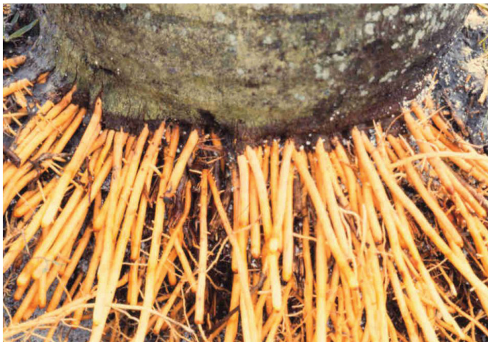
Figure 4. Large numbers of new roots arising from a palm's root-initiation zone.

The question of how a palm responds to having its roots cut is central to palm transplanting success. To answer that question, Broschat and Donselman (1984; 1990b) demonstrated in a series of experiments that different palm species respond differently (Table 1). For example, when roots of Sabal palmetto were cut, virtually all cut roots died back to the trunk and were eventually replaced by massive numbers of new roots originating from the root-initiation zone (Figure 4). As a result of this response, it didn't matter whether roots of a Sabal palmetto were cut close to the trunk or 3 feet away from the trunk.