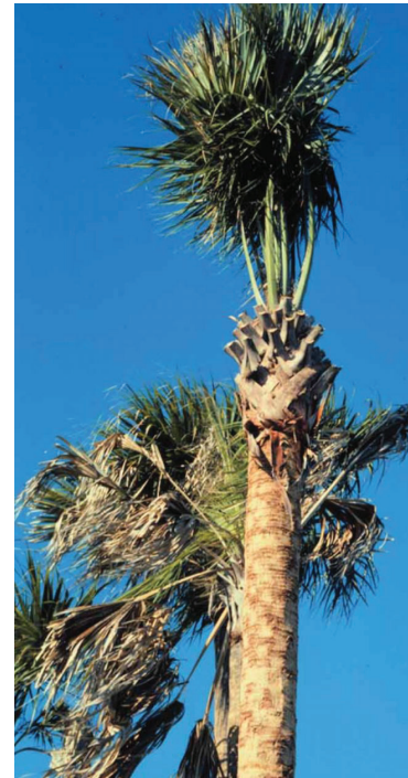
Figure 5. The lower leaves of this palm have been removed, and the remaining ones tied into a bundle for transport.

Since water stress appears to be the primary physiological problem associated with transplanted palms, any practice that reduces water stress in transplanted palms should improve palm survival rates. Typically, one-half to two-thirds of the oldest leaves are removed at the time of digging to facilitate handling and to reduce leaf surface area, from which water loss occurs (Figure 5).