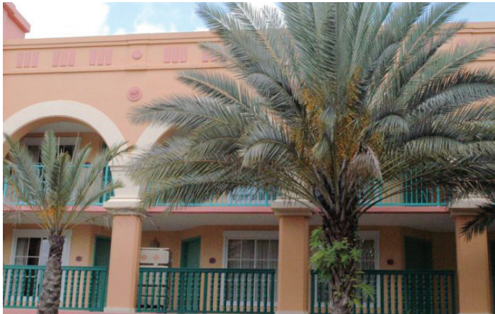
Figure 9. The palm on the left was planted too deeply. At the time of planting, these two palms were similar in size.

properly planted palms (Figure 9). In addition to nutrient deficiencies, deeply planted palms may also suffer from water stress. As a result of these palms' weakened condition, they may attract secondary pests, such as palm weevils ( Rhynchophorus sp.). Palms that are planted too deeply may also develop secondary root rots due to the suffocation of deeply buried roots. Deeply planted palms may linger in a state of poor health for many years, or they may die at any time.