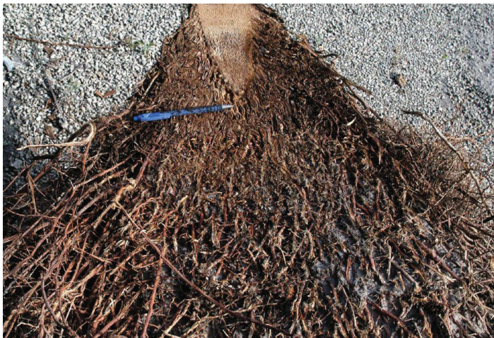
Figure 1. The inverted-cone-shaped tissue at the bottom of the trunk - an area from which all primary palm roots arise - is called the root-initiation zone. The pen marks the soil line.

Palms, when compared to similar-sized broadleaf trees, are relatively easy to transplant into the landscape. Many of the problems encountered when transplanting broadleaf trees, such as wrapping roots, are never a problem in palms due to their different root morphology and architecture. While broadleaf trees typically have only a few large primary roots originating from the base of the trunk, palm root systems are entirely adventitious. In palms, large numbers of roots of a relatively small diameter are continually being initiated from a region at the base of the trunk, a region called the root-initiation zone (Figure 1). And while the roots of broadleaf trees continually increase in diameter, palm roots remain the same diameter as when they first emerged from the root-initiation zone.