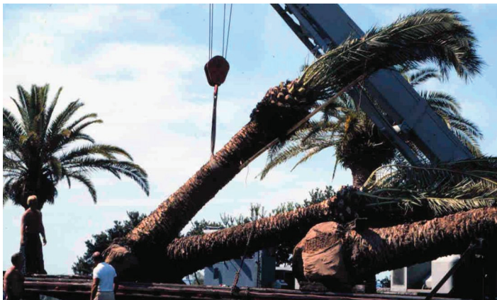
Figure 6. A palm being lifted in a nylon sling. The splint attached to the crown provides support.

Palms should be lifted only by means of nylon slings wrapped around the trunk (Figure 6). Never attach chain, cables, or ropes directly to palm trunks; such practices can result in injury and possibly fatal diseases, such as Thielaviopsis trunk. (For more on that topic, see EDIS Publication PP219, Thielaviopsis Trunk Rot of Palm , http://edis.ifas.ufl.edu/pp143 .)