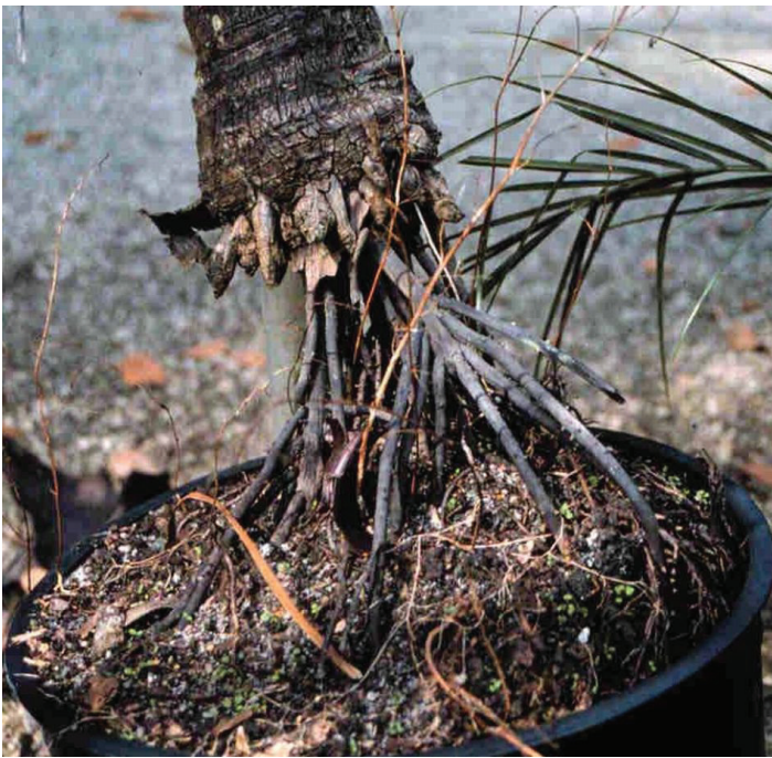
Figure 2. Container substrate subsidence and shallow planting resulted in the root-initiation zone of this palm being above the current soil line. These new root initials will probably never enter the soil.

surface (Figure 2). Planting such palms at the same level as the top of the rootball will result in a poorly-anchored palm that is susceptible to toppling over (Figure 3). Container-grown palms should always be planted so that the top of the root-shoot interface is about one inch below the surface of the soil.