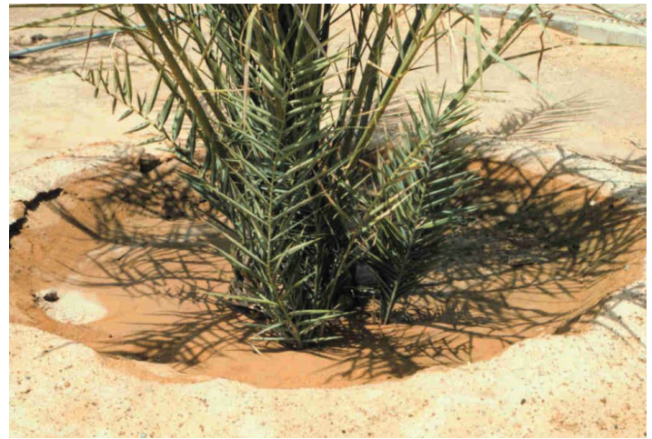
Figure 11. Mounding up soil around the rootball forces water into the rootball, where it is needed.