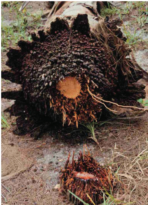
Figure 3. This palm had been planted too shallowly from a container and eventually fell over from its own weight.