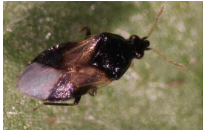
Figure 4. Minute pirate bug, also called Orius. Minute pirate bugs feed on thrips and other pests.