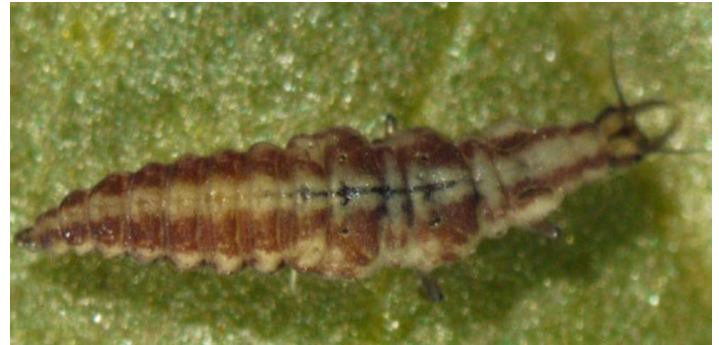
Figure 3. Lacewing larva. Lacewings feed on many pests of strawberry, including aphids.

are called “mummies” and have a distinctive appearance (Figure 5).