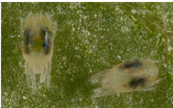
Figure 6. Two-spotted spider mite.

especially for plants that have leaves with small patches of yellow, pin prick-size stipples showing through the upper leaf surface. A hand lens can be used to see the mites moving about on the underside of leaves. If mites are found on 5 percent or more of the leaflets examined, it is likely that the population needs to be controlled with applications of a home garden pesticide such as a neem product, insecticidal soap, or mineral oil. These products are most effective when two applications are made (or even three when infestations persist), spaced approximately 5–7 days apart. Before using any pesticide, be sure to read and follow all label directions. Predatory mites ( Phytoseiulus persimilis ) are highly effective in controlling spider mite outbreaks and are readily used by strawberry farmers who purchase and apply them. Other commercially available predatory mites that feed on mites, thrips, and other small insects include Amblyseius swirskii , Neoseiulus cucumeris , and Neoseiulus californicus . Unfortunately, buying and releasing beneficials is not very feasible for the typical home gardener due to the large quantities that must be purchased and the associated shipping costs. Links to more information on Integrated Pest Management (IPM) in strawberries can be found at the end of this publication.