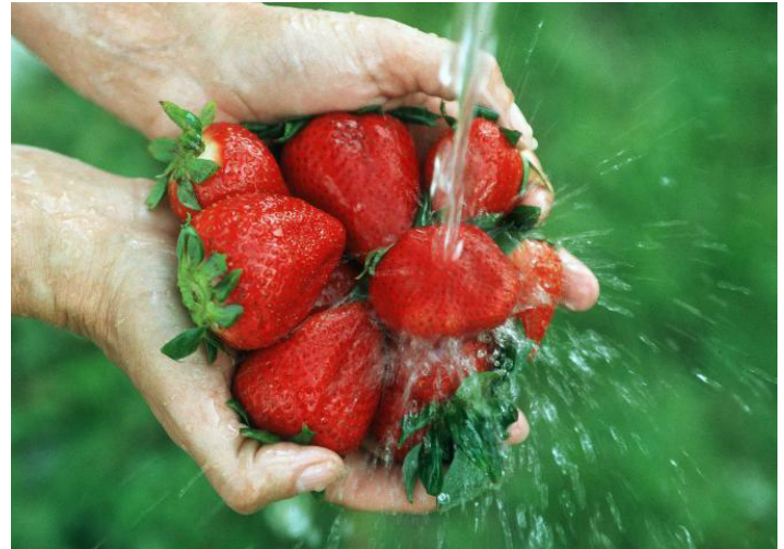
Figure 1. Florida strawberries are grown as an annual crop and harvested in late fall, winter, and early spring.

Temperatures between 50°F and 80°F (10°C and 27°C) and day lengths 14 hours or less are required for the development of flowers and fruit on most strawberry varieties. In areas of the United States north of Florida (except for the coastal areas of southern and central California), these conditions occur only for a short period in the late summer or early fall, and again briefly in the spring. In peninsular Florida, however, these conditions exist for much of the fall, winter, and spring. Single-crown (stem) strawberry plants are planted in Florida during the fall, from late September to early November. Flowering and fruit production generally begins in November and continues into April or May. Fruit production over this period is not constant, but occurs in two or three cycles, and can be interrupted by freezing weather. Because the highest quality fruit are produced on relatively young plants with not more than four or five branch crowns, plants are usually removed at the end of the fruiting season, and new plants are planted the following fall.