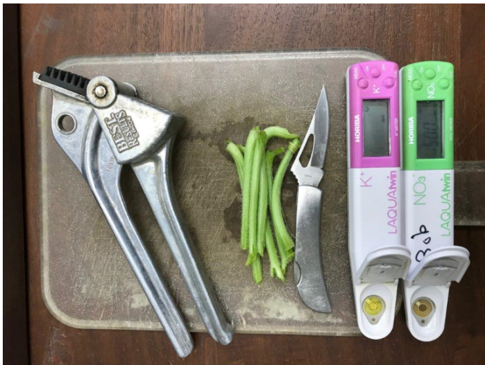
Figure 2. Plant sap nitrate and potassium meters and tools for petiole sap testing.

Making a timely analysis of plant tissue N and K can help optimize N and K injection and can aid farmers in making quick decisions on how much N and K to inject. Using data from research studies and commercial strawberry farms, extension scientists developed petiole sap testing procedures (Figure 2). The petiole sap sufficiency ranges for N and K for strawberry are presented in Table 3. More information on petiole sap testing can be found in “Guide for Plant Petiole Sap-Testing for Vegetable Crops” (Hochmuth and Hochmuth, 2022).