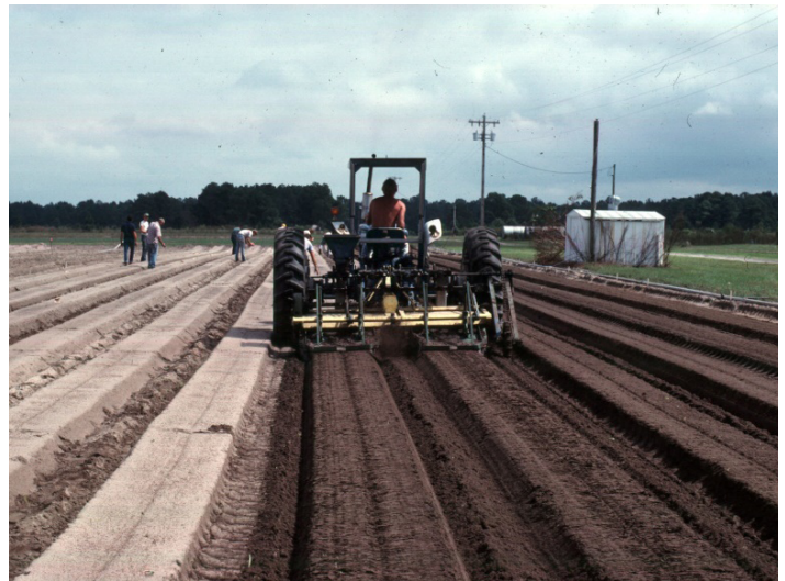
Figure 1. Preparing beds with a rototiller and bed shaper.

al., 1994). Similarly, a portion of the recommended P and magnesium (Mg) amounts can be incorporated through a preplant application. It has been observed that strawberries can be grown successfully only with post-planting fertigation. To minimize the risk of nutrient leaching or runoff, growers are encouraged to use controlled-release or slow-release fertilizers for pre-plant fertilization. Typically, calcium (Ca) fertilization is not needed because the soil holds enough Ca at recommended pH levels, and irrigation water contains Ca that plants can use.