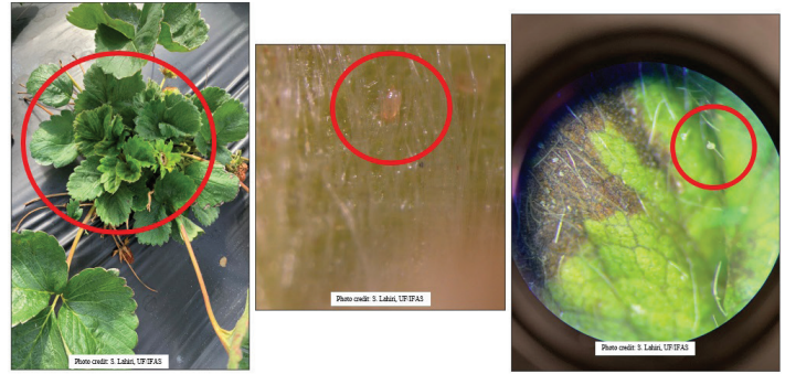
Figure 3. Strawberry leaf stunting and abortion of flowers due to feeding by cyclamen mites on young, unfolded leaves and strawberry crown; clear translucent adult cyclamen mite found under strawberry fruit calyx; a single, smooth, and oval cyclamen mite egg glued to the end of a leaf hair on a strawberry fruit calyx as observed under a stereomicroscope.

Resistance of insect pests to insecticides is a serious and growing problem (Price et al. 2002; Gao et al. 2012). Therefore, growers' understanding of the need for pest monitoring and identification as well as the importance of rotating modes of action of insecticides are crucial for effective pest management. Also, there are several feasible tools such as biological control using predatory arthropods or cultural control using flowering plants as banker crops for predatory arthropods. However, these tools may not be implemented if growers are unaware of them or lack confidence in these alternatives. To better document current pest management practices, an in-person survey of 24 strawberry growers in Hillsborough County, Florida, was conducted during the field season of 2019–2020 (IRB# 201902072). These growers represented a total of 6,886 acres out of the 10,000 acres dedicated to strawberry in Florida, i.e., 68.9% of Florida strawberry production. The survey asked each grower the following set of questions pertaining to IPM and farm management. Responses to individual questions are tabulated below. The top, shaded rows contain the choices offered on the survey: total farm acreage, number of farms managed by each grower, percent of acreage managed organically by each grower, etc.; and the bottom rows in the tables show the number of growers who selected each choice.