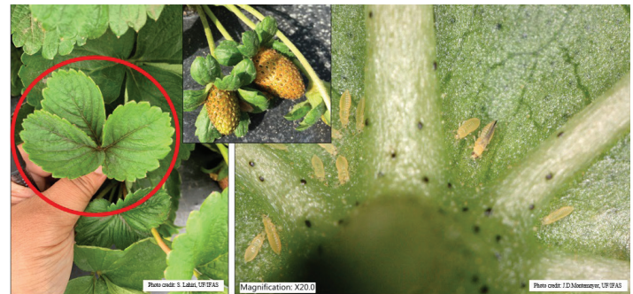
Figure 1. Damage to strawberry leaves in the form of darkening of leaflet mid-rib due to necrosis of leaf tissue from chilli thrips feeding; chilli thrips larvae and adult feeding along leaf veins on a cotton leaf; and bronzed and cracked strawberry fruits due to thrips feeding damage.

Due to several invasive and native insect and mite pests affecting the strawberry industry, strawberry growers have begun exploring different methods of pest management in addition to chemical control using pesticides. The fresh market strawberry industry in Florida has a production value of $307 million, which is 12% of the national production value (USDA-NASS 2019). Pests affecting this industry include chilli thrips, Scirtothrips dorsalis Hood and western flower thrips, Frankliniella occidentalis (Pergande) (Thysanoptera: Thripidae) (Figure 1); twospotted spider mite, Tetranychus urticae Koch (Figure 2); and cyclamen mite, Phytonemus pallidus (Banks) (Arachnida: Tetranychidae) (Figure 3) (Price et al. 2006; Pinent et al. 2011; Mossler 2013; Cluever et al. 2016; Lahiri and Panthi 2020; Panthi et al. 2021). Damage to fruits appear as bronzing and cracking (Kaur and Lahiri 2022).