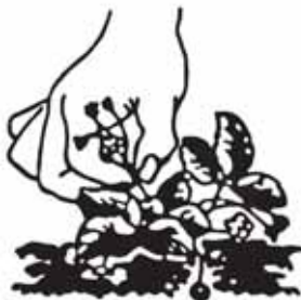
Figure 2. Remove flowers the spring of planting.

If the planting is vigorous, you will probably have to cut runners that grow into the aisle. During the winter and spring months, periodically check the planting for the development of winter weeds that should be removed. In late winter of the second and subsequent years (mid-February in middle Georgia and mid-March in the Georgia mountains), broadcast 3 pounds of 13-13-13 or 4 pounds of 10-10-10 fertilizer over the bed. Following fertilization, mulch the bed with a layer (1 to 2 inches) of pine straw before growth begins. Rake most of the straw off the tops of the plants. The