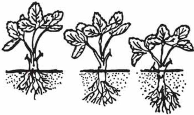
Figure 1. Plant at the correct depth.

During the summer of establishment, allow the strawberry runners to develop and form the matted row. Strawberries require 1 to 1½ inches of water per week, so water the planting if rainfall is not sufficient. And don't forget to control the number one headache — weeds. Mulching, hand pulling, hoeing and tilling are the best means of control in a small planting, although a few herbicides are available for use on strawberries. Should you decide to use herbicides, check with your county extension agent for recommendations.