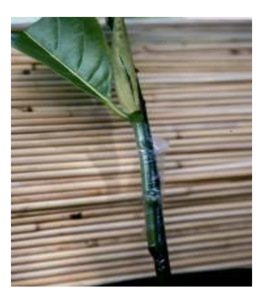
Fig 2.Guava (Psidium guajava) are used in an espalier