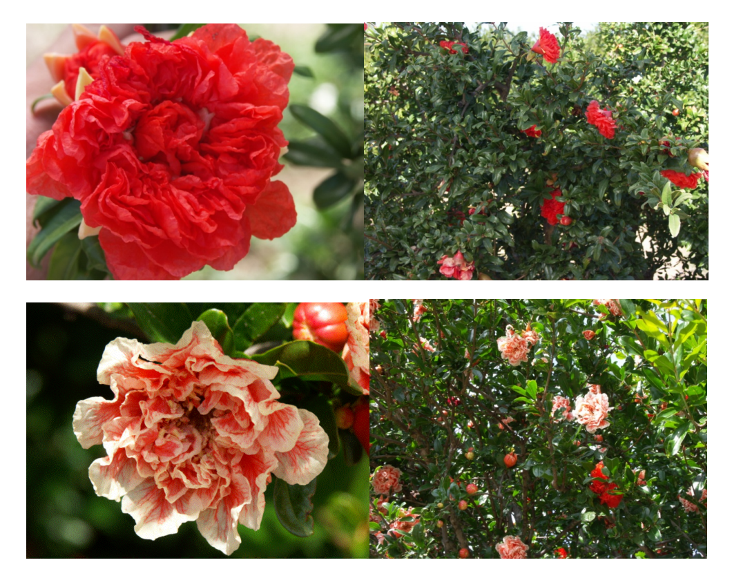
Fig. 2. Ornamental pomegranate cultivars: 'Dotch Legrelley' ( upper left and right ) and 'Ki Zakuro' ( lower left and right ).

The mature pomegranate fruit is large, usually 3 inches in diameter and sometimes as large as 4 to 5 inches. Fruit generally mature in 5 to 8 months and often change from round to a slightly squared-out shape. The fruit of different cultivars are quite diverse in their color, taste, and certain other traits. Peel color ranges from a light yellow to "black" or very dark red/ purple. The fruit is distinctive because it retains the calyx (petals + sepals) at one end of the fruit giving the fruit the appearance at maturity of having a small crown attached to it. Internally, the fruit consists of a series of chambers (locules) separated by a membranous septum. Inside each chamber are the seeds, which each have a fleshy outgrowth (aril) that contains the edible juice. The seeds range in hardness from very hard (not edible) to soft (easily consumed). The color of the arils also ranges from a light, virtually white, color to very dark red or purple. The flavor of the juice can be inedibly tart to bland to sweet or sweet/tart depending on acidity. Typical soluble solids values for fruit grown in California are 15% to 18%.