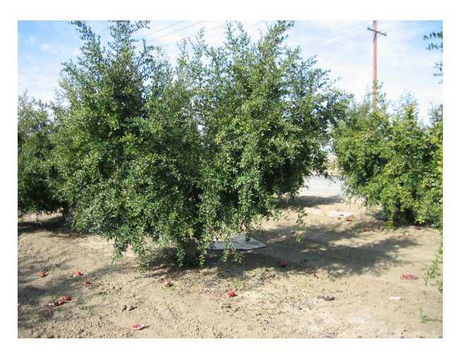
Fig. 1. A 17-year-old 'Wonderful' pomegranate plant growing in California and trained to a single trunk with three main branches similar to the open vase form used for peach trees.

BOTANY. The Punicaceae family has only two members, one of which is Punica granatum , the pomegranate of commerce. The Punicaceae family belongs to the Order Myrtales, which includes Corymbia torelliana (a plant being used as a windbreak around citrus in Florida), eucalyptus, melaleuca, jaboticaba, and guava. The pomegranate is a naturally bushy, multi-stemmed plant that tends to maintain its bushiness because of suckers routinely arising from the base. Plants grow to heights of \approx 10-12 ft and commercially are often trained to a single trunk or sometimes three stems (Fig. 1). The plant is normally deciduous. New spring