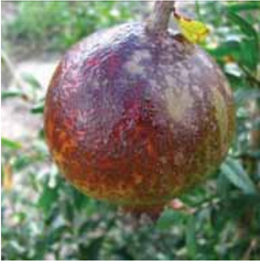
Figure 2. Example of sunscald (top) and sunburn (bottom).

For hardwood cuttings, remove approximately 10 inches of one-year wood in late fall or early winter. Cuttings should be approximately ½ to ½ inch in diameter, or about the same width as a pencil. Suckers from the base of the plant or from the interior of the canopy often make some of the best wood for cuttings. Cuttings can be propagated either in a pot containing a modified soil or soilless media or directly in ground, spaced about a foot apart in a nursery row. Stick the cuttings, leaving only 2 to 3 inches of the top of the cutting exposed. It is preferable to have at least three nodes under the surface. Rooting hormones, mist bed and root zone heating (75°F) will increase the success rate but are not required. Allow the cuttings to grow for the season. The following spring, transplant the cuttings bare root into the orchard at proper spacing.