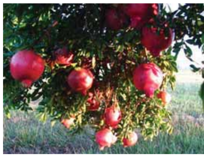
Figure 6. (Top) Use clipping shears and cut as close to the fruit base as possible. (Bottom) 'Nikitski ranni' near harvest at Ponder Farm, Tifton, Ga.

Fruit can be stored up to six weeks in open-air storage or five months using controlled atmosphere storage (CA). CA is also useful for controlling the incidence of storage scald (the browning of the red pigments in the rind of the fruit). For high quality fruit, the lowest temperature used should be 41°F for short-term storage (less than three weeks); 45°F is more appropriate for longer-term storage. For fruit with known disease pressures, it is advisable to store for less than three weeks at a reduced temperature of 32-34,F. Low temperature discourages pathogen growth and spread, but will also cause chilling injury in fruit stored longer than three weeks. This will ultimately result in increased pathogenicity during and after removal from low temperature storage.