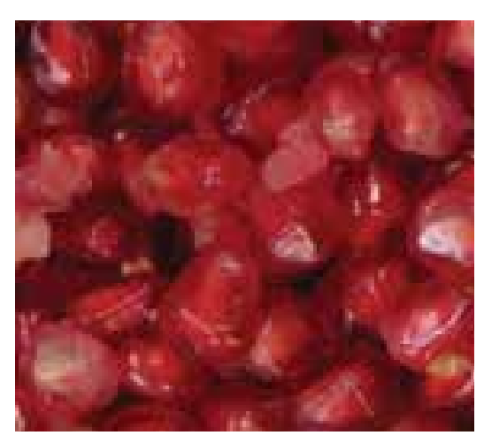
Figure 1. Arils of pomegranate cultivar 'Kaj-acik-anor.' Arils are comprised of the outer shell, seed and, as seen in this cultivar, a brightly pigmented red juice.

The pomegranate ( Punica granatum ) is a naturally dense, deciduous, bushy, multi-stemmed shrub that typically grows to heights of 10 to 12 feet and bears highly colored fruit with many juicy seeds inside. In some regions, pomegranates are trained into small trees with a single trunk. The branches tend to be slender and thorny, while the leaves are glossy and dark green. The colorful orange-red flowers appear in the spring and summer and are either bell-shaped (female) or vase-shaped (hermaphroditic), with the latter type being sterile. The edible portion of the fruit, called an aril, is comprised of hundreds of seeds surrounded by juicy pigments, each contained within a seed coat (Figure 1). Seeds are either soft or hard, depending on the cultivar. The juice within the aril varies from light pink to dark red, but can also appear yellow or clear in some varieties. The juice ranges from very acidic to very sweet in taste. The rind is generally smooth but leathery, and can be yellow, orange or red in color.