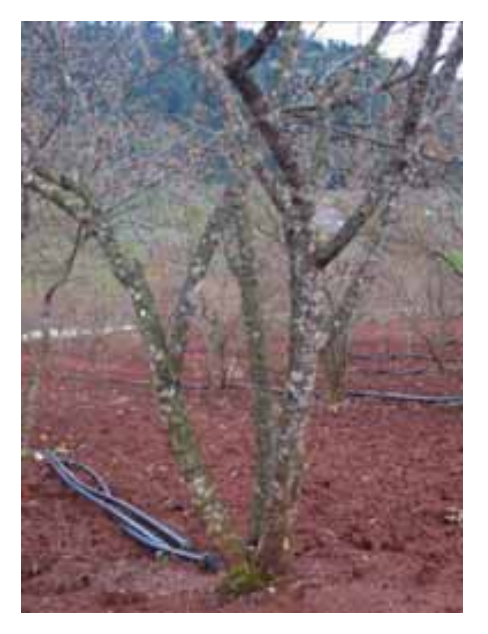
Figure 3. Examples of multi-trunk (left), single-trunk (center) and triple-trunk (right) tree training strategies.