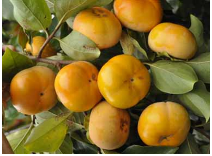
Figure 8. 'Ichikikei Jiro' cultivar.

'Ichikikei Jiro' is a bud sport of Jiro and is low to moderate in vigor (Figure 8). It blooms later than most persimmon cultivars. Fruit size is medium-large with soluble solids of 16% to 19%. Some fruit sustain tip cracking. Fruit are oblate. Harvest season is mid-October to mid-November. 'Ichikikei Jiro' is recommended for north and north central Florida.