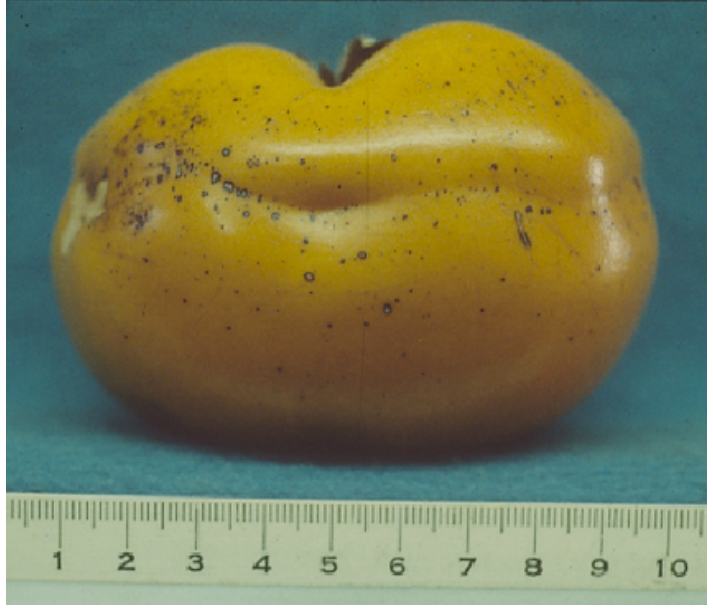
Figure 27. 'Tamopan' cultivar.

'Tamopan' is a cultivar with large fruit having a circular depression around the top third nearest the stem (Figure 27). The fruit is juicy, watery, and stringy, with a thick peel. More than one cultivar of this tree exists, some of which have better fruit than the one described.