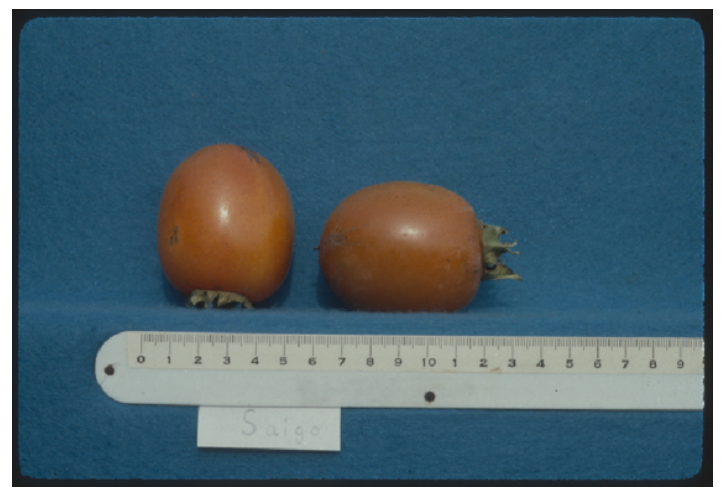
Figure 18. 'Saijo' cultivar.

'Giombo' is similar to 'Saijo' in fruit quality, although the fruit are much larger and begin ripening 2 weeks later (Figure 19). Fruit are light translucent orange and thin-peeled with a sweet, juicy, jelly-type flesh. 'Giombo' fruit are a connoisseur's choice. The tree is early to start growth in the spring and is sometimes injured by freezing temperatures.