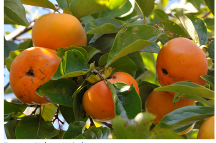
Figure 10. 'Makawa Jiro' cultivar.

'Maekawa Jiro', a bud sport of Jiro, is low to moderate in vigor (Figure 10). Fruit size is large, and fruit shape is oblate. There is some tendency for fruit to incur tip cracking. Harvest season is mid-October to mid-November. 'Makawa Jiro' is not recommended for north and north central Florida.