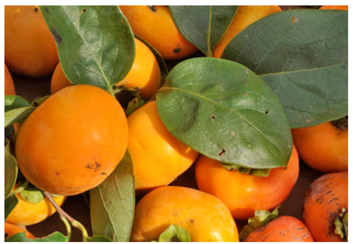
Figure 7. 'Matsumoto Wase Fuyu' cultivar.

'Matsumoto Wase Fuyu' is an earlier-ripening bud sport of 'Fuyu' (Figure 7). The tree sets many flowers and produces heavy, clustered crops. The clusters should be thinned to prevent bent limbs with excessive fruit loads. Larger fruit are sometimes prone to calyx separation. The tree is moderately vigorous and of medium size. Soluble solids range from 16% to 19%, which is generally true for most mid-season types. Fruit is medium in size and oblate in shape. There is little or no tendency for fruit to incur tip cracking.