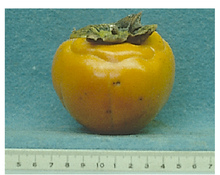
Figure 11. 'Midia' cultivar.

'Midia' trees are moderate in vigor but are more susceptible to tree decline than most other Japanese persimmons (Figure 11). Fruit set and fruit retention until harvest are not consistently high. 'Midia' produces the largest fruit of any cultivar of nonastringent persimmon. Fruit shape is round with an indented ring around the top of the fruit. Harvest season is late October to mid-November. 'Midia' is not recommended for north and north central Florida.