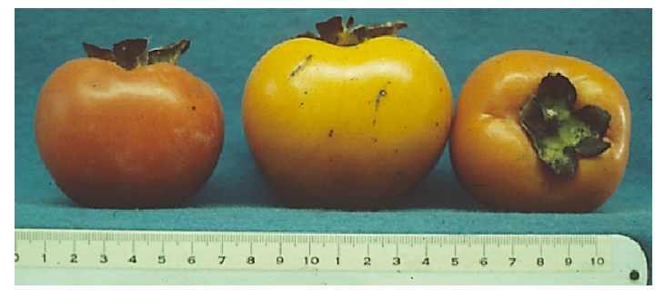
Figure 20. 'Eureka' cultivar.

'Eureka' has been widely propagated by southern nurseries and is a common cultivar in Texas (Figure 20). It has a large, round, flat-shaped, pollination-variant fruit with a medium amount of dark flesh around the seed.