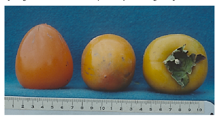
Figure 19. 'Giombo' cultivar.

'Giombo' is similar to 'Saijo' in fruit quality, although the fruit are much larger and begin ripening 2 weeks later (Figure 19). Fruit are light translucent orange and thin-peeled with a sweet, juicy, jelly-type flesh. 'Giombo' fruit are a connoisseur's choice. The tree is early to start growth in the spring and is sometimes injured by freezing temperatures.