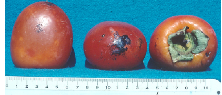
Figure 22. 'Yomato Hyakume' cultivar.

'Yomato Hyakume' is a pollination-variant type, but it does not have a great deal of dark flesh around the seeds. The fruit are large, with a deep orange-red color (Figure 22). Concentric ring cracking often occurs. This cultivar is a heavy annual cropper with good fall leaf retention. It is excellent for dried fruit and is one of the best astringent types.