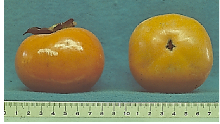
Figure 12. 'Hana Fuyu' cultivar.

'Hana Fuyu', also known as 'Yotsundani', or 'Giant Fuyu', regulates crop loads well and is of medium vigor (Figure 12). The fruit are slightly larger than most, are generally free of imperfections, and may be slow to lose astringency. The tree is a good homeowner cultivar.