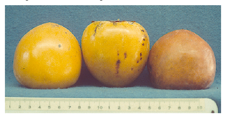
Figure 23. 'Tanenashi' cultivar.

'Tanenashi', the most popular astringent cultivar in Florida, matures heavy crops without pollination and will seldom set seed even if pollinated (Figure 23). It is usually desirable to thin the fruit to obtain some vegetative growth during the year. The fruit, often large (3½" across), can weigh over ¾ of a pound. Skin color is deep yellow to orange when mature. The flesh is orange, pasty, comparatively dry, and of acceptable quality. Soluble solids average 16%. Harvest duration may extend from September through November. It is a good tree for homeowners.