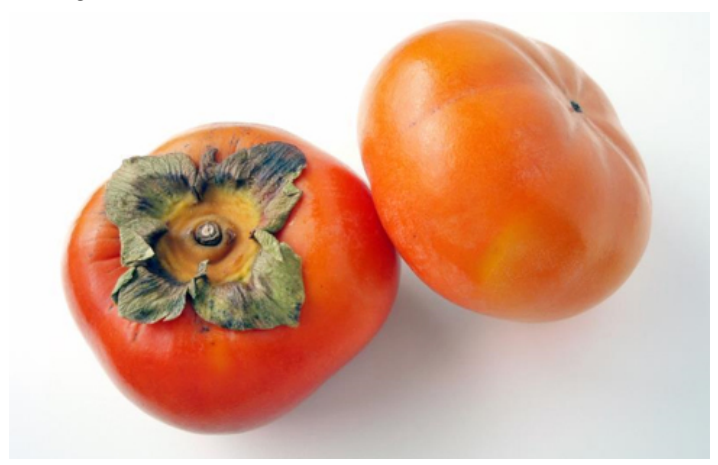
Figure 9. 'Jiro' cultivar. Credits: Edible Landscaping LLC

'Jiro' is moderate in tree vigor. Cropping can be erratic when trees are young, but more consistent yield is produced on older trees (Figure 9). Fruit size is medium-large, soluble solids are 16%–19%, and fruit shape is oblate. Some tip cracking on fruit may occur. Harvest season is mid-October through mid-November. 'Jiro' is recommended.