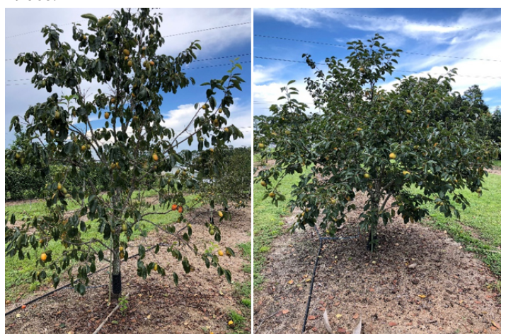
Figure 5. Tree size and shape can be varied among cultivars 'Saijo' (left) and 'Fuyu' (right).

trees fall into this category. Trees in the tall class are upright and often have small fruit. Generally, tree size is reduced south of Gainesville to south Florida. It has been observed that trees grown in Florida are often smaller than would be expected in their native land; common cultivars barely reached 10 ft in height after 10 years in trials during the 1960s.