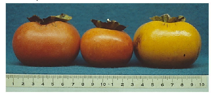
Figure 25. 'Hiratanenashi' cultivar

always seedless. The astringency is sometimes difficult to remove after the fruit have been harvested unless they are artificially treated.