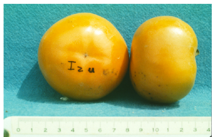
Figure 6. 'Izu' cultivar.

'Izu' has the distinction of being the earliest ripening nonastringent cultivar (Figure 6). Tree vigor is very low, and it is not precocious. Fruit size is medium-large, and soluble solids average 16%. Fruit shape is oblate, and a fair percentage of fruit show imperfections. Harvest season is late September through mid-November. 'Izu' is sometimes recommended due to early ripening.