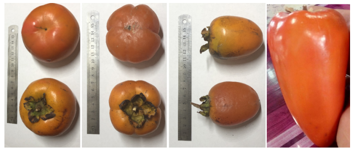
Figure 3. Different fruit shapes among persimmon cultivars.

The three general fruit shapes are conic (cone-shaped), roundish (round and sometimes pointed at the apex like an acorn), and oblate (flattened like a large standard tomato) (Figure 3). Some cultivars have other noticeable characteristics, such as an indented ring around the fruit of 'Midia' and 'Tamopan'. Four sides will sometimes be apparent on fruit of 'Great Wall' or 'Saijo'. Distinctly lobed sections are present on 'Sheng' and 'Peiping'. Some cultivars are tucked or folded in at the calyx, like 'Suruga'.