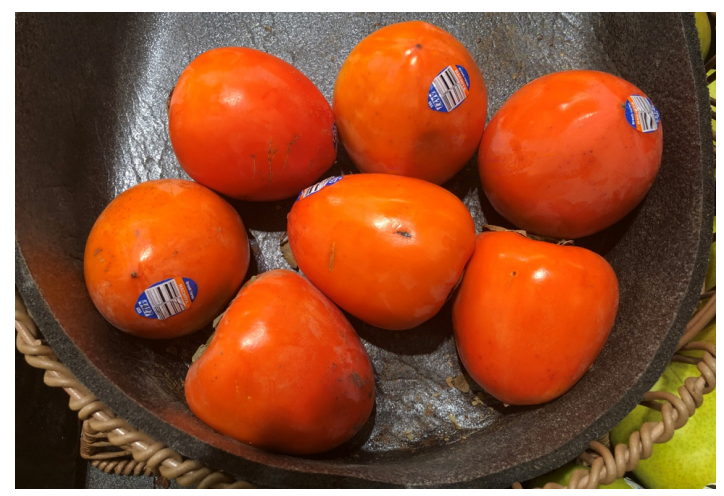
Figure 24. 'Hachiya' cultivar.

'Hachiya' is a commercial cultivar in California (Figure 24). Ability to set and hold fruit is sometimes a problem if this cultivar is propagated onto Diospyros virginiana rootstock. The fruit are high quality and jelly-fleshed, with an attractive red skin coloration. Fruit will often have concentric ring cracking at the apical end and will ripen unevenly starting from these points. In Japan, 'Hachiya' is mostly used for drying. It remains astringent until fully ripened and soft.