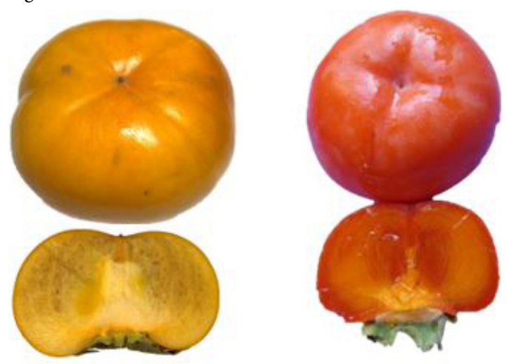
Figure 1. Nonastringent persimmon 'Fuyu' (left) and astringent 'Hiratanenashi' (right) ready-to-eat cultivars.

The second classification relates to fruit flesh color when seeds are present. In pollination-variant types, the flesh is dark and streaked around the seeds, but clear orange when seedless. Pollination-constant types lack the dark streaking regardless of seed set.