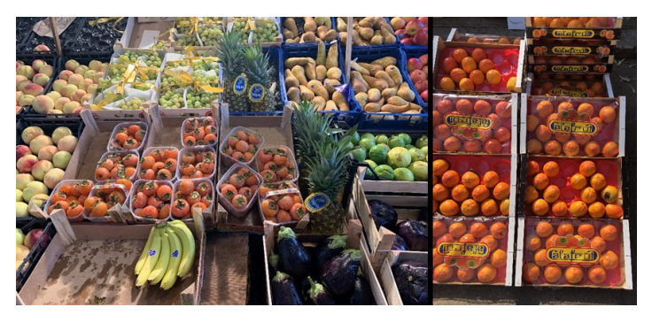
Figure 2. Astringent (left) and nonastringent (right) types in a local supermarket in Palermo, Sicily, Italy in 2019.

The marketing window for fresh persimmons is from September through December. Direct marketing through farmer's markets, on-farm stands, and U-pick operations are common methods to sell the fruit (Figure 2). Astringent-type persimmons can be difficult to market. Many commercially marketed California astringent persimmons, although attractive, have been picked too early. This does not allow the fruit to lose astringency without treatment and gives consumers an unpleasant experience, such that they are reluctant to eat persimmons again. In Japan, to remove astringency, fruit are sprayed with 35%–40% ethyl alcohol and placed in a sealed container for 10 days at 69°F. The firm product is of good quality, is easily marketed, and will soon soften.