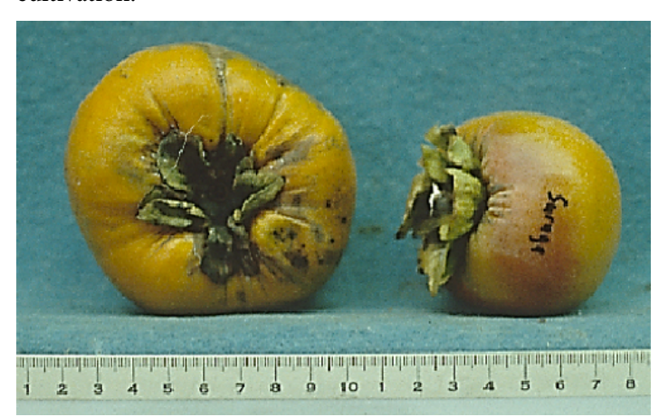
Figure 16. 'Suruga' cultivar.

'Suruga' trees are moderate in vigor (Figure 16). They produce late-ripening fruit that are exceptionally sweet (soluble solids = 18%–21%). Their fruit shape is classified as oblate conic, and fruit imperfections are fairly common. Fruit size is medium large. Harvest season is late November to early December. It appears to be susceptible to premature defoliation. 'Suruga' is not recommended for commercial cultivation.