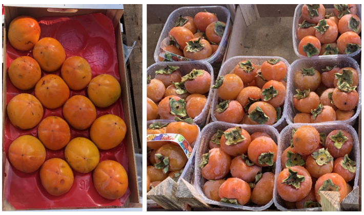
Figure 4. Fruit size among persimmon cultivars can be varied from 3.5 oz (100 g) to 14 oz (400 g).

Fruit size is affected by crop loads. The lighter the crop set, the larger the fruit. Small fruit generally weigh 3.5 oz (100 g) to 4.5 oz (130 g), medium fruit range from 5.5 oz (150 g) to 7.0 oz (200 g), and large fruit range from 8 oz (230 g) to 14 oz (400 g) (Figure 4).