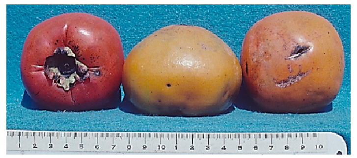
Figure 14. 'Shogatsu' cultivar.