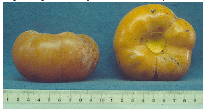
Figure 21. 'Sheng' cultivar. Credits: UF/IFAS Horticultural Sciences Department

'Sheng' is a well-spreading tree with large fruit having lobed sections looking somewhat like a 4- or 6-leaf clover from the top (Figure 21). Fruit have a high jelly content, are bright orange, and when pollinated will set many seed.