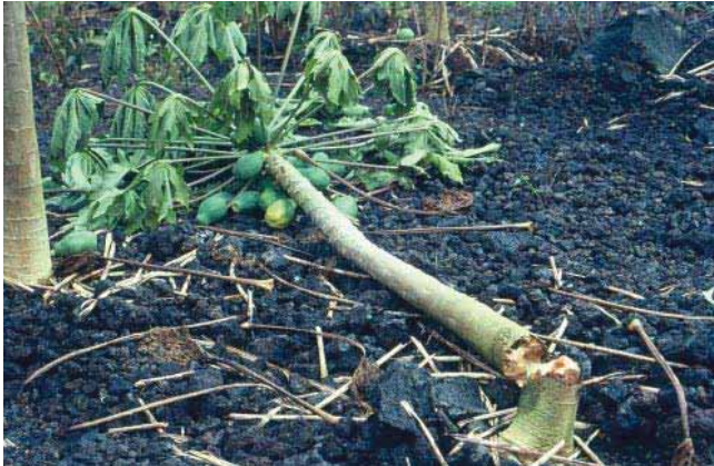
A fallen papaya plant infected near the base of the stem