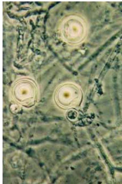
Phytophthora palmivora hyphae, antheridia, and oogonia in culture, highly magnified