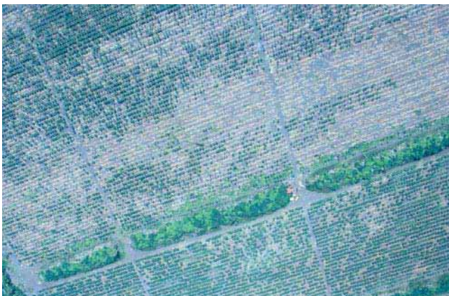
Papaya field severely damaged by Phytophthora blight; note the large areas of missing plants (aerial view).