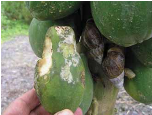
African snails on papaya and associated Phytophthora palmivora hyphae on fruit surfaces; the African snail may vector infective propagules of P. palmivora .