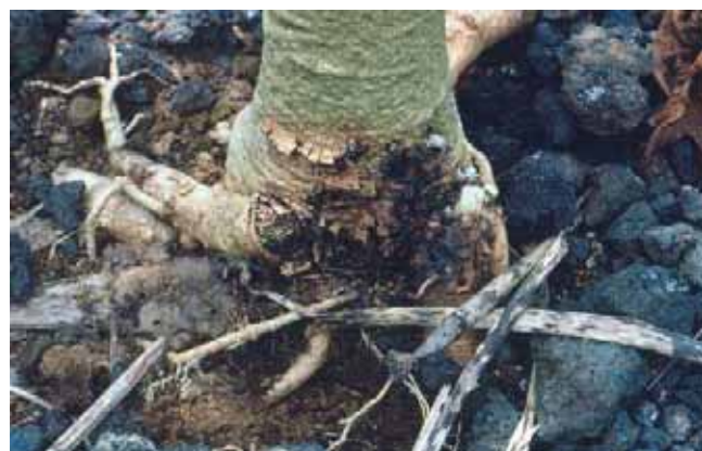
Basal stem rot of a mature papaya plant