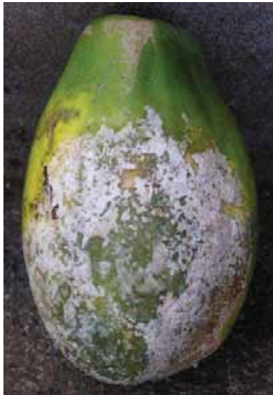
Blighted papaya fruit infected with Phytophthora palmivora , showing the typical white mycelium and sporangia on the fruit surface

Papaya is just one of many plants affected by this pathogen worldwide. Other hosts include breadfruit ( Artocarpus altilis ), palms including the coconut ( Cocos nucifera ), Catteleya orchids, English ivy ( Hedera helix ), and cocoa ( Cacao sp.). The disease occurs on papaya in the Philippines, Sri Lanka, Santo Domingo, India, Indonesia, Malaysia, Hawai'i, Mauritius, Mexico, Australia, Brazil, Spain, Taiwan, and perhaps elsewhere.