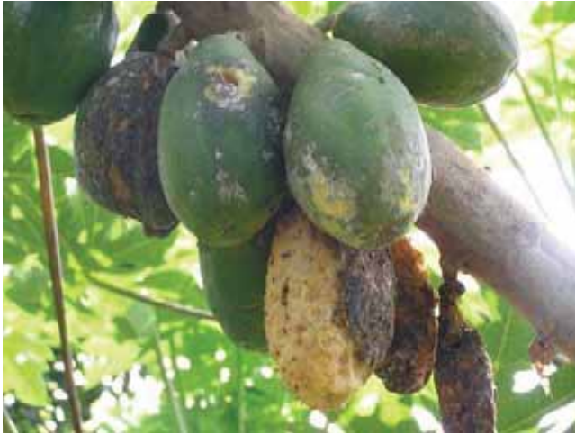
Phytophthora palmivora mycelium associated with snail or slug feeding and bird feeding injury to papaya near Kainaliu, Hawai'i