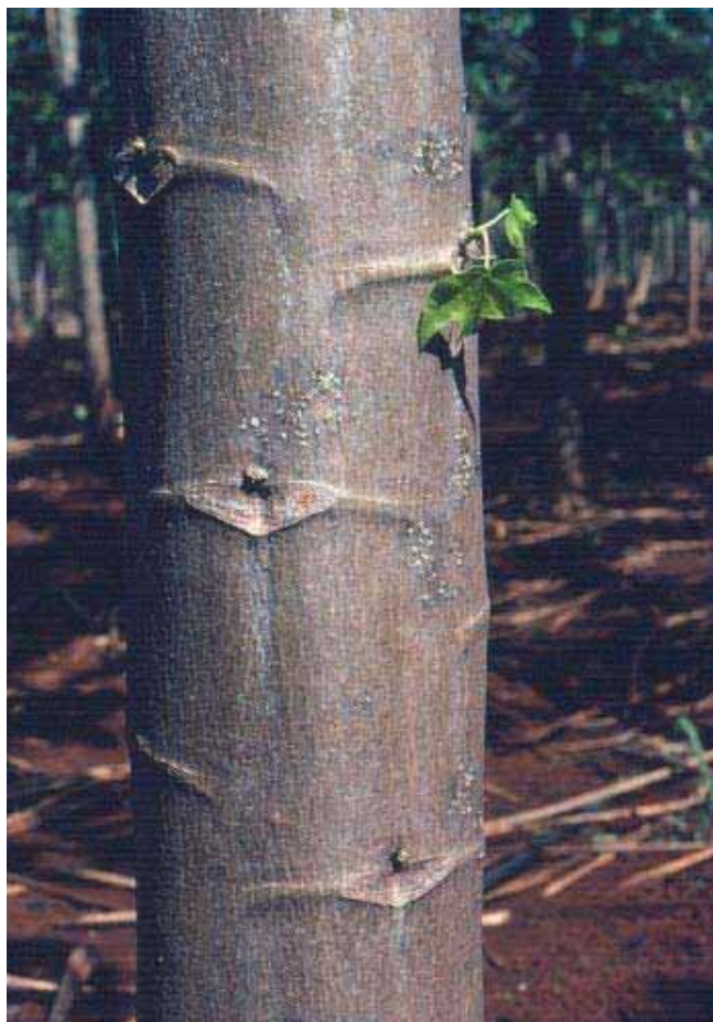
Droplets of papaya latex oozing through gray stem lesions