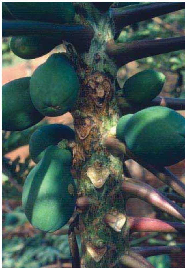
A brown stem canker