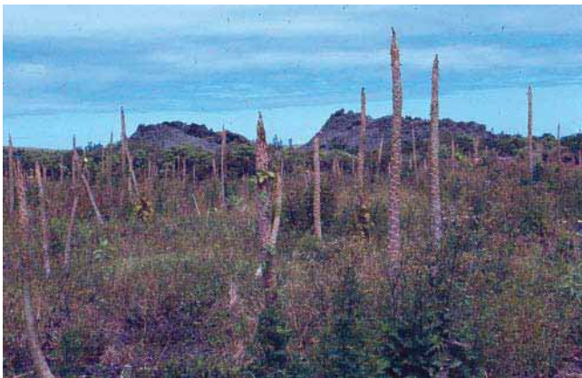
A papaya field destroyed and abandoned after infection by Phytophthora palmivora