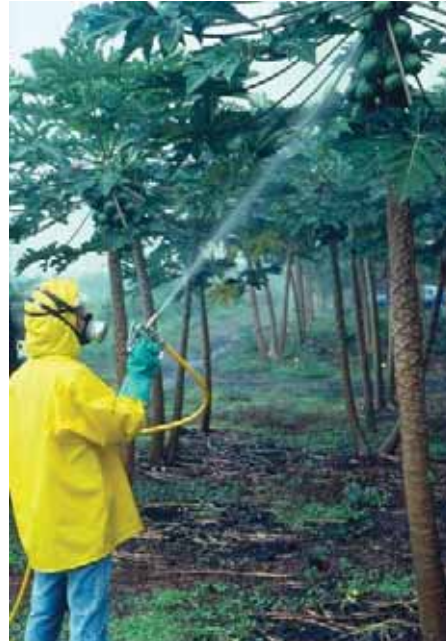
Spraying a papaya fruit column with pesticides to manage Phytophthora blight