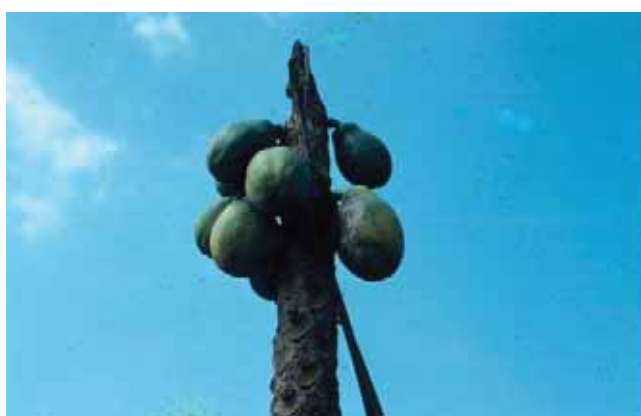
The upper stem of a fruit-bearing papaya plant severely affected by Phytophthora blight