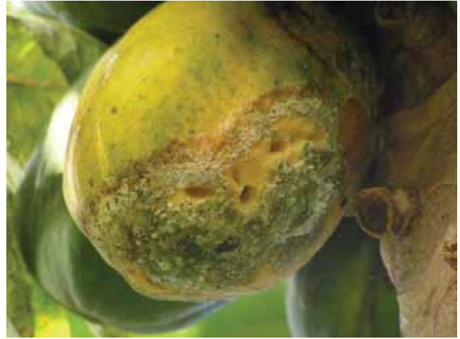
Birds and perhaps a snail or slug has fed on this papaya fruit infected with Phytophthora palmivora . Note the holes in the pulp (bird damage) and the loss of epidermis (perhaps snail or slug damage).