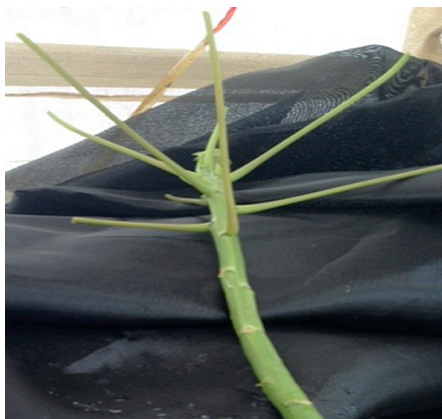
Fig. 3. Intact petioles after removal of leaf lamina. These petioles will eventually drop.