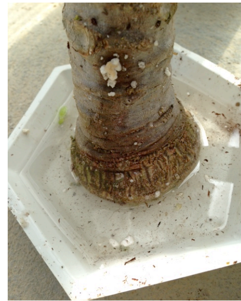
Fig. 4. Dipping the proximal end of the shoot into the gel mixture for 3–5 min.