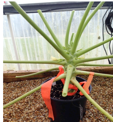
Fig. 5. Large cutting planted into media filled container.

stem every other day (week 1), every two days (week 2), every third day (week 3), and once in week four (Fig. 6). c. Spray the apex of the cutting and all new leaves with fungicide-nutrient solution two to three times a week or apply liquid fertilizer to soil.