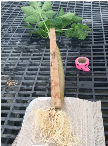
Fig. 7. Root system after two months (potting media removed).

be exposed to natural sunlight conditions for about 10 d. The plants may begin to bloom approximately 4–6 weeks later, weather permitting (Fig. 1 and Fig. 8).