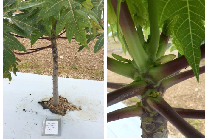
Fig. 8. Planted cutting in the field three months after propagation. Close-up shows flower buds.

Our results substantiate the utility of rooting large papaya shoots. Other authors found that exposure to bottom heat and misting were required for successful results in addition to using IBA (Allan, 1990; Reuveni and Sclesinger, 1990; Traub and Marshall, 1937). However, the protocol we have developed requires neither bottom heat nor mist and can be used under relatively high light conditions. The technique described in this study provides a relatively quick method for clonally propagat-