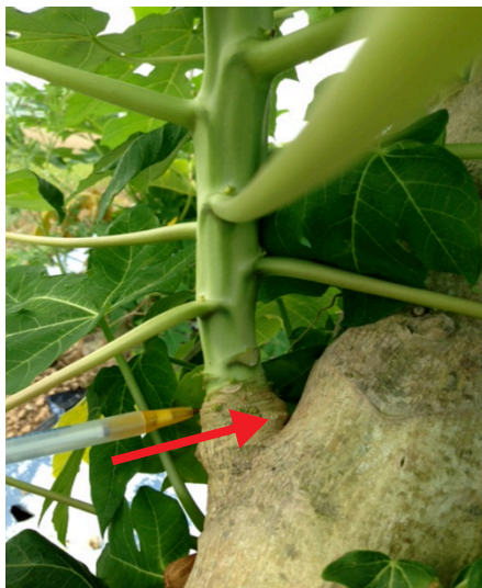
Fig. 2. Papaya side shoot showing swollen base and area to cut (arrow).