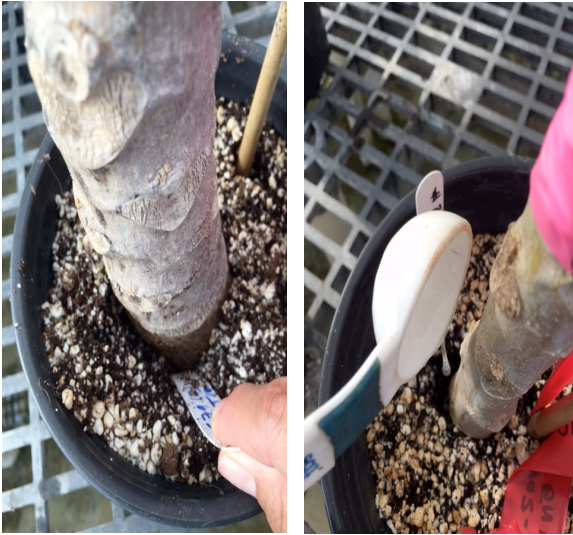
Fig. 6. Application of gel mixture to the base of the cutting.