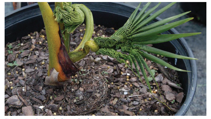
Figure 14. Crumpled new leaf emerging as a side shoot on Dypsis lutescens .

Small, crumpled new leaves in most palm species are a symptom of boron deficiency. However, in clustering palm species such as areca palm ( Dypsis lutescens ), when a new side shoot is emerging through the side of the crownshaft, the first leaf is invariably crumpled in appearance (Figure 14). The next leaf produced on the side shoot is usually normal in appearance, but may occasionally show some crumpling. Subsequent leaves will appear normal.