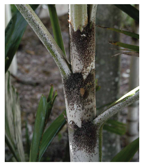
Figure 10. Black scurf on crownshaft of Vetchia sp.

In some palms (e.g., Wodyetia bifurcata , Veitchia spp.) black-colored scurf appears at the bases of the petioles (Figure 10). This black scurf is very similar in appearance to the sooty mold often associated with palm aphids, scales, or mealybugs. In other palms, new spear leaves and young petioles are covered with a thick pinkish to brown fuzzy scurf that is easily rubbed off. The light salmon-colored scurf on new growth of Latania palms (Figure 11) is useful in distinguishing this species from the similar Bismarck palm ( Bismarckia nobilis ), which has very little scurf.