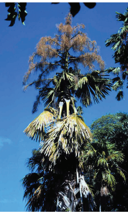
Figure 17. Terminal flowering in mature Corypha sp. It will die after fruiting.

Certain species of palms ( Caryota spp., Corypha spp., Arenga spp., some Metroxylon spp., etc.) flower and fruit only once when the palm is fully mature. After fruiting, the palm dies—often much to the surprise of the palm owner. Hapaxanthic palms may produce a single massive terminal inflorescence (Figure 17), or they may flower at each node along the trunk (Figure 18). Contrary to popular belief, clustering fishtail palm ( Caryota mitis ) stems all die within a period of a year or two after flowering. Any new growths arising from the clump are seedlings that have germinated, not vegetative shoots from the original clump.