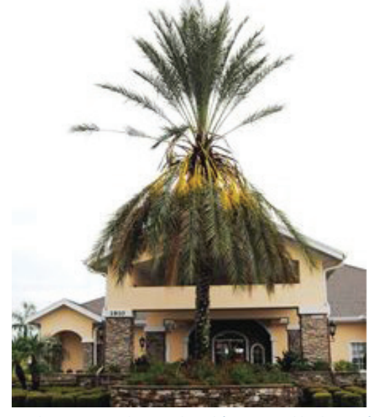
Figure 16. Split crown in Phoenix dactylifera caused by heavy fruit.

Palms that produce heavy clusters of fruit within the crown (e.g., Phoenix dactylifera , Livistona chinensis , etc.) may appear to have a two-tiered canopy (Figure 16). This is caused by the weight of the fruit stalks, each of which can weigh over 100 pounds, forcing the leaves that are below them in the crown downward. This problem can be prevented by removing the flower stalks before they develop fruit.