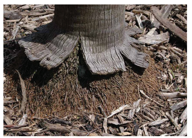
Figure 3. Flared "bark" caused by development of root initials underneath.