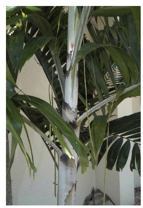
Figure 12. Reins on young leaves of Veitchia sp.