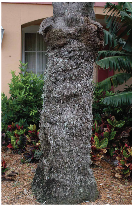
Figure 2. Root initiation zone extending several feet up the trunk in Phoenix dactyifera .