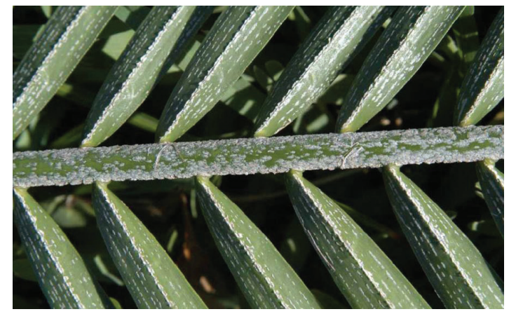
Figure 9. White scurf on young leaf of Phoenix roebelenii.

leaflets of relatively young leaves in this species. As the leaves age, this scurf eventually falls off.