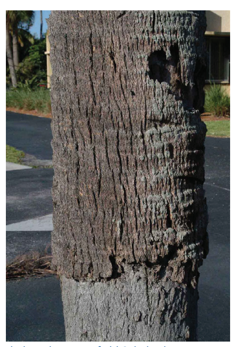
Figure 8. Eroded trunk cortex of old Sabal palmetto.