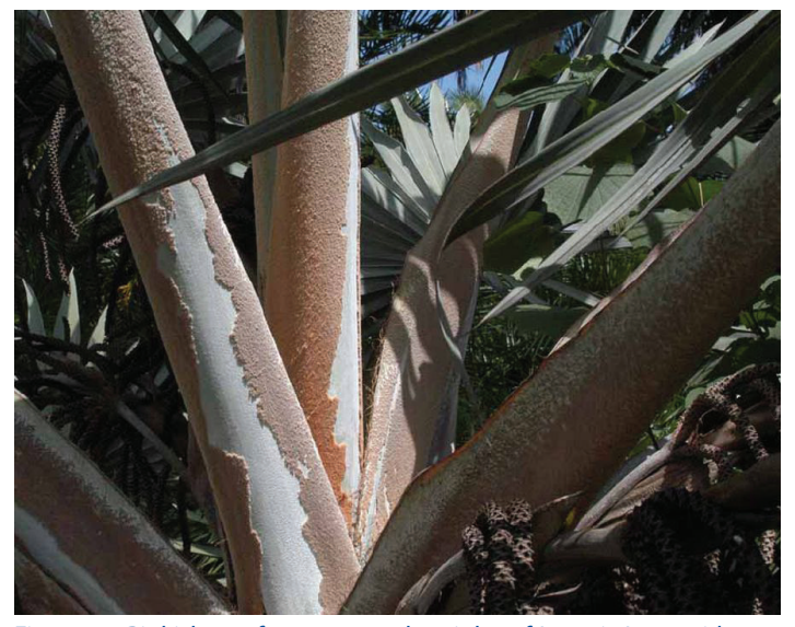
Figure 11. Pinkish scurf on spear and petioles of Latania lontaroides .

but occasionally remains attached to one of the leaflets on young leaves.