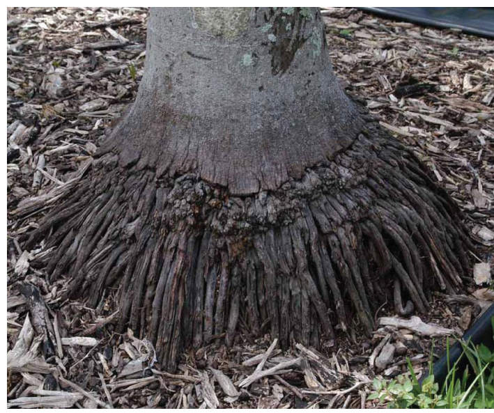
Figure 1. Typical aerial portion of the root initiation zone on a mature palm.

( Phoenix spp.) the root initiation zone can extend several feet up the trunk (Figure 2).