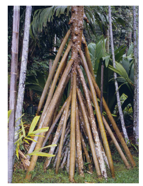
Figure 4. Stilt roots on Iriartea sp.

A few genera of palms, commonly referred to as stilt palms, normally produce a few large-diameter roots from the above-ground portion of the root initiation zone. Unlike most aerial root initials, those in stilt palms can continue their development, even in the absence of a moist soil environment. These large roots grow downward into the soil, supporting and anchoring the palm stem above ground. These roots are referred to as stilt roots (Figure 4). Stilt roots are largely confined to palms within the genera Iriartea , Socratea , and Verschafeltia .