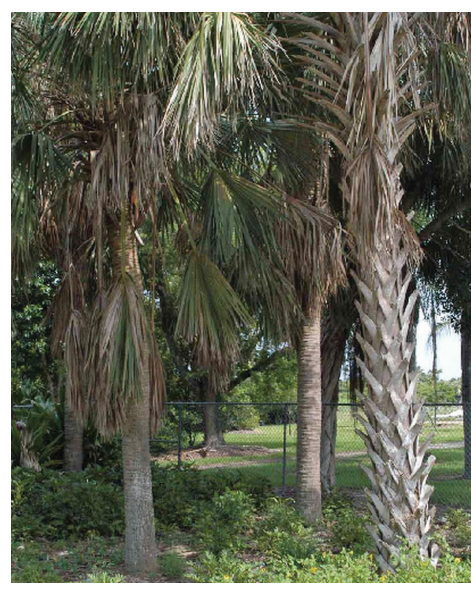
Figure 7. Smooth and "booted" trunks on Sabal palmetto of similar ages.

intact due to the high concentration of sclerified fibers. Loss of sections of palm trunk cortex does not seem to negatively impact palm structural strength or the uptake of water and nutrients, although it certainly can be unsightly.