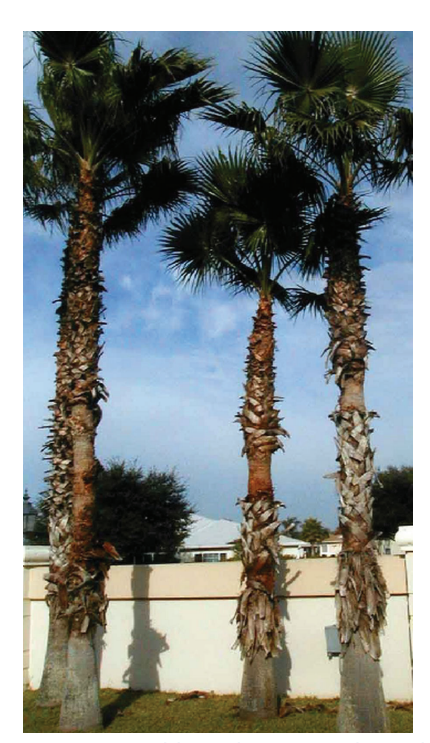
Figure 6. Older (10–15 years old) Washingtonia robusta dropping old leaf bases.