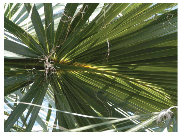
Figure 13. Translucent area on leaf of Sabal palmetto.