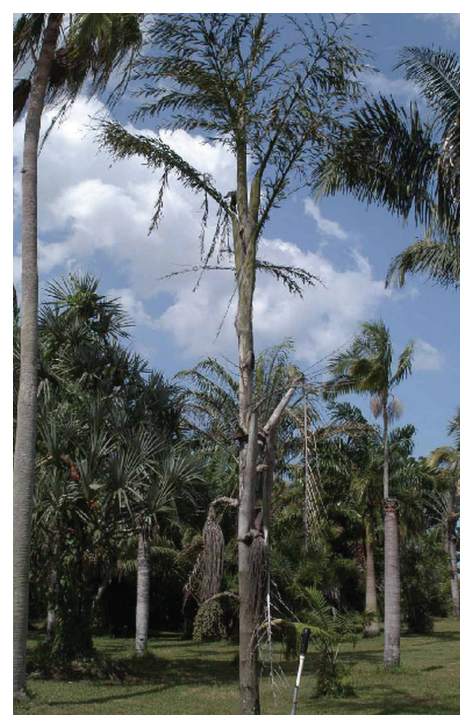
Figure 18. Dead Caryota urens that has just completed its fruiting.