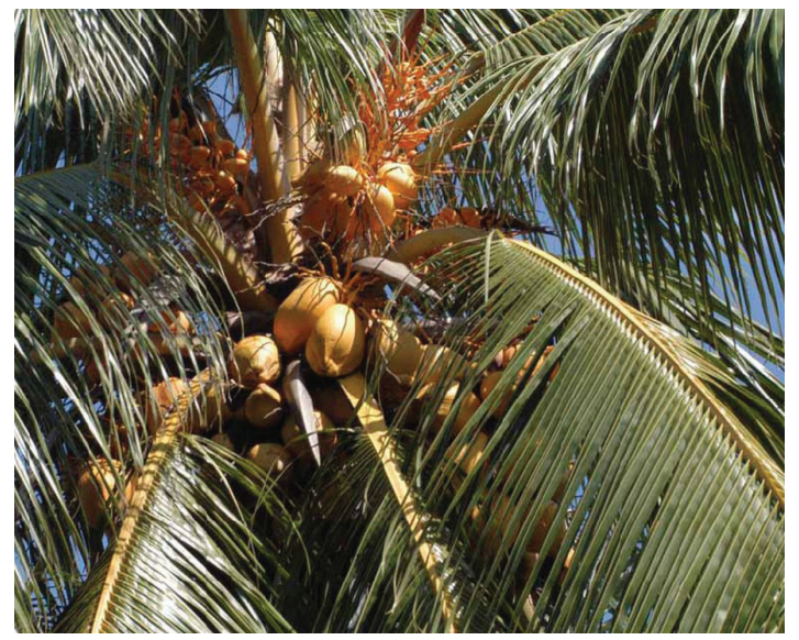
Figure 15. Normal golden yellow colored petioles, rachises, and inflorescences in 'Golden Malayan Dwarf' coconut palm.

light yellow to intense orange-red colored petioles, rachi, inflorescences, and immature fruits. Leaflets on these palms should have dark green lamina, but the midvein can be yellow. If the leaflets are not green, that is an indication of a nutrient deficiency.