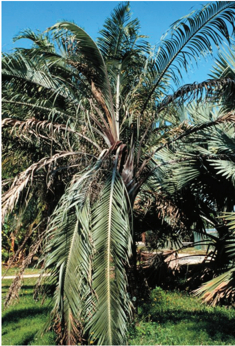
Figure 11. Foliar browning symptoms of Lethal Yellowing on Dypsis decaryi .