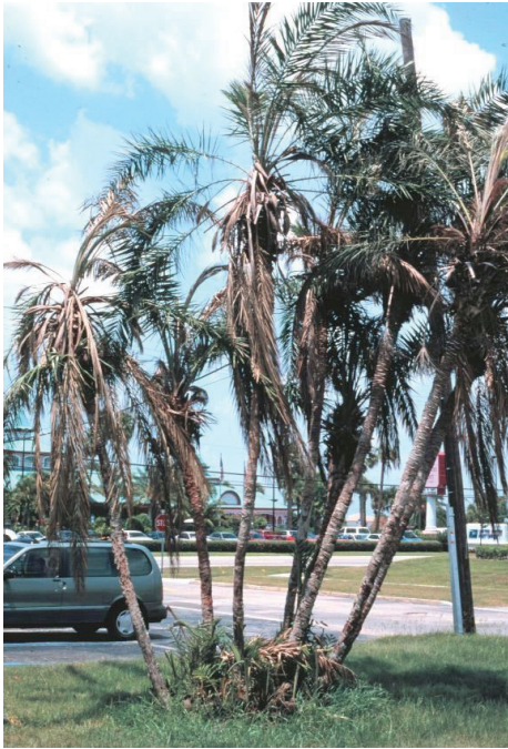
Figure 14. Foliar browning symptoms of Lethal Yellowing on Phoenix reclinata .