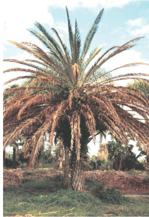
Figure 13. Foliar browning symptoms of Lethal Yellowing on Phoenix sylvestris .