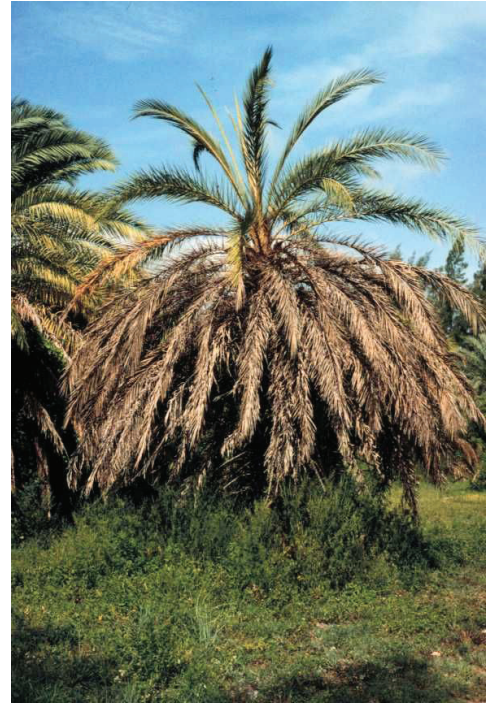
Figure 12. Foliar browning symptoms of Lethal Yellowing on Phoenix dactylifera .