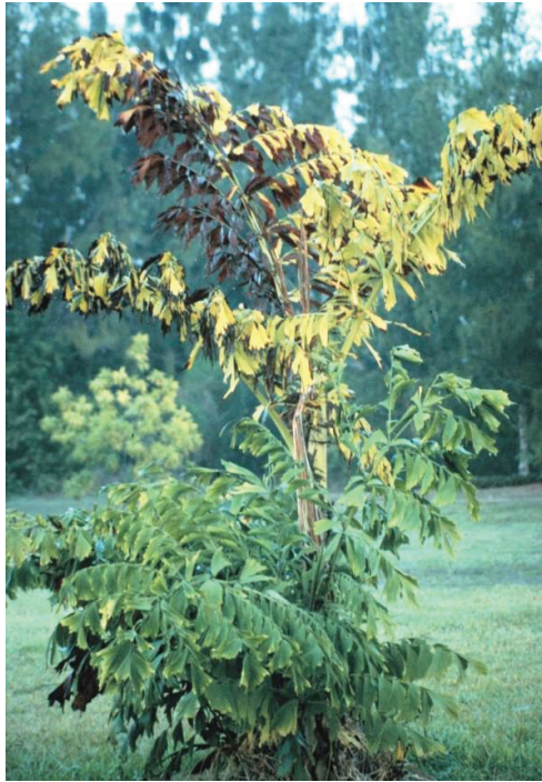
Figure 6. Foliar yellowing symptoms of Lethal Yellowing on Caryota mitis .