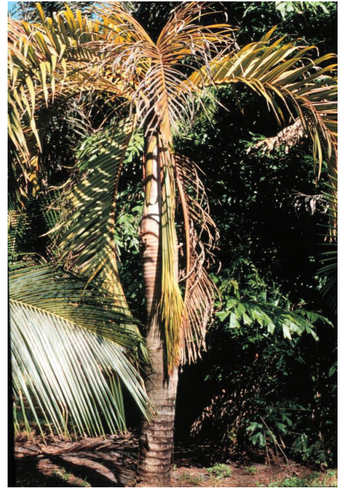
Figure 8. Foliar yellowing symptoms of Lethal Yellowing on Hyophorbe verschaffeltii .