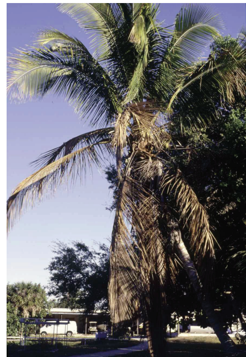
Figure 5. 'Maypan' Cocos nucifera with Lethal Yellowing exhibiting discoloration of leaves (grayish-brown rather than yellow).