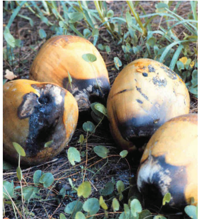
Figure 1. Fruits that prematurely dropped from Cocos nucifera due to Lethal Yellowing. Note dark, water-soaked calyx (stem) end.

Boron deficiency in coconut will also cause premature nut drop. However, nuts dropped due to boron deficiency will not have the discolored, water-soaked appearance at the calyx (stem) end of the nut (Figure 1).