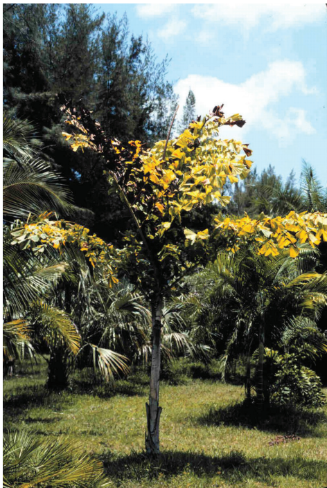
Figure 7. Foliar yellowing symptoms of Lethal Yellowing on Caryota rumphiana .