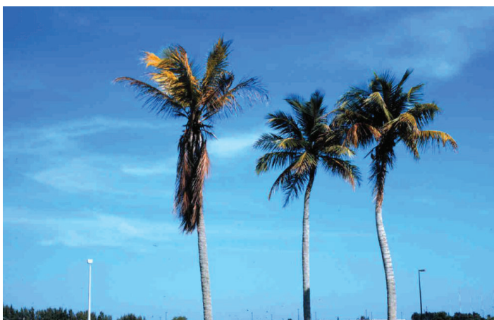
Figure 3. 'Jamaica Tall' Cocos nucifera on left is exhibiting Lethal Yellowing symptoms of a solitary yellowed leaf ("flag leaf") in middle of canopy plus dead leaves hanging down around trunk.