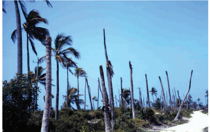
Figure 16. Death of Cocos nucifera apical meristem (bud) from Lethal Yellowing causes crown to wither and topple from trunk.

Eventually, the entire crown of the palm withers and topples, leaving a bare trunk standing (Figure 16). Infected palms usually die within 3 to 5 months after the first appearance of symptoms.