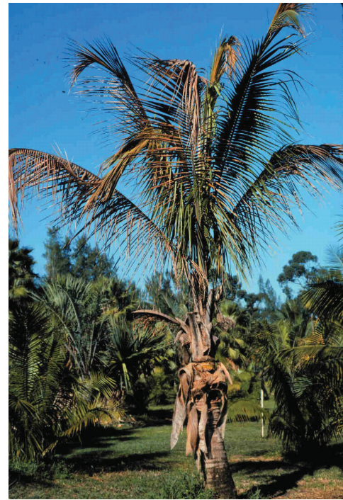
Figure 4. Green form of 'Malayan Dwarf' Cocos nucifera with Lethal Yellowing exhibiting discoloration of leaves (grayish-brown rather than yellow) and overall wilted appearance.