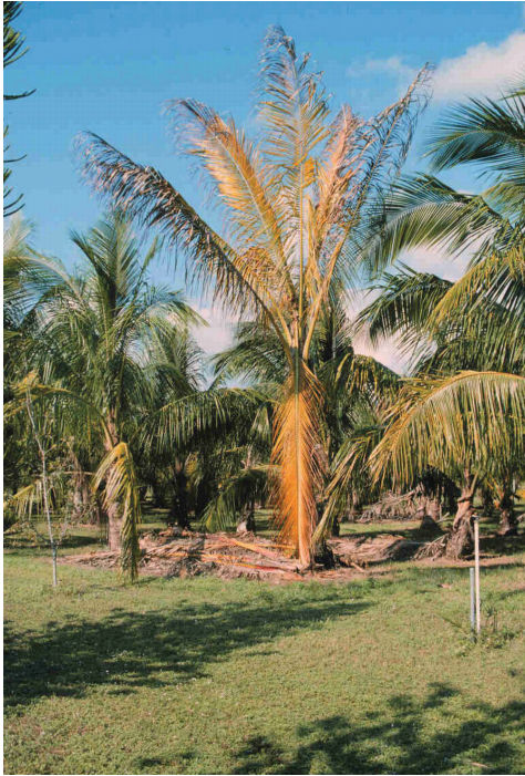
Figure 2. Foliar yellowing symptoms of Cocos nucifera due to Lethal Yellowing.

For other palm species, such as Adonidia merrillii (Christmas palm), Borassus flabellifer (palmyra palm) (Figure 10), Dypsis decaryi (Triangle palm) (Figure 11), Phoenix spp. (Canary Island date palm, date palm, wild date palm) (Figures 12, 13, and 14), and Veitchia arecina (Montgomery palm), successively younger leaves turn varying shades of reddish-brown to dark brown or gray rather than a distinctive yellow.