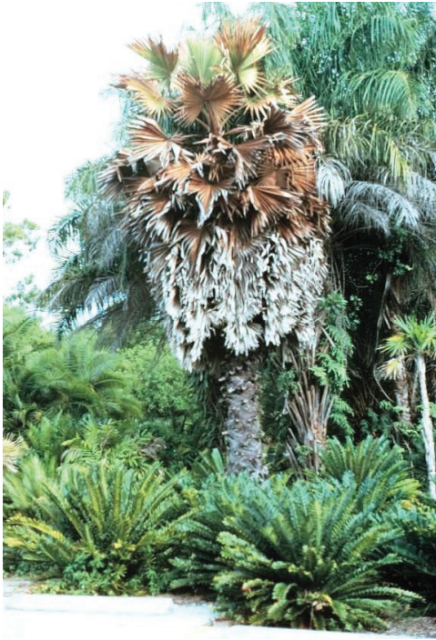
Figure 10. Foliar browning symptoms of Lethal Yellowing on Borassus flabellifer .