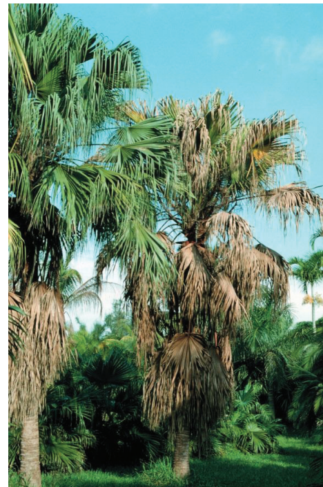
Figure 9. Foliar yellowing symptoms of Lethal Yellowing on Livistona chinensis .