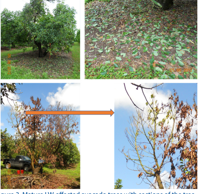
Figure 3. Mature LW-affected avocado trees with sections of the tree with copious leaf drop and other sections with leaves remaining on the stems prior to dieback and death.

2. Previous recommendations based on research reported that prophylactic systemic propiconazole (Tilt®) fungicide infusion protected avocado trees from LW for 12 to 18 months (Crane et al. 2016; Ploetz et al. 2011d). However, infusion of propiconazole fungicide is too