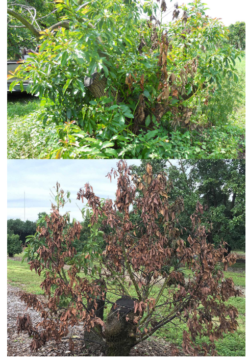
Figure 4. (A) Regrowth and some branch dieback of tree cut to a stump (~1.2 m height), and (B) tree regrowth dies back repeatedly until the tree is dead. Credits: J. H. Crane, UF/IFAS

Figure 2. The visible external symptoms of laurel wilt disease begin as green-leaf wilting (A), typically in one section of the tree (B). Frass straws from AB boring may be evident (C), and the sapwood has blackish-brown-blue streaks (D). Credits: J. H. Crane, UF/IFAS