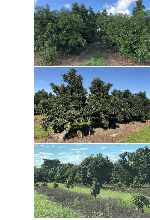
Figure 5. Light exposure of highly shaded (A), top-worked (B), and newly planted (C) areas of an orchard.

2. Previous recommendations based on research reported that prophylactic systemic propiconazole (Tilt®) fungicide infusion protected avocado trees from LW for 12 to 18 months (Crane et al. 2016; Ploetz et al. 2011d). However, infusion of propiconazole fungicide is too