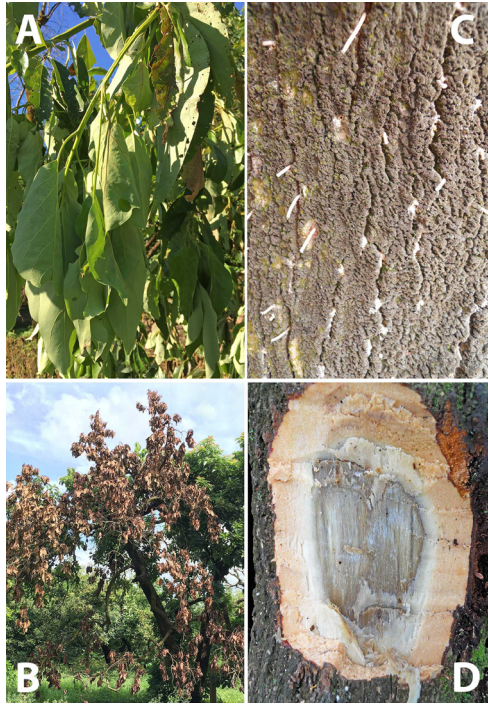
Figure 2. The visible external symptoms of laurel wilt disease begin as green-leaf wilting (A), typically in one section of the tree (B). Frass straws from AB boring may be evident (C), and the sapwood has blackish-brown-blue streaks (D).