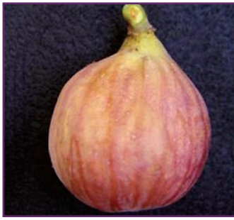
Figure 6. 'Blue Giant'