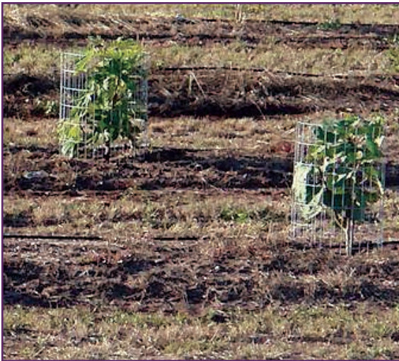
Figure 11. Young fig plants fitted with wire cages to be packed for freeze protection

tained temperatures to 17°F, but young plants and young, tender trunks are more susceptible than are older, mature trunks.