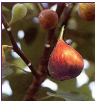
Figure 4. 'Texas Everbearing'