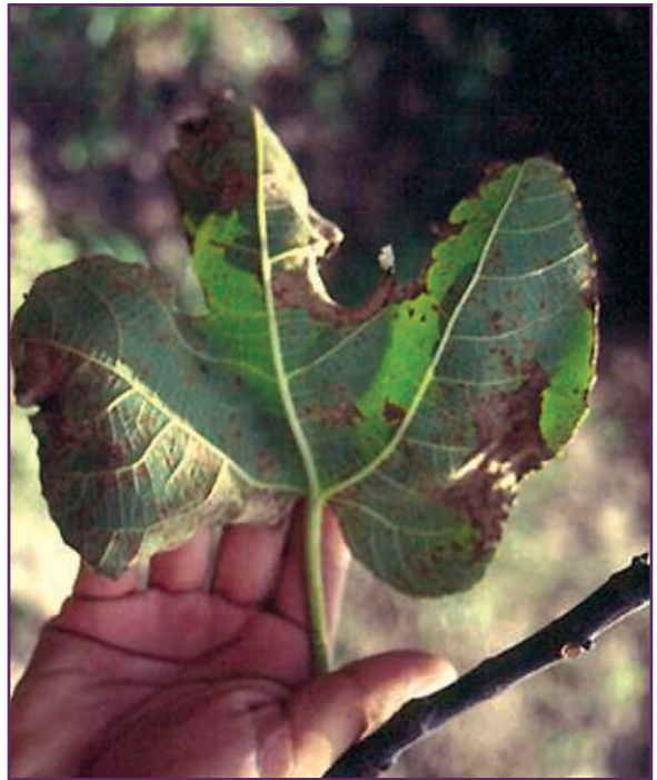
Figure 12. Fig rust on foliage

Figs bear their first crop in late spring, but many varieties produce a larger crop in late summer through fall. When frozen to the ground, the fall crop may be smaller, delayed, or in some varieties, absent.