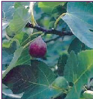
Figure 3. 'Celeste'