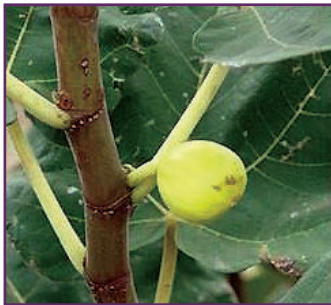
Figure 8. 'Lemon'