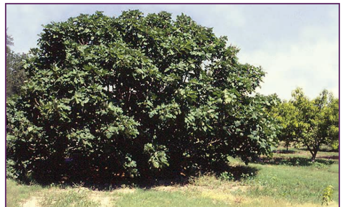
Figure 1. Multi-trunked fig tree

Although commercial fig cultivation in Texas has been largely unsuccessful, small dooryard plantings can meet a family’s needs and provide some limited income from local sales. Because figs must be ripened on the tree and are quite perishable, even modest commercial ventures must have well-planned marketing strategies