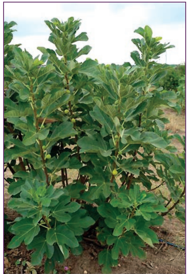
Figure 10. Young, multi-trunk fig trees

To minimize freeze injury during dry falls and winters, thoroughly water the fig trees a few days before a hard freeze. Figs can usually tolerate sus-