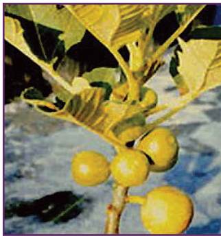
Figure 2. 'Alma'