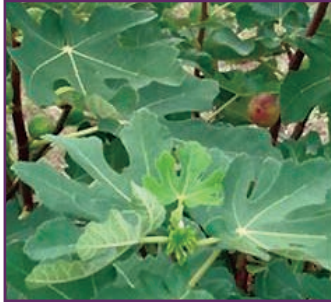
Figure 7. 'Bournabat'