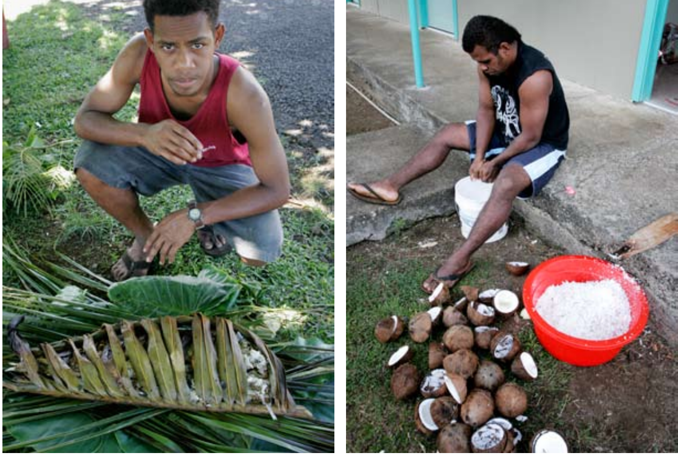
Left: Fish cooked in underground oven wrapped in coconut leaf. Right: Grating coconut for cream is a morning ritual in many Pacific islands. Both photos were taken in Alafua, Samoa.

One of the most useful plants, coconut provides numerous products commonly used in households. Perhaps the most common product in the Pacific is coconut milk (or cream) which is extracted from the freshly grated endosperm of the mature fruit. The water from the nut cavity of young nuts is a wonderful drink that is aseptic in healthy fruits. Eighteen to twenty-four coconut palms in their prime could provide one person with a daily supply of pure drinking water when consumed at a rate of three drinking nuts per day. The nut, shell and husk, fronds, and other