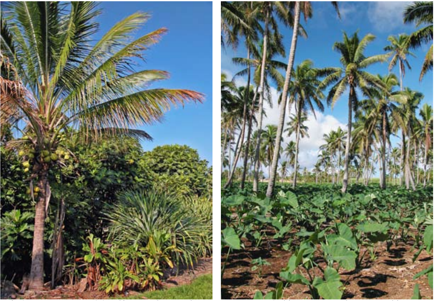
Left: Coconut growing with breadfruit, pandanus, and ti, Kona, Hawai'i. Right: Taro growing under coconuts, Tongatapu, Tonga.

The best-known introductions by the Polynesians and Micronesians, in addition to coconuts, are the breadfruit ( Artocarpus altilis ), banana ( Musa spp.), yam ( Dioscorea spp.), taro ( Colocasia esculenta ), and sugarcane ( Saccharum officinarum ). These were presumably grown together further inshore, as they are today. Other useful plants introduced by the Polynesians into the Pacific include candlenut ( Aleurites moluccana ), bamboo ( Schizostachyum glacuifolium ), wild ginger ( Zingiber zerumbet ), ti ( Cordyline fruticosa ), and paper mulberry ( Broussonetia papyrifera ).