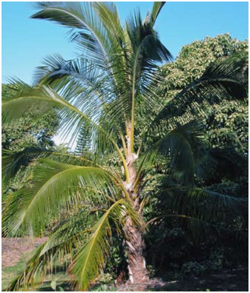
A juvenile at the onset of bearing age, showing rapid vegetative growth.