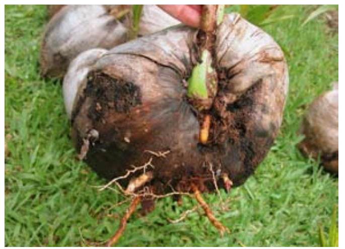
Germinating seednut ready for transplanting.

Germinating nuts are removed at regular intervals (weekly