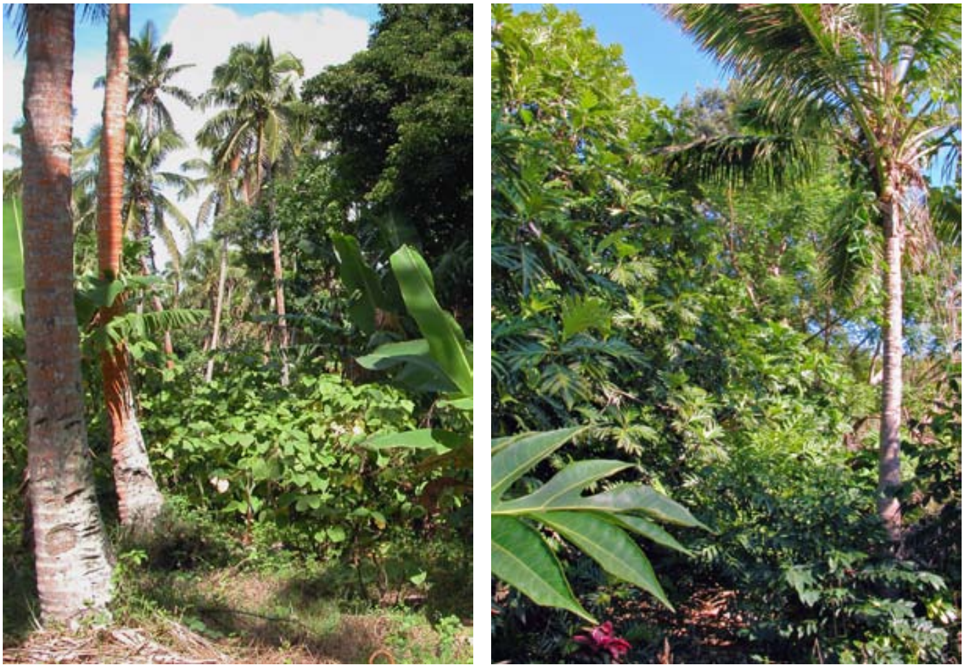
Left: Kava ( Piper methysticum ) and bananas grown as an understory crop, Tongatapu, Tonga. Right: Mixed garden with breadfruit, vi ( Spondias dulcis ), coffee, and many other crops, Kona, Hawai'i.