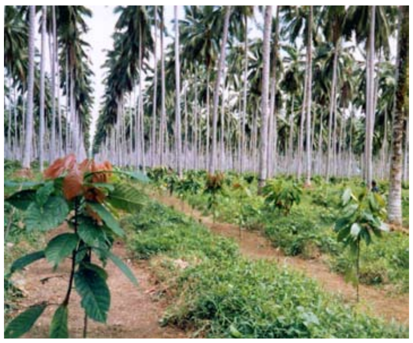
Improving farm productivity by underplanting 40-year-old coconut palms with cocoa ( Theobroma cacao ) in Samoa. The cocoa is 18 months old and when mature will shade out the grasses and lay down a thick layer of leaf litter. Note the increased light penetration through the canopies of the old palms.

PNG where oil palms have been grown in proximity to coconuts, some coconut pests (rhinoceros beetle and palm weevil) and diseases ( Ganoderma root disease) have crossed