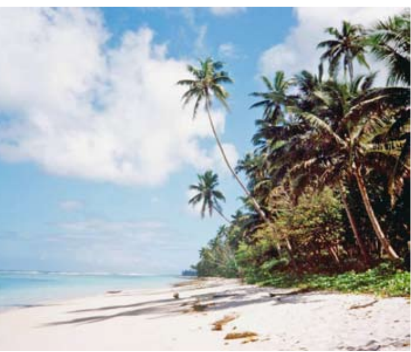
Coconut palms growing on the foreshore of a Pacific island beach. Floating nuts would have been deposited just above the high water mark by large waves, where they then became established.

The coconut palm has wide pantropical distribution. It is a ubiquitous sight in all tropical and subtropical regions 23° north and south of the equator. It is also found outside these latitudes, where it will flower, but fruits fail to develop normally. It is believed that Polynesians migrating into the Pacific 4500 years ago brought with them aboriginal selections (niu vai). At about the same time, people from Indo-Malaya were colonizing the islands of Micronesia. Malay and Arab traders spread improved coconut types west to India, Sri Lanka, and East Africa about 3000 years ago. Coconuts were introduced into West Africa and the Caribbean (including the Atlantic coast of Central