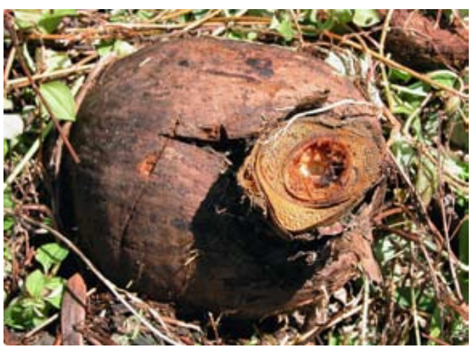
Cutting off the growing tip will kill the plant, such as here where a young seedling was cut off because it sprouted in an undesirable location. PHOTO: C. ELEVITCH

Falling coconuts are very hazardous and present a life-threatening danger, especially in homegardens, on beaches, and other places where people spend time. One way to reduce the danger is by regularly harvesting the nuts before they ripen and fall to the ground.