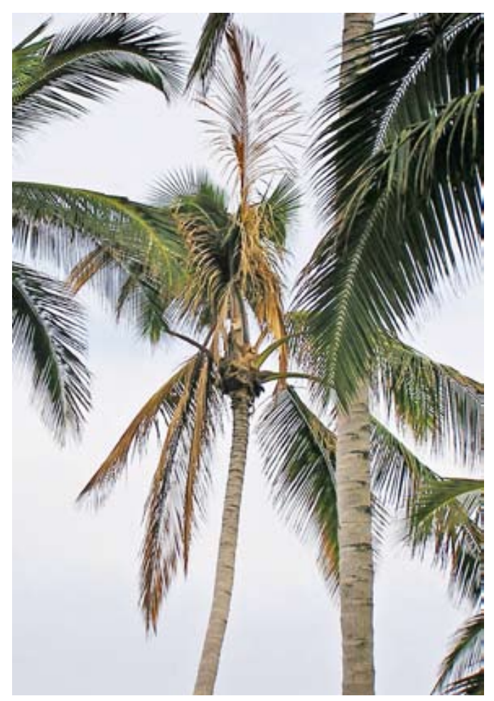
Symptoms of coconut heart rot.

As a commercial crop, the long period from planting to full bearing has discouraged planting. The price of the pri-