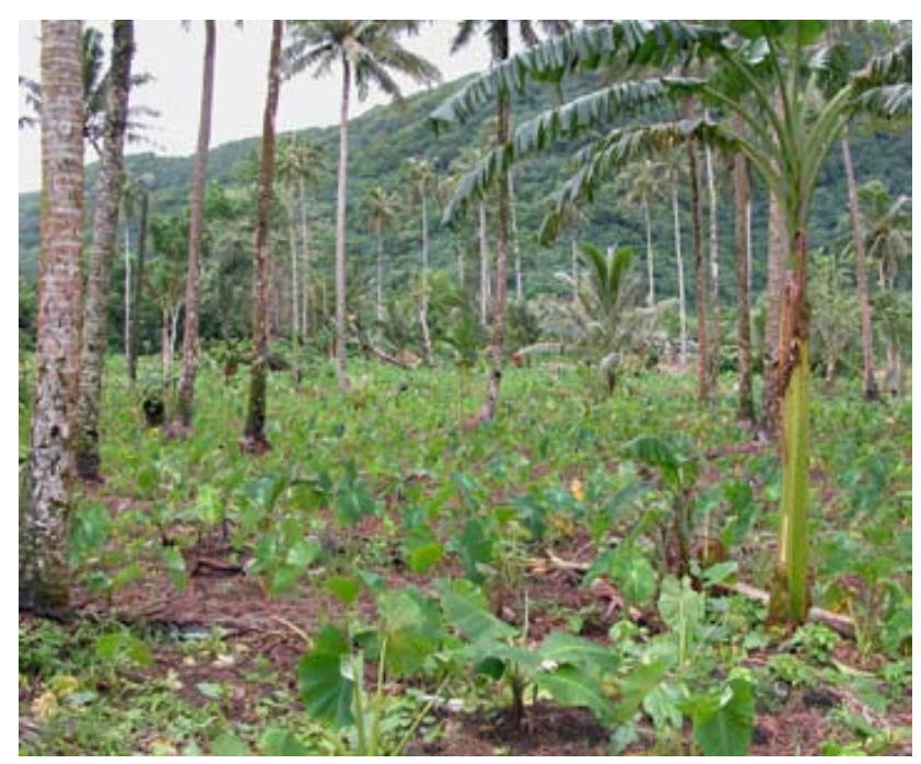
Taro and bananas growing under an old stand of coconuts, Tutuila, Samoa.

over. Betel nut ( Areca catechu ) and some ornamental palms are open to attacks by the pests and pathogens of coconuts grown nearby.