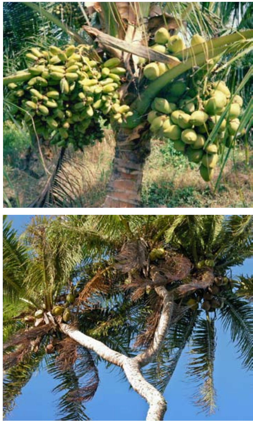
Top: A palm carrying hundreds of very small nuts. Known in Malaysia as "palm with a thousand nuts" (kelapa beribu ribu), it occurs only rarely and has only a curiosity value. Bottom: Branched coconuts are rare. This old coconut on Tongatapu, Tonga, has three branches with full tops loaded with coconuts.

Mature green fronds are woven into baskets, hats, mats, thatch, trays, fans, aquatic barriers, and all manner of plaited ware. The young leaves from a germinating nut are flexible and are used to make a foot harness tied between the feet for climbing coconuts. The unfurled immature leaves