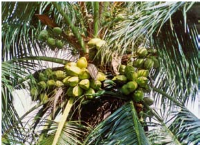
A heavy-bearing palm resulting from a cross between the 'Malayan Yellow' Dwarf and the 'West African' Tall. Yields up to 32 kg (70 lb) copra per palm per year have been recorded.

diseases" above). Generally, these are not treatable or preventable. Mulching with organic materials such as grass and plant clippings or compost will help conserve soil moisture while providing a steady source of organic nutrients, thereby encouraging plant health.