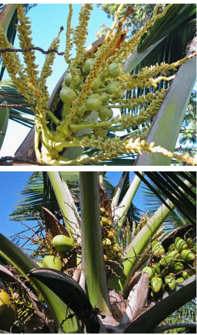
Top: Inflorescence showing spikelets, some bearing developing fruits at their base and all bearing or having borne hundreds of male flowers. Bottom: Fruit in different stages of development.

year. As leaves senesce about 2.5 years after unfolding, this means Talls have 30–35 leaves in their crown at any given time.