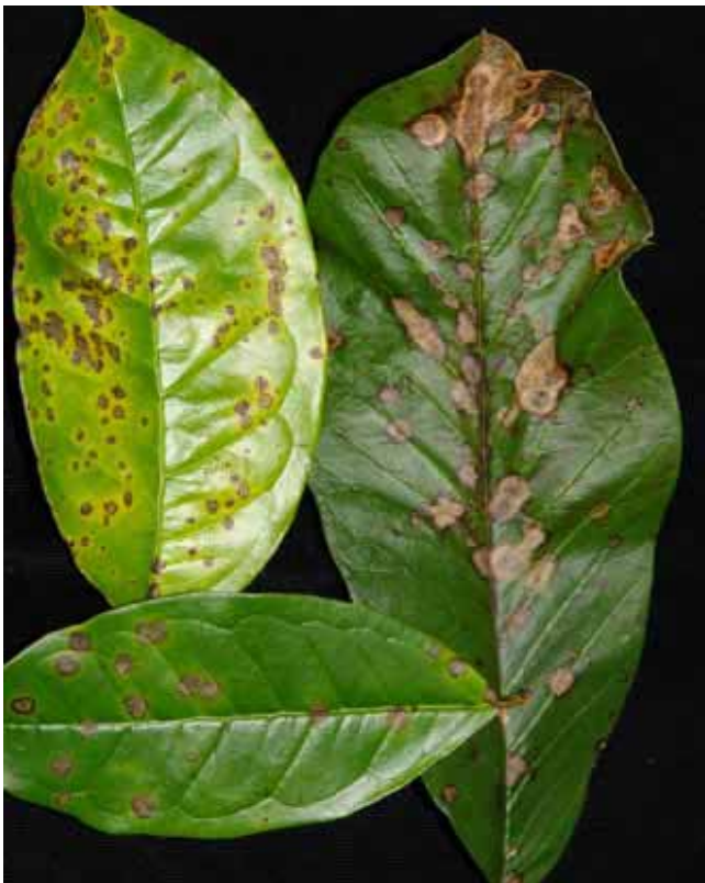
Guava cultivars may express symptoms differently. Here, leaves of three Psidium cultivars growing in a UH-CTAHR collection in the Hilo area display their unique reactions to association with Cephaleuros parasiticus .

Finding a number of different algal species on a leaf is common in shaded, moist environments. Most of the algae are not parasitic on plants. If you can easily rub off algae with your fingers, they are probably not plant parasitic.