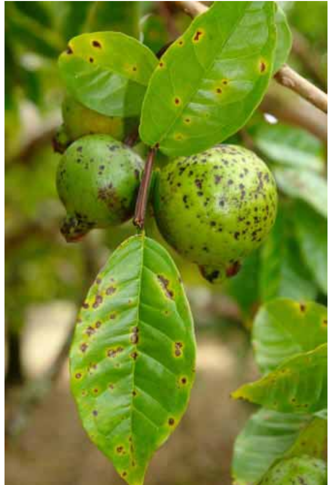
Algal leaf and fruit spot of guava caused by Cephaleuros parasiticus

Hosts are inoculated when sporangia or thallus fragments with sporangia are deposited on susceptible host tissues. Infection occurs and symptoms develop under moist conditions when motile zoospores are released from