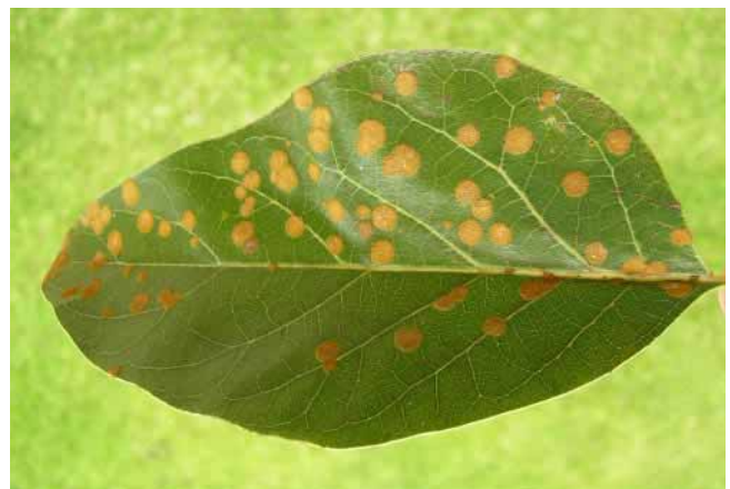
Algal leaf spot of avocado ( Persea americana ) in Hilo, Hawai'i, caused by Cephaleuros virescens

The disease is called algal leaf spot, algal fruit spot, and green scurf; Cephaleuros infections on tea and coffee plants have been called "red rust." These are aerophilic, filamentous green algae. Although aerophilic and terrestrial, they require a film of water to complete their life cycles. The genus Cephaleuros is a member of the Trentepohliales and a unique order, Chlorophyta, which contains the photosynthetic organisms known as green algae.