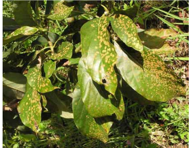
Typical raised, velvety, coppery brown algal spots on leaves of avocado ( Persea americana ) caused by Cephaleuros virescens . The spots consist of the brightly pigmented thallus of the plant parasitic algae.

Most fruit damage from Cephaleuros in Hawai'i probably occurs on guava and is associated with C. parasiticus . The damage to guava fruits is limited to the