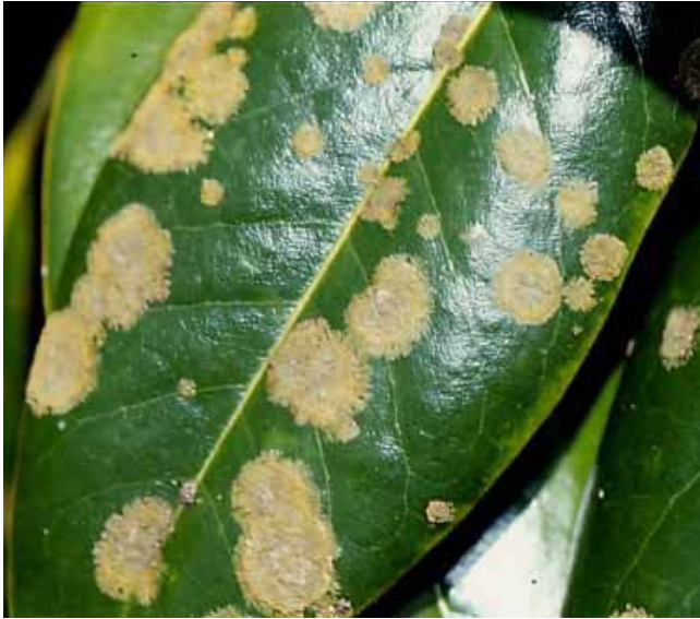
Algal leaf spot of magnolia ( Magnolia grandiflora ) in Kurtistown, Hawai'i caused by Cephaleuros virescens

as well some citrus ( Citrus spp.) cultivars. Cephaleuros species do not affect certain key subsistence crops in the Pacific, such as banana ( Musa spp.) and taro ( Colocasia esculenta ), although coconut and breadfruit are hosts for leaf spots.