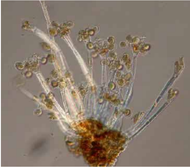
Cephaleuros parasiticus thallus and sporangiophores. Upon making a slide mount in a drop of water, zoospores may be released immediately (from material collected in American Samoa.)