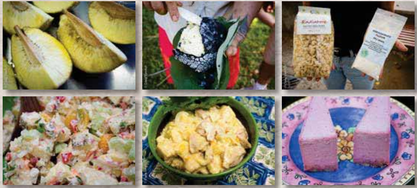
Clockwise from top left: Ready-to-eat steamed quarters; Removing blackened skin from fire-roasted breadfruit; Breadfruit pasta and flour; Pono Pies panini breadfruit pie; Breadfruit and chicken yellow curry; Breadfruit salad with local vegetables.

Another way to use breadfruit is to peel and core the raw fruit, shred or slice it into thin pieces, then dry and grind into a meal or flour. The coarse meal can substitute for panko or breadcrumbs. Since the flour is gluten free, it will not rise or have the elasticity of wheat flour, but can be used like other gluten-free flours.