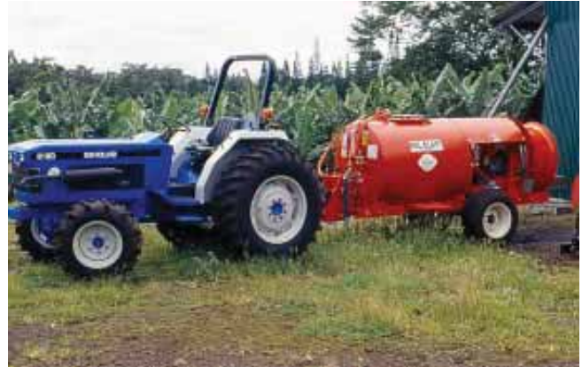
Mist-blower rig for fungicide applications