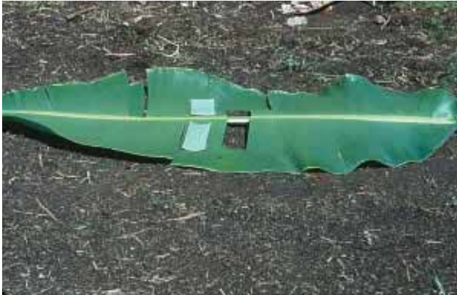
Leaf lamina sample to be analyzed for nutrient content in a crop-logging program