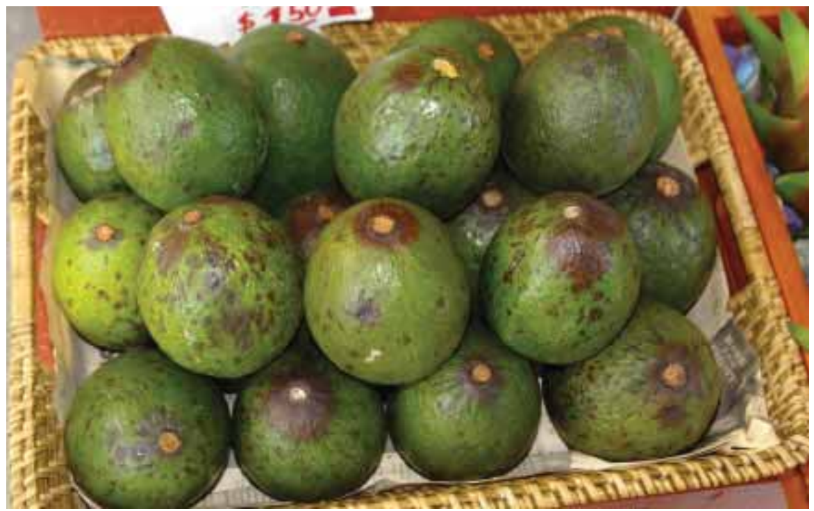
Spots and stem-end rots typical of anthracnose in a farmer's market near Kailua-Kona

pounds present in unripe skin usually inhibit pathogen growth. During and after fruit ripening, the pathogen grows rapidly through the peel and into the pulp of fruits.