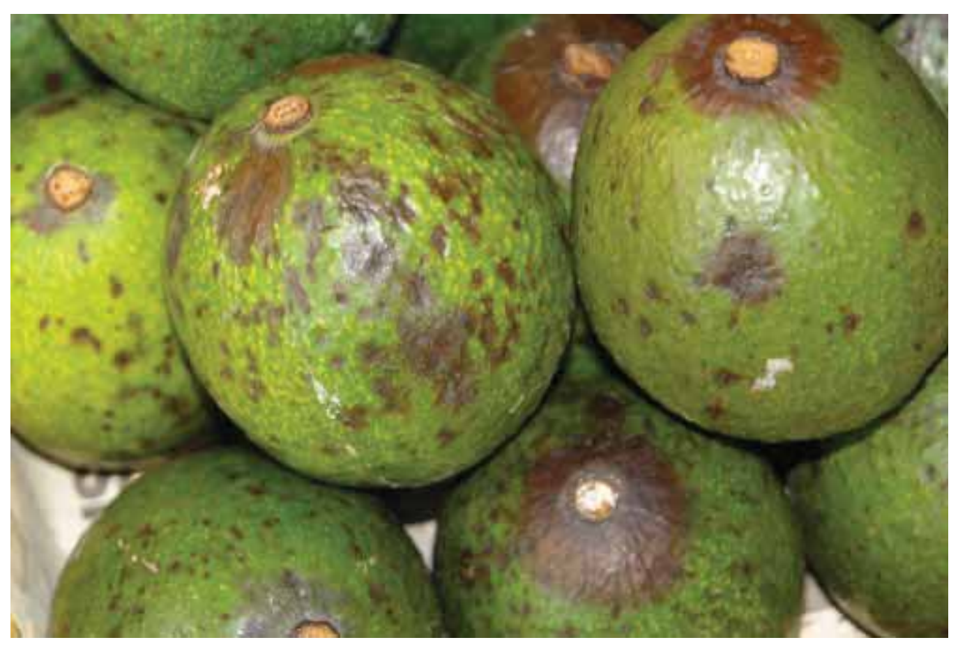
Anthracnose lesions on ripening avocado fruits in a farmer's roadside fruit stand near Kailua-Kona on Hawai'i. Plant-pathogenic fungi other than C. gloeosporioides can cause the stem-end rot symptoms shown here.

West Indian types) or thick, warty, and hard (Guatemalan types). The edible fruit flesh varies in fibrousness, color (greenish to yellowish), oil content, and flavor (mild and watery to rich and nutty). The avocado center of origin is Meso-America. Archaeological evidence indicates that humans have cultivated the avocado for at least 10,000 years. However, commercial development of avocado as a crop did not begin until the 20th century, following introduction of avocado plants to California.