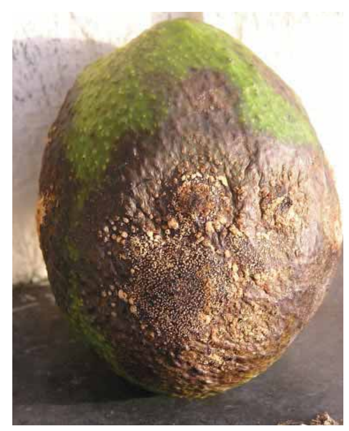
Large avocado anthracnose lesions; the fruit at right has masses of salmon-colored spores typical of the pathogen, C. gloeosporioides

The site of infection is primarily the fruits, but infections may also appear on leaves and stems. Unlike the form of anthracnose that infects mango, C. gloeosporioides does not attack avocado flowers.