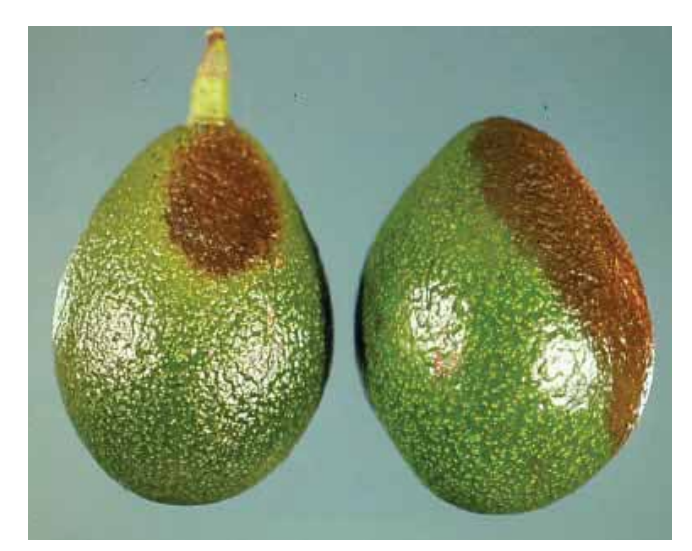
Anthracnose lesions on avocado