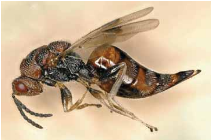
Figure 3. Adult of the annona seed borer, Bephratelloides cubensis .

Bephratelloides cubensis prefers to oviposit in fruits ranging from 1.5–5.5 cm (0.6–2 inches) in dia., which corresponds to 3–7 week-old fruit after bloom (Figure 4). Although fruits larger than 5.5 cm dia. (2 inches) are probed, when B. cubensis populations are high, most of these attacks do not result in infestation. Preferred fruit sizes presumably correspond with seeds that have not yet hardened and are easy to penetrate with the ovipositor, while the seeds of older fruits are probably too hard to penetrate. Larger fruits may be less preferred because the distance from the fruit surface to the seed may exceed the length of the ovipositor. The probes in young sugar apple and atemoya fruits look like