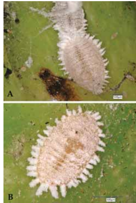
Figure 5. A) The mealybug, Planococcus minor infesting soursop. B) The mealybug, Planococcus minor infesting soursop. Determined by Z. Ahmed, 2 June 2017.

Several insecticides have been tested against this mealybug. However, most researchers agree that chemical and cultural control provides relief for a short period of time, or they are ineffective control methods.