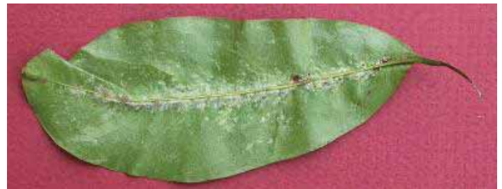
Figure 10. Leaf of soursoop infested with Aceria annonae .

Brevipalpus spp. can affect the epidermal surface of unripe soursoop fruit. The fruit becomes bronze colored with darker epidermal cracking and lighter striations, resembling rust. The eriophyid Aceria annonae infests leaves of soursoop and pond apple (Figure 10). There are no records of its economic damage or control.