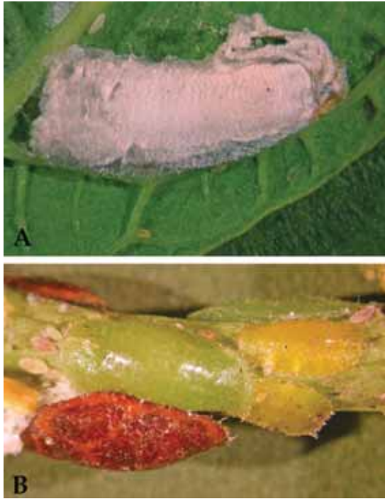
Figure 7. A) The female of Philephedra tuberculosa scale infesting atemoya. B) Females and crawlers of Philephedra tuberculosa scale infesting atemoya.