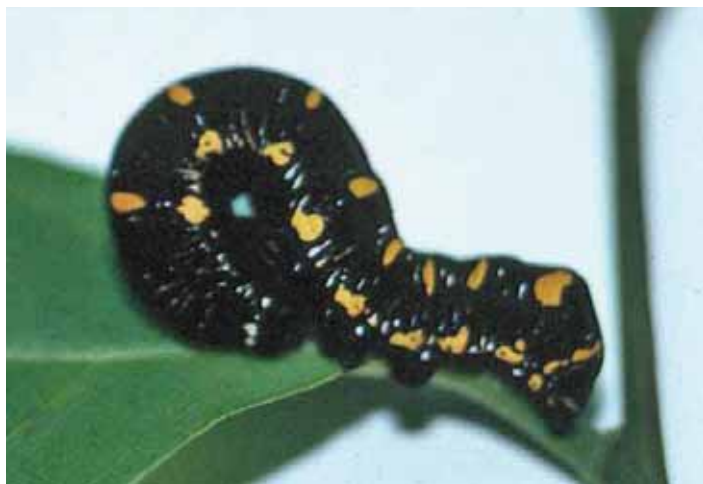
Figure 8. Larva of Gonodonta nutrix .

In Florida, larvae of the fruit piercing moths, Gonodonta nutrix (Figure 8) and G. unica , feed on tender leaves. They do not cause significant damage because they are heavily parasitized by a braconid wasp (Figure 9).