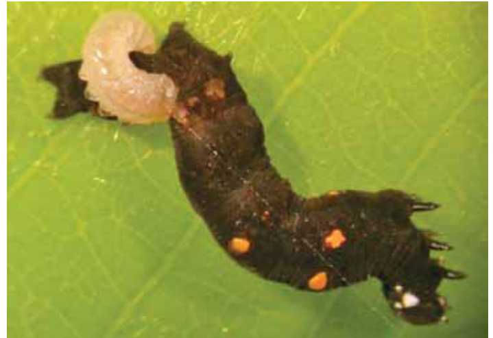
Figure 9. Gonodonta nutrix parasitized by a braconid wasp.