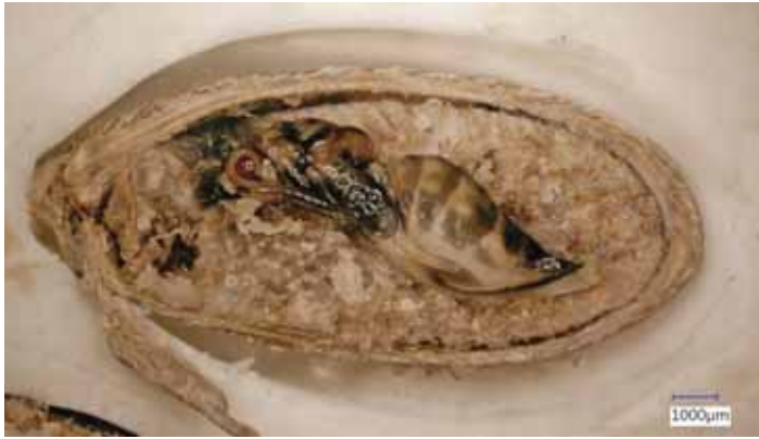
Figure 2. Pupa of the annona seed borer, Bephratelloides cubensis inside the seed.

Bephratelloides spp. develop strictly in Annona seeds (Figure 2). Economic damage occurs when the adults chew their way out of the fruit, creating a 2 mm dia. tunnel that provides entry for other insects and decay organisms. Bephratelloides cubensis (Figure 3) is thelytokous, reproducing without males. It has approximately 4–5 generations per year. The egg stage lasts 12 to 14 days, the larval stage 6–8 weeks, the pupal stage 12–18 days, and the adult rarely lives beyond 15 days.