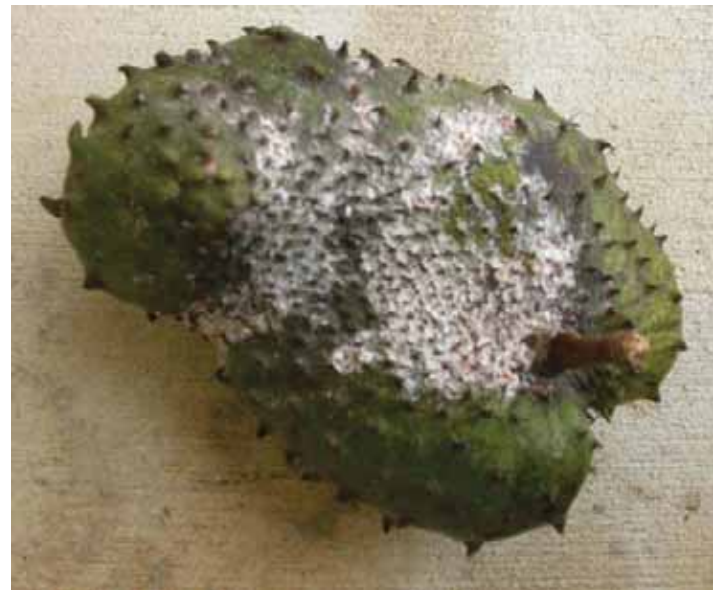
Figure 6. Pink hibiscus mealybug infestation on soursop.