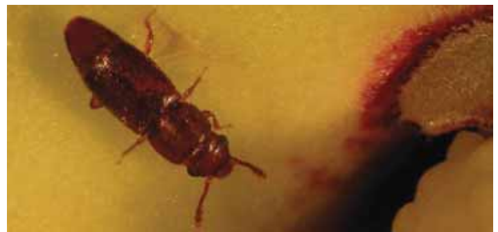
Figure 1. Sap beetle entering an atemoya flower.

In Florida, flowering of atemoyas begins in April, and sugar apples in May, and continues until early August. Nine species of native and exotic nitidulids visit the flowers (Figure 1), but Carpophilus mutilatus is the most important pollinator regarding efficacy and abundance in flowers, followed by C. fumatus and Haptoncus luteolus (Nagel and Peña 1989).