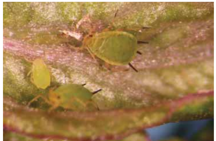
Figure 11. Aphids on a leaf.

The cotton aphid, Aphis gossypii Glover and the black citrus aphid, Toxoptera aurantii (Boyer de Fosncomolombe), may infest young leaf shoots (Figure 11).