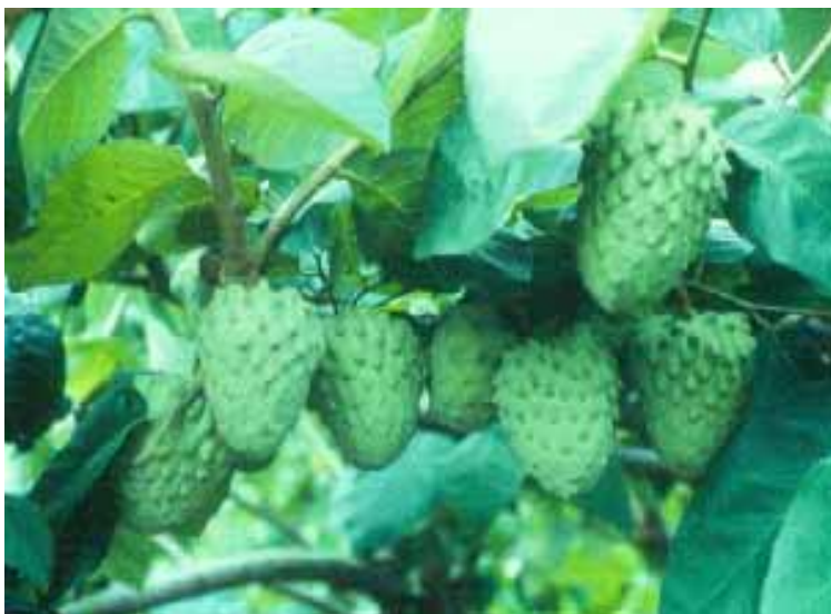
Fig. 4. Fruit of atemoya produced by artificial heteroflower pollination