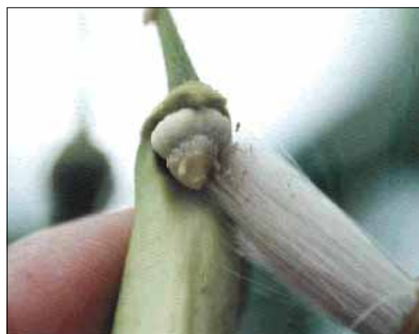
Fig. 2. Artificial pollination

Food and Fertilizer Technology Center (FFTC) 14 Wenchow St., Taipei, Taiwan ROC Tel.: (886 2) 2362 6239 Fax: (886 2) 2362 0478 E-mail: fftc@agnet.org Website: www.ffc.agnet.org FFTC: An international information center for small-scale farmers in Asia