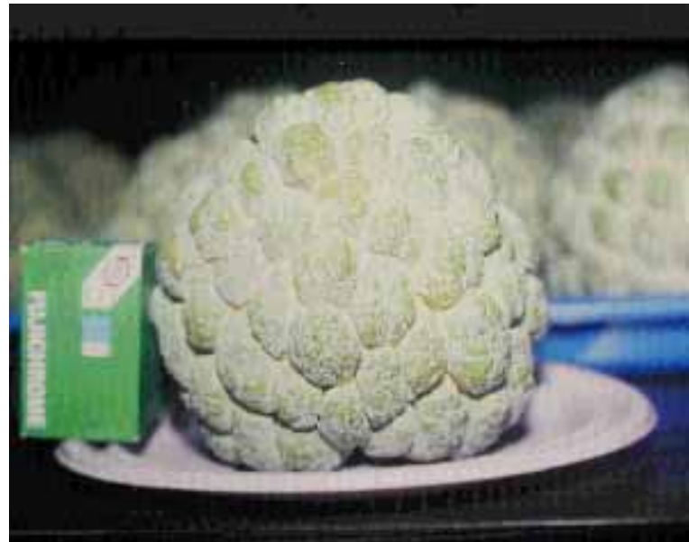
Fig. 3. Fruit of sugar apple produced by artificial heteroflower pollination.

which have a round, regular shape. Yields are higher, more stable from one year to the next, and fetch a higher market price.