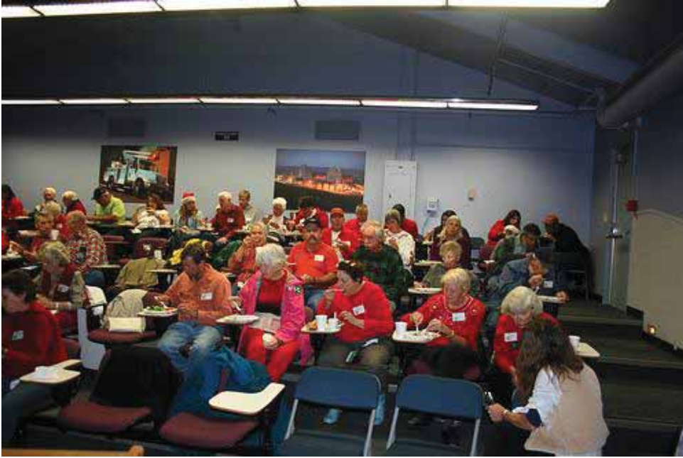
Lots of red! Food, fun, and conversation—it doesn't get much better than that! It was worth the trip out in the rain!