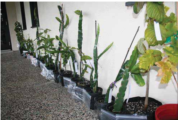
This is the best idea yet for streamlining a plant raffle!