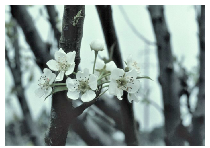
Figure 2. Pear flowering.