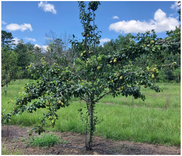
Figure 1. Pear tree with fruit.

Temperatures and diseases limit the varieties of pears that will grow in Florida. Temperatures of 26°F or below will usually kill open blossoms (Figure 2), so select varieties that will flower when temperatures in your area will be above this for most years (Table 1). Also, the number of chill hours in the winter (i.e., the amount of time temperatures are below 45°F) will affect which varieties will grow in your area. The information in Table 1 has been gleaned from various reports, only some of which were done by UF/ IFAS. Reported research was often done in north Florida (Monticello).