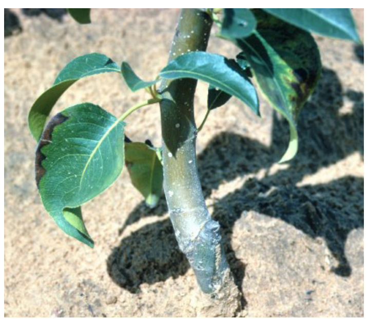
Figure 4. T-budded pear tree.

One- or two-year-old bare-root trees are best planted in late December through January to allow time for roots to establish before spring growth, but they may be planted any time during the dormant season. Container-grown trees may be planted at any time of the year if irrigation is carefully maintained.