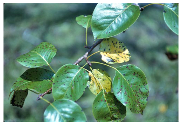
Figure 8. Pear leaf spot in Florida.

Pear leaf spot ( Fabraea maculata ) can cause leaves to turn brown and fall off the tree on some varieties (Figure 8). Prevent this damage by applying a copper fungicide at 10-to-14-day intervals starting immediately after bloom. Follow label instructions for rates. Copper fungicides may cause fruit russeting. Selecting a variety that is resistant to leaf spot makes maintenance of pear trees much easier.