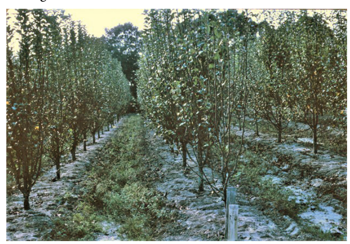
Figure 5. 'Carnes' pear. Upright growth typical of pear trees.

Pear trees have a very strong tendency to produce upright growth and branches with narrow crotch angles (Figure 5). Pears are pruned to remove dead or diseased wood and to shape the tree to improve branch strength and keep the fruiting area within reach. Excessive pruning may encourage vigorous growth that is more susceptible to fire blight. Trees are generally pruned to a modified leader system to keep the center more open and encourage the tree to spread, because pear trees generally have very upright growth. The modified leader is created by selecting three to four upright main branches from the central trunk and pruning them to increase lateral growth. Remove other main branches to keep the canopy open to air movement. See Figure 6 for details.