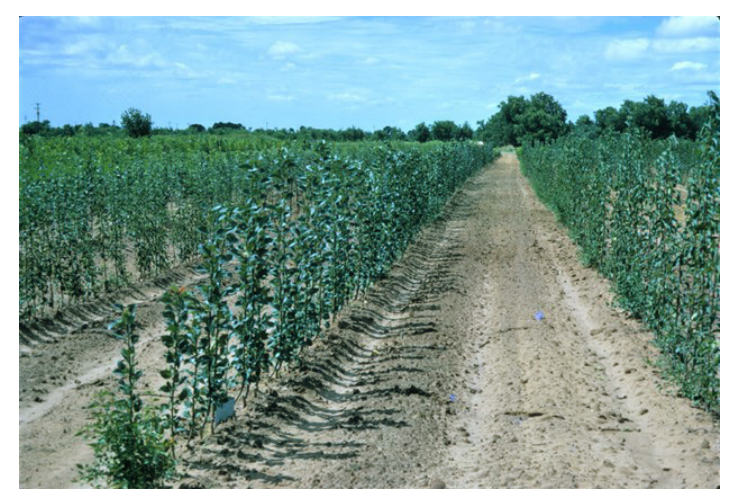
Figure 3. Nursery production of pear trees.

Pears do not come true to seed and so are sold as grafted selected cultivars on suitable rootstocks (Figures 3–4). Pears grow best on well-drained, fertile, sandy loam soil, but they can be grown on a wide range of soil types. Pear trees in Florida should be grafted on Pyrus calleryana rootstocks. In a five-year study, the growth and survival of 'Flordahome' and 'Hood' were best on P. calleryana , followed by P. betulaefolia . The remaining rootstocks in the study ( P. communis 'Old Home Farmingdale 51', 'Old Home Farmingdale 97', 'Old Home Farmingdale 333' and Cydonia oblonga ) were unsatisfactory.