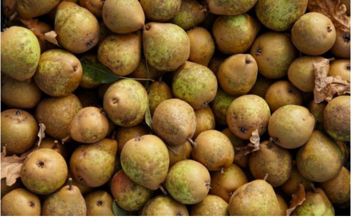
Figure 7. Harvest of 'Pineapple' pears.