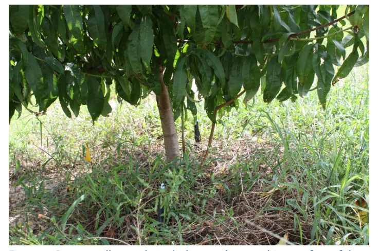
Figure 7. Remove all growth, including suckers, within two feet of the ground.