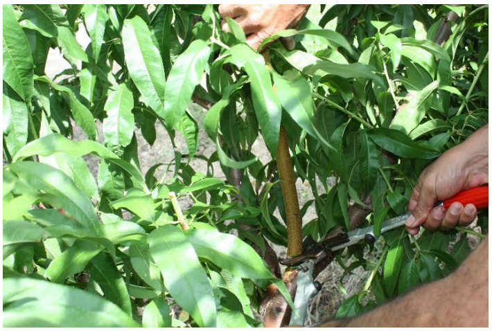
Figure 8. Remove strong water shoots in the center, while leaving weak lateral growth to protect scaffold sunburn. Credits: J. Popenoe, UF/IFAS

Step 4: Head back (manually or mechanically) branches with excessive blind nodes, which are sections of branches with no growing buds or leaves (Figure 9). Remove some laterals if growth is excessive. Remove any dead branches as well.