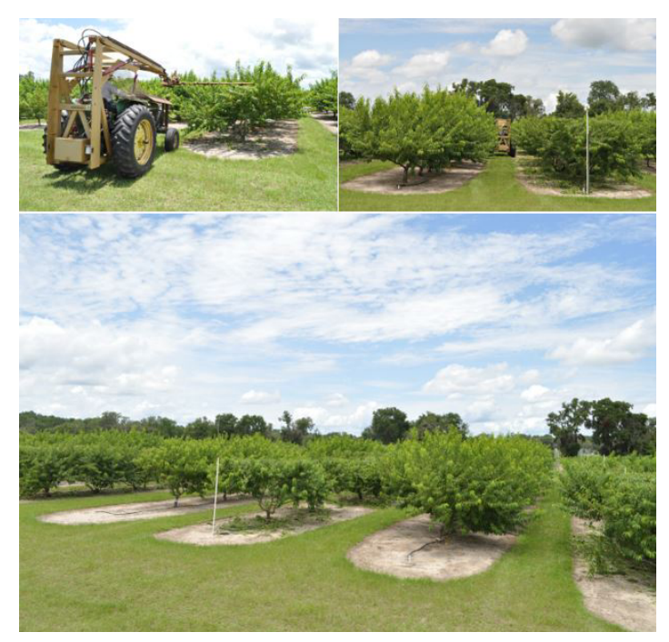
Figure 6. Top back the tree to a manageable height.