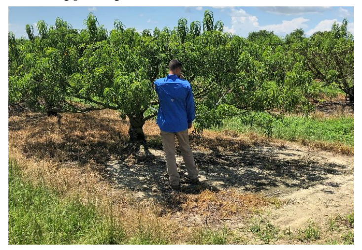
Figure 2. Ten-year-old peach tree 'UFSun' grown in Fort Pierce, Florida.

One of the goals of summer pruning is to bring the canopy size under control by encouraging a larger number of lateral branches growing along a greater span of the main scaffolds, effectively keeping the root-to-shoot balance intact on a smaller framework (Figure 2). This smaller framework favors efficient crop production because harvestable fruit is within arm's reach, thinning can be done from the ground, and spray treatments can have better coverage. Keeping the canopy size more compact will also reduce the need for ladders and allow harvesting from ground level, which improves picking efficiency. The amount of pruning required in winter is greatly reduced and pruning cuts in winter take longer to heal than cuts made on actively growing shoots in the summer. This lowers the overall incidence of disease infiltrating pruning cuts.