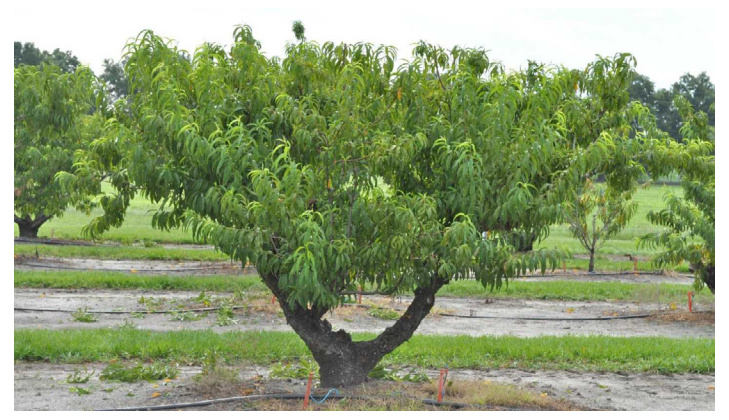
Figure 11. A finished example of summer-pruned peach tree 'Tropicbeauty' grown in Citra.