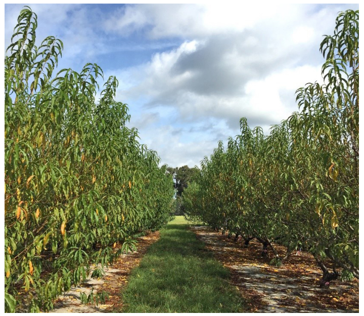
Figure 1. 'UFSun' peach cultivar growth after the harvesting period in June.

After the harvest season in any peach orchard, large or small, while daily picking may have ceased, the focus quickly shifts to how to manage the trees to support the subsequent year's crop. The strong apical dominance of peach trees will cause them to continuously put energy into upward growth, which ultimately shades out and hinders the development of fruiting wood in the lower portion of the canopy. Low-chill peach trees growing under Florida conditions can become vigorous and large. They have a short period of winter rest and a long growing season after the harvesting period, extending up to 200 days. Water sprouts also develop rapidly in the summer, causing denser vegetation and restricting airflow. Especially in subtropical peach-growing regions, summer pruning is a management strategy that can be applied to help restructure the canopy, direct the tree's resources into fruit production, and improve the efficiency of fieldwork. Without summer pruning, peach orchards in subtropical regions will continue to grow vigorously and, if left unmanaged, will reach a point at which ladders will be required to harvest and maintain the trees (Figure 1). Summer pruning can be a means of reducing overall tree size, redistributing fruiting wood for easier harvesting, reducing disease pressure, and increasing fruit quality.