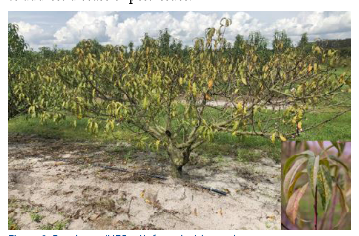
Figure 3. Peach tree 'UFSun' infected with peach rust.

Foliar diseases are more common during the summer when vegetative growth gets dense and causes increased humidity and decreased airflow. Peach rust ( Tranzchelia discolor ) is considered an important postharvest fungal foliar disease in the Florida climate, where summer rainfall provides favorable conditions for peach rust development (Figure 3). If not managed, this disease causes early defoliation with a significant negative impact on next season's flowers and fruit (https://edis.ifas.ufl.edu/hs1263). All currently available peach cultivars in Florida are susceptible to the disease. Increased airflow associated with pruning will help reduce disease pressure. Altering the canopy structure this way can also improve the penetration of foliar sprays used to address disease or pest issues.