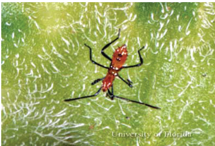
Figure 2. Nymph of the leaffooted bug, Leptoglossus phyllopus (L.).

Several species of Leptoglossus and other coreids have foliaceous hind tibiae, which give rise to the common name “leaffooted bug,” but only Leptoglossus phyllopus has this as an accepted common name. Adults of Leptoglossus phyllopus generally are chestnut brown, reveal various amounts of orange on the dorsal abdomen when the wings are raised, and vary from 1.6 to 1.9 cm long (5/8 to 3/4 inch). Nymphs (Figure 2) have much the same shape as adults, but do not acquire the flattened leaf-like hind tibial expansions until well along toward becoming adults. Eggs are golden brown and are laid in a single row or chain along a stem or leaf midrib. They are somewhat cylindrical, flattened on the undersides and at the ends, and are closely laid end to end, forming a stiff cylindrical rod in which each egg appears as a joint or cell. For additional aid on the identification of Leptoglossus consult Blatchley (1926), Hussey (1953), or Allen (1969).