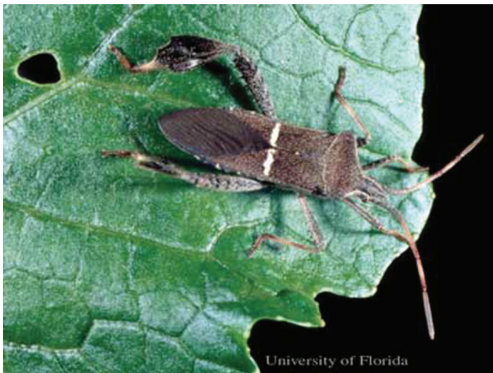
Figure 1. Adult leaffooted bug, Leptoglossus phyllopus (Linnaeus).

The leaffooted bug, Leptoglossus phyllopus (Linnaeus) (Figure 1), is a widespread and conspicuous minor pest of many kinds of crops, including fruits, vegetables, grains, nuts, and ornamentals. It has been reported as a major pest in citrus groves, where its feeding on ripening fruit causes premature color break and fruit drop. Serious infestations do not occur often, but a large proportion of the crop may be lost when they do.