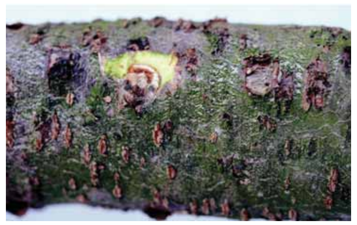
Figure 3. A peach limb with the blister symptom of fungal gummosis caused by Botryosphaeria dothidea .

After initial infection, necrotic lesions in phloem and cortex tissues (Figure 2B) continue to expand under the bark. In old tissue, sunken necrotic lesions form and will frequently be sites of gum release. The most noticeable symptom of infection is the gum exudates on the stems and branches of the tree (Figure 4). Vascular clogging from