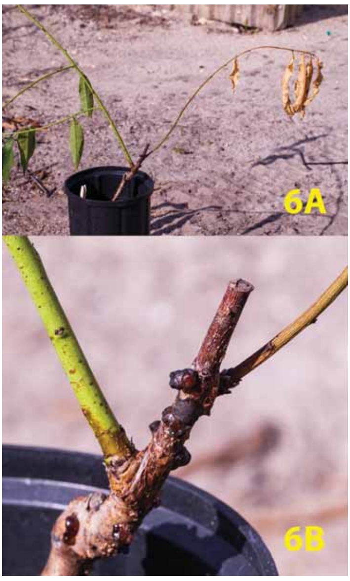
Figure 6. Grafted peach (6A) and a magnified view (6B) with gumming lesions and dieback from the top caused by Botryosphaeria species.

Symptoms vary depending on the season, and susceptibility to this disease is highly variable among peach cultivars (Beckman et al. 2012; Beckman and Reilly 2005). Symptoms are most visible in the southeast from June to October.