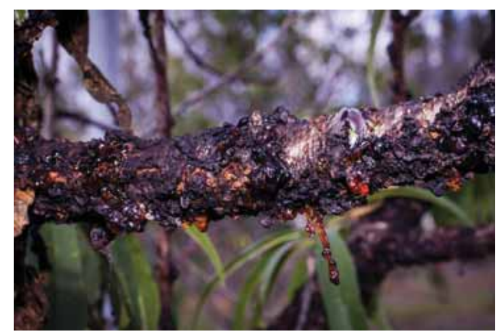
Figure 1. Peach limb with a severe fungal gummosis infection by Botryosphaeria spp.

In the southeastern United States, PFG has been reported since the early 1970s in major peach-producing areas where the damage may reduce the yields up to 40% (Weaver 1974; Biggs and Britton 1988; Beckman, Pusey, and Bertrand 2003). This disease was first reported on peach and citrus trees in Florida in 1911 by Fawcett and Burger. Taxonomy