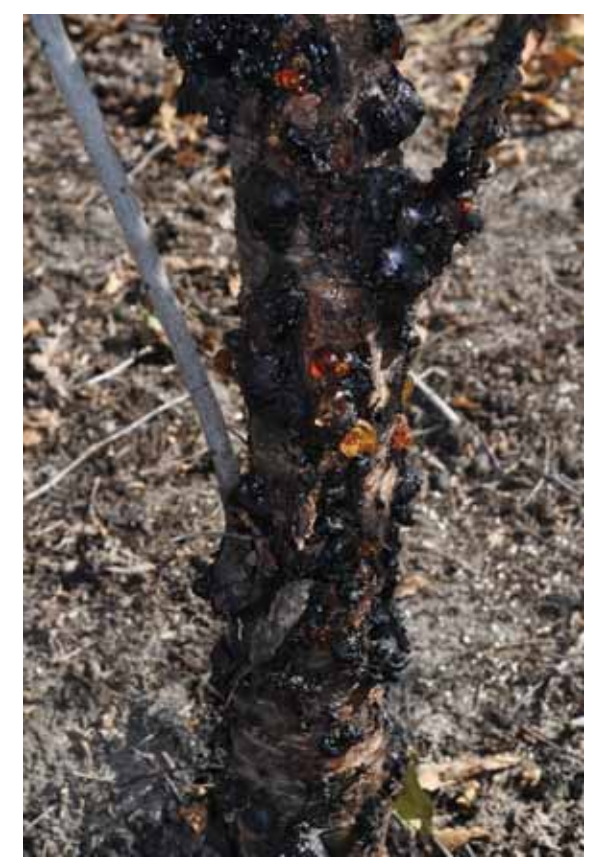
Figure 4. 'Flordaguard' peach rootstock infected with fungal gummosis showing gumming lesions and swollen lenticels.