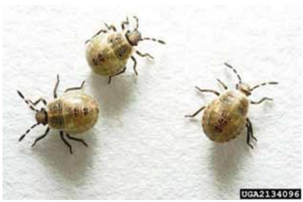
Figure 8. Fed second instar nymphs of the brown stink bug, Euschistus servus (Say).