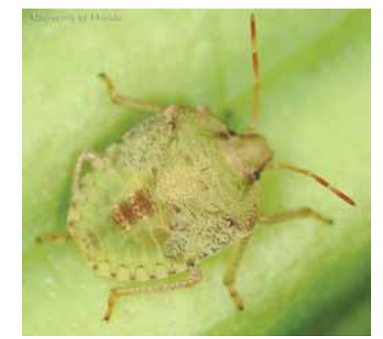
Figure 11. Fifth instar nymph of the brown stink bug, Euschistus servus (Say).

Each female oviposits about 18 egg masses, averaging 60 eggs, over a period of >100 days. Approximately four to five weeks are required from hatching to adult emergence. Euschistus servus have as many as four to five or more generations per year in Florida. Adults are strong fliers and will readily move between weeds and other alternate hosts.