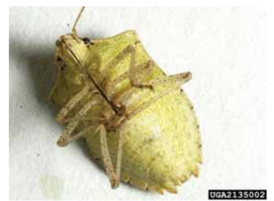
Figure 4. Ventral view of adult female brown stink bug, Euschistus servus (Say).

The eggs are yellowish-translucent, but their color starts turning toward a light pink before hatching.