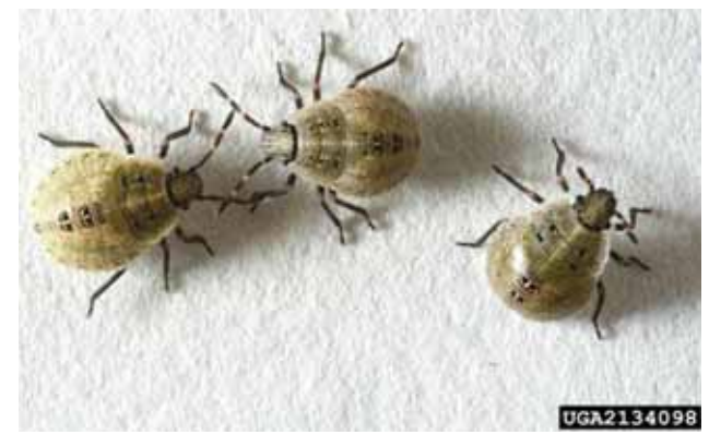
Figure 9. Fed third instar nymphs of the brown stink bug, Euschistus servus (Say).