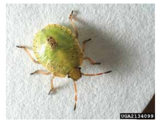
Figure 10. Fourth instar nymph of the brown stink bug, Euschistus servus (Say).