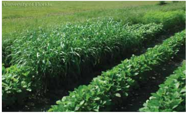
Figure 14. Trap crops for stink bugs.