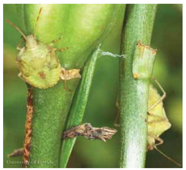
Figure 12. Nymph (left) and adult (right) brown stink bug, Euschistus servus (Say).