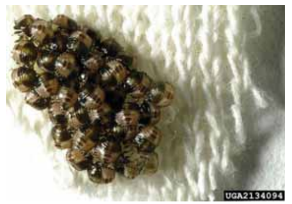
Figure 7. First instar nymphs of the brown stink bug, Euschistus servus (Say).