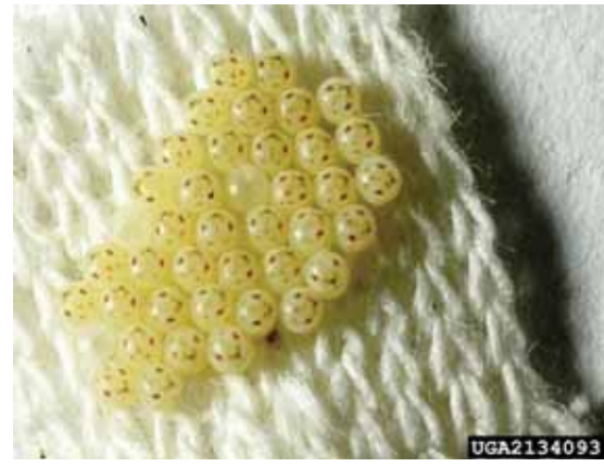
Figure 6. Five-day-old egg mass of the brown stink bug, Euschistus servus (Say).