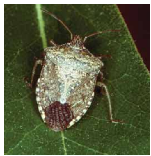
Figure 2. Adult brown stink bug, Euschistus servus (Say).

The fourth and fifth antennal segments are darker in color. The ventral surface usually has a pinkish tinge. Cheeks are large, passing the clypeus in length and more pointed. The humeral angles of the pronotum are rounded. The body length varies from 10 to 15 mm for adults.