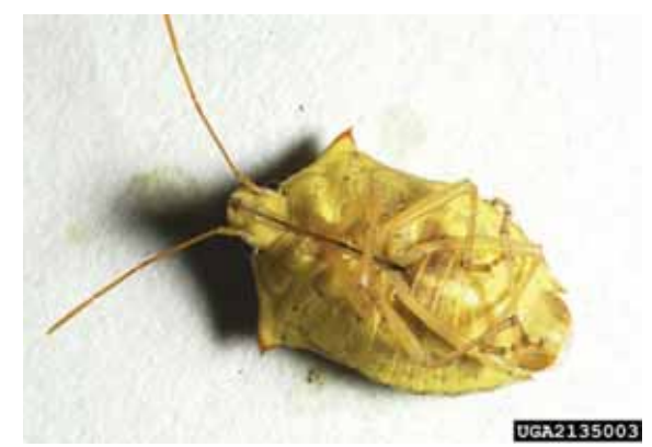
Figure 3. Ventral view of adult male brown stink bug, Euschistus servus (Say).