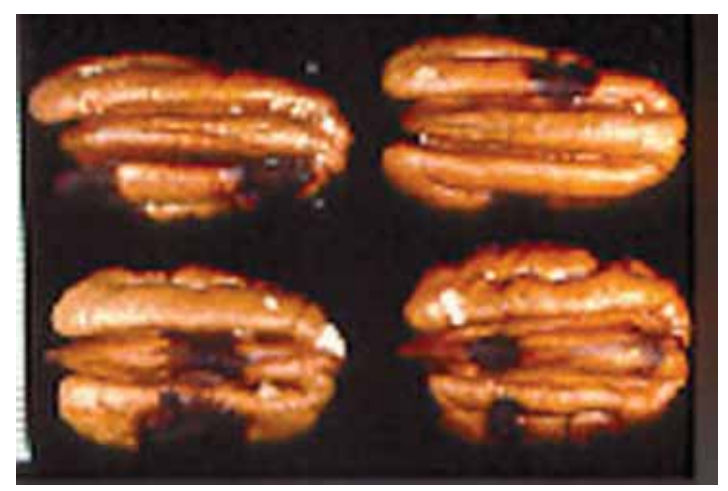
Figure 1. View of kernel spots on four nuts caused by feeding from the brown stink bug, Euschistus servus (Say).

Under drought conditions, the bugs may attack fruit in much higher numbers. In peaches, stink bugs are also called catfacing insects because, after the tissue is injured, the surrounding, healthy plant tissue continues to grow, resulting in a scar that resembles a cat's face. It should also be noted that other stink bug species may also cause similar damage in central and south Florida peach. In pecans, they are termed kernel feeding insects because they injure the nut kernels by feeding, with most injury occurring in late season.