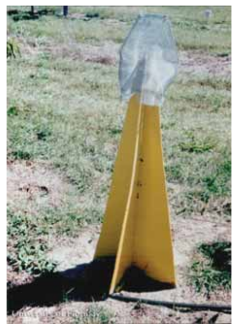
Figure 13. Florida stink bug trap.

Monitoring can be done by direct tree examinations and fruit damage counts. Beating tray sampling, sweep sampling and using the Florida Stink Bug Trap with the aggregation pheromone are also ways of monitoring and capturing them. Trap crops of triticale, buckwheat, sorghum, millet, and sunflower may be grown on the exterior of gardens, orchards and other types of production areas to intercept the stink bugs before they enter the cash crop. Small growers may wish to grow the trap crops in large containers so that they can be easily moved to where they are needed.