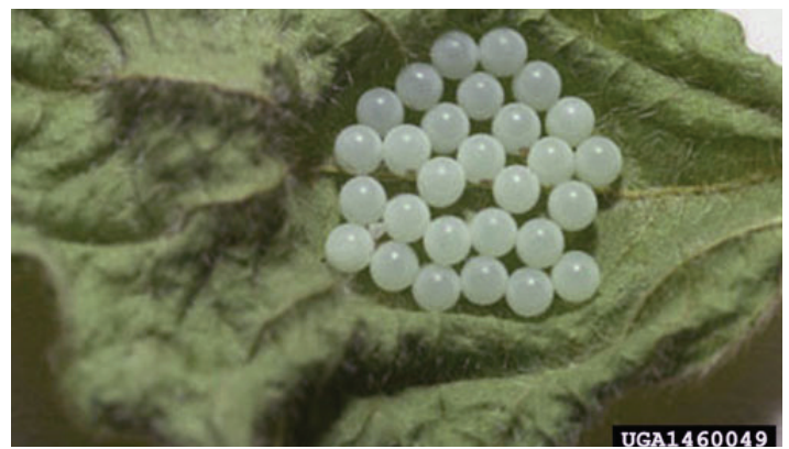
Figure 3. Eggs of the brown marmorated stink bug, Halyomorpha halys (Stål).

legs and antennae (Figure 5). Nymphs of the rough stink bugs, Brochymena spp., may be confused with the brown marmorated stink bug nymphs due to the presence of spiny projections on the humeral margins and stripes on the legs; however, Brochymena nymphs lack the well-defined white stripes on the antennae (Figure 6).