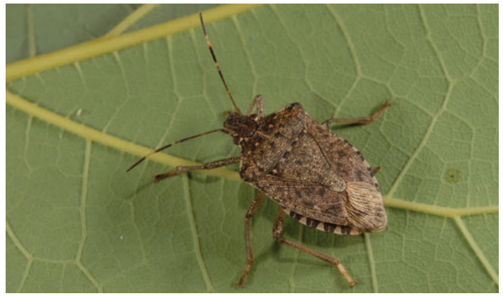
Figure 1. An adult brown marmorated stink bug, Halyomorpha halys (Stål).