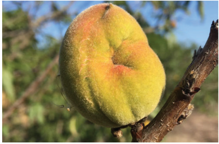
Figure 8. Cat facing injury to a developing peach fruit. This injury is typical of stink bug feeding, such as that caused by the brown marmorated stink bug, Halyomorpha halys (Stål). Other stink bugs in Florida, such as Euschistus servus (Say) and the leaffooted bug, Leptoglossus phyllopus (L.) can cause cat facing injury.

In addition to the economic losses from direct crop damage and increased control costs, the spread of the brown marmorated stink bug has severely disrupted established IPM programs, leading to increased use of broad-spectrum pesticides. While the careful and judicious use of pesticides has a high degree of safety, negative impacts to the environment and a reduction in populations of natural enemies in agricultural areas are associated with their use. The indirect costs associated with increased pesticide use following the establishment of the brown marmorated stink bug are difficult to measure but are undoubtedly significant.