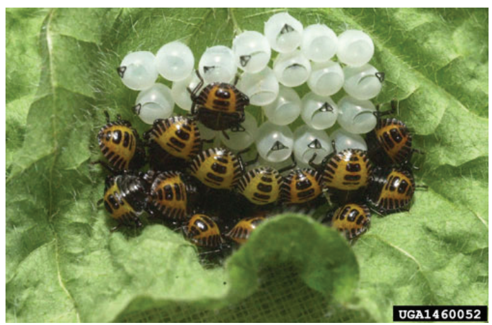
Figure 4. Recently hatched nymphs of the brown marmorated stink bug, Halyomorpha halys (Stål), aggregated near their egg clutch.