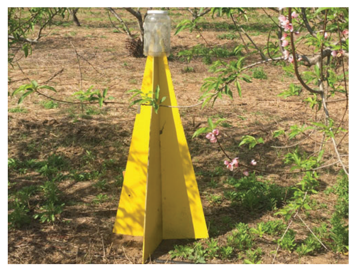
Figure 9. A pyramid trap used to monitor stink bugs in a peach orchard. A pheromone lure attractive to the brown marmorated stink bug, Halyomorpha halys (Stål), is placed inside the trap top to increase trap capture. A black trap is most commonly used for the brown marmorated stink bug.

of 70% parasitism from a number of hymenopteran egg parasitoids, however the parasitism rate for native egg parasitoids in the eastern United States is significantly lower, often below 10% (Ogburn et al. 2016).