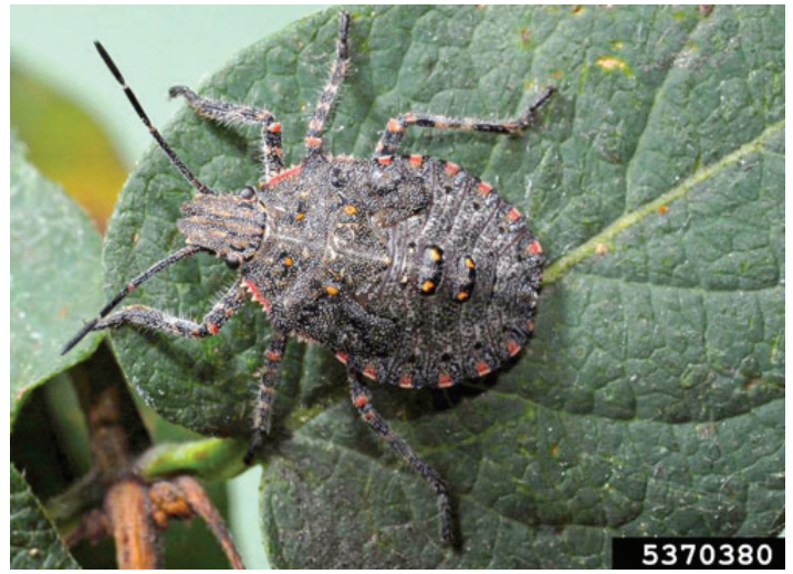
Figure 6. Late instar nymph from the genus Brochymena . Nymphs from this genus may be mistaken for the brown marmorated stink bug, Halyomorpha halys (Stål), nymphs due to the presence of spines on the humeral margins. They can be differentiated from the brown marmorated stink bug nymphs by the absence of clearly defined white stripes on the antennae.