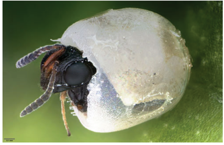
Figure 10. The samurai wasp, Trissolcus japonicus (Ashmead), an egg parasitoid of the brown marmorated stink bug, Halyomorpha halys (Stål), emerging from a stink bug egg. The samurai wasp has been approved for release as a biological control agent in some areas.

this biological control agent will reduce populations of the brown marmorated stink bug to an acceptable level.