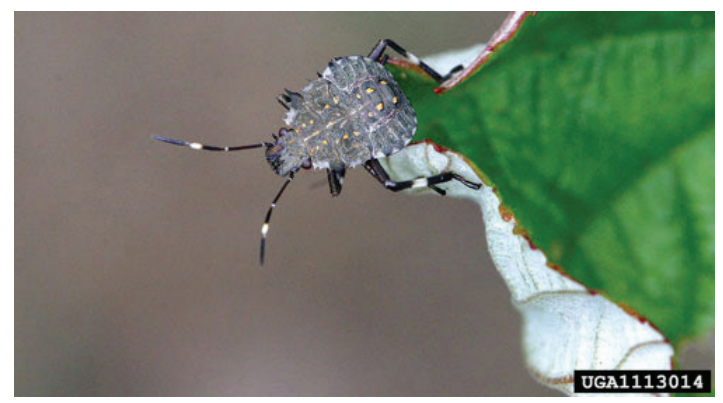
Figure 5. Late instar nymph of the brown marmorated stink bug, Halyomorpha halys (Stål).